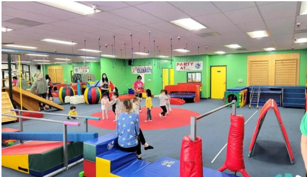
My gym exercise