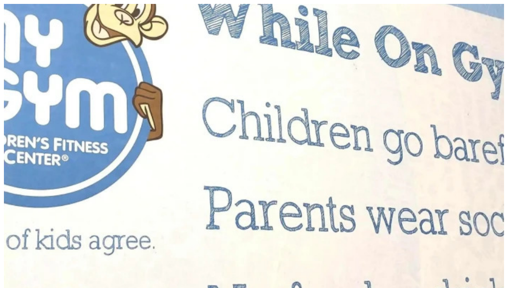
My gym walnut creek