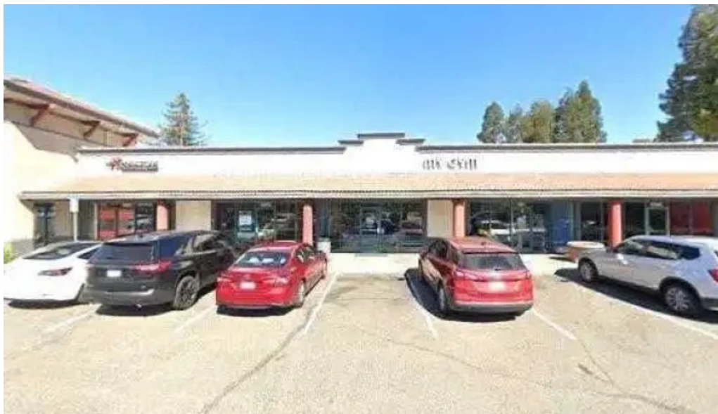
My gym street view 360deg