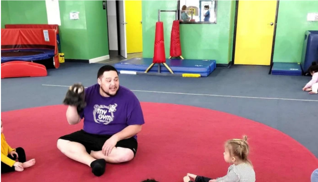
My gym schedule