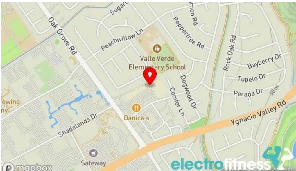
My gym map