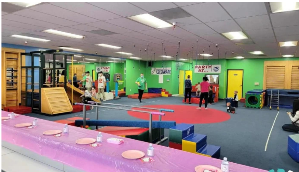
My gym all