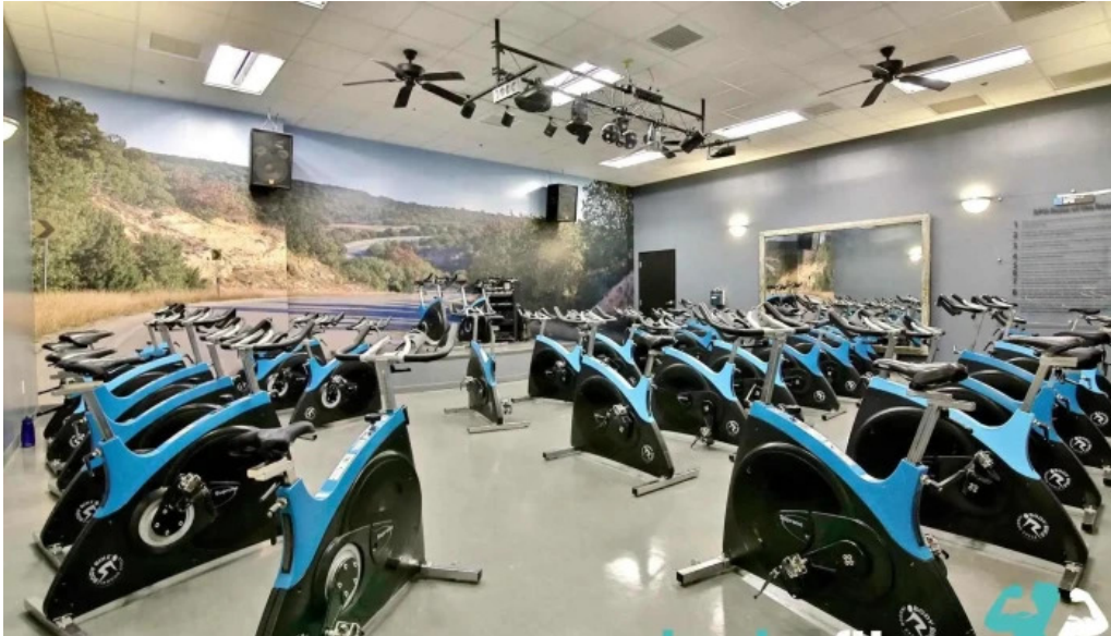
Hendrick health club all