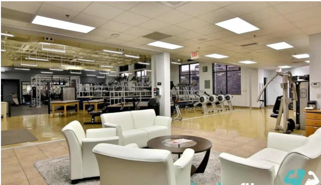
Hendrick health club reception