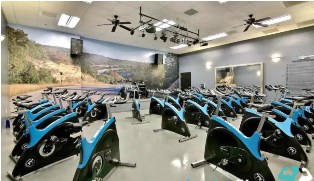
Hendrick health club abilene