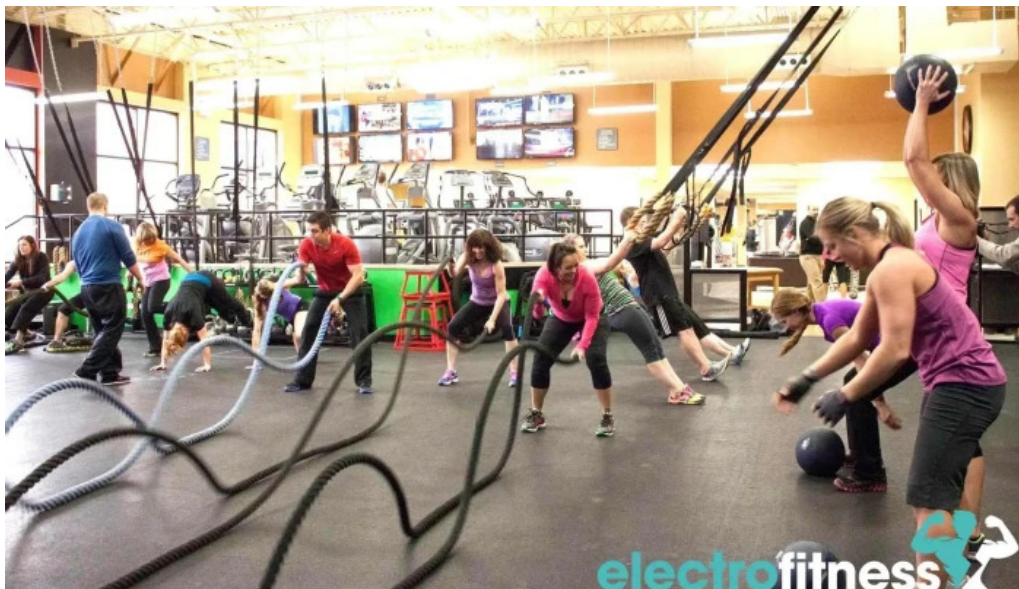
Hendrick health club by owner