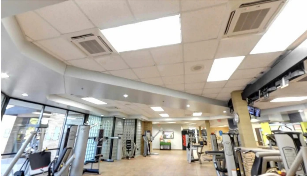
Hendrick health club street view 360deg