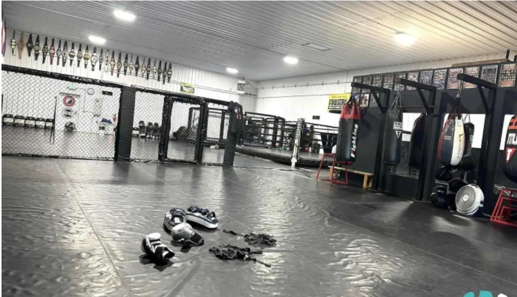
Dynamic training fitness all