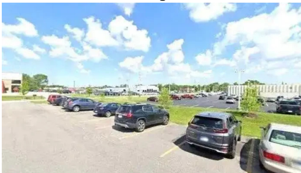
Dynamic training fitness street view 360