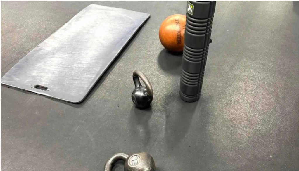
Dynamic training fitness by owner