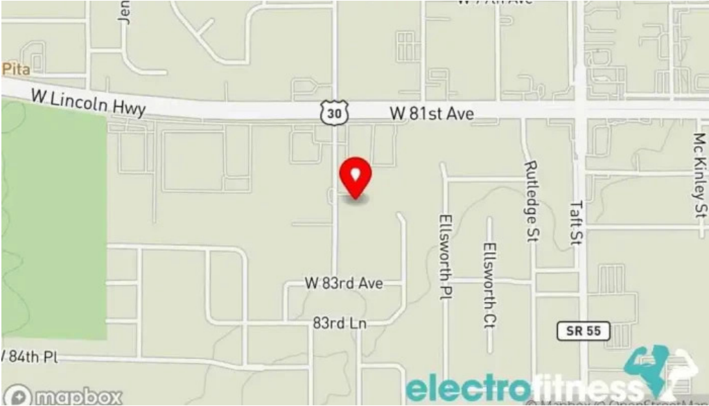
Dynamic training fitness map