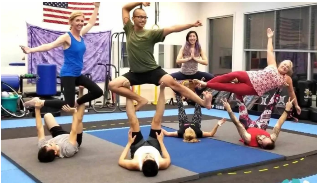
Moncreaffs martial arts yoga and fitness by owner