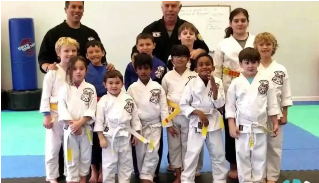
Moncreaffs martial arts yoga and fitness community