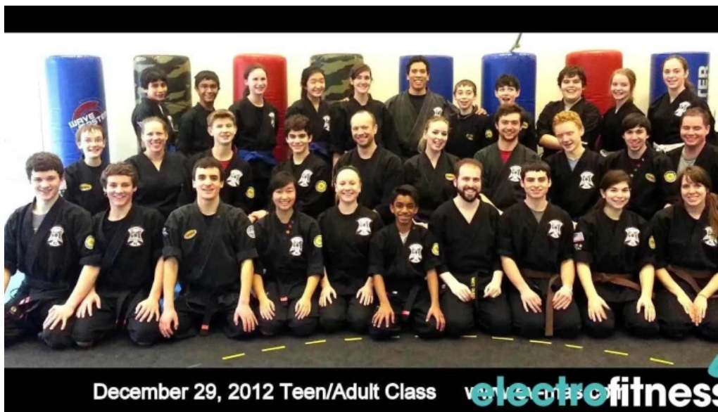
Moncreaff s martial arts yoga and fitness acton