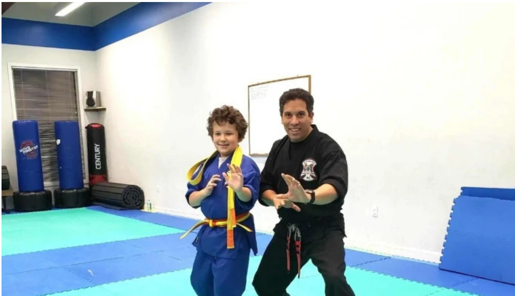
Moncreaffs martial arts yoga and fitness martial arts school