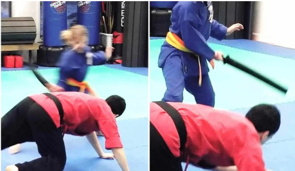
Moncreaffs martial arts yoga and fitness martial art