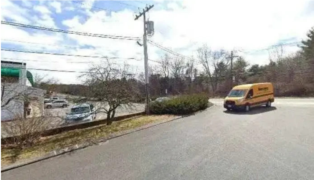
Moncreaffs martial arts yoga and fitness street view 360deg