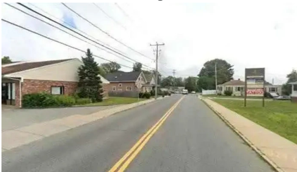
Gonsalves tae kwon do school street view 360deg