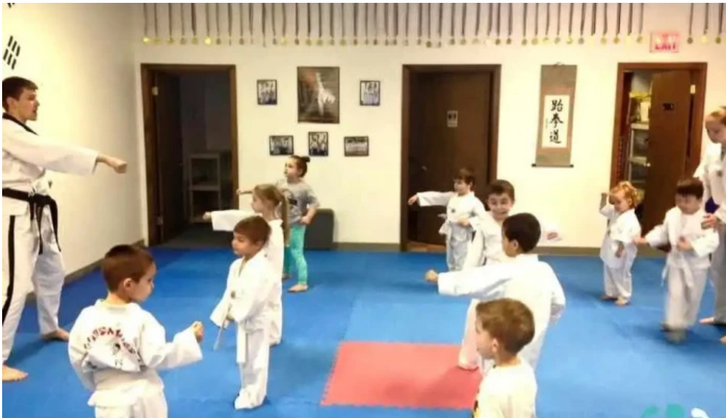
Gonsalves tae kwon do school acushnet