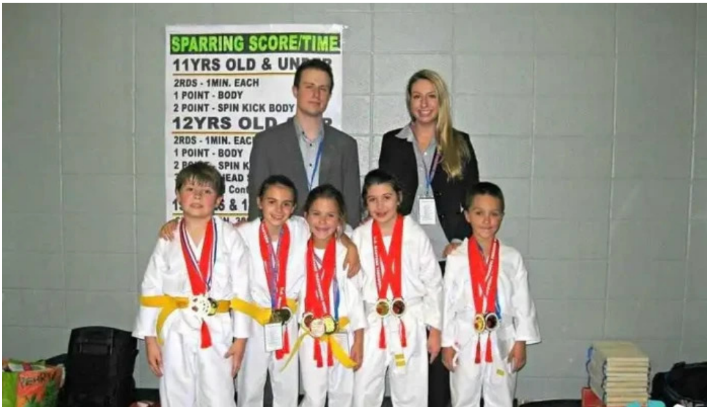
Gonsalves tae kwon do school community