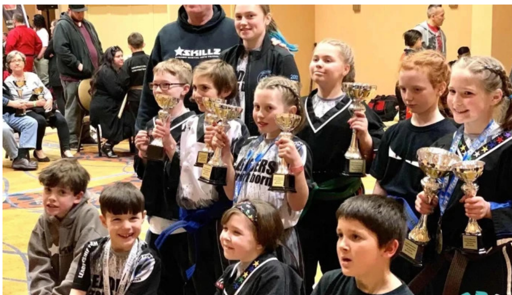
The pond martial arts center uniform