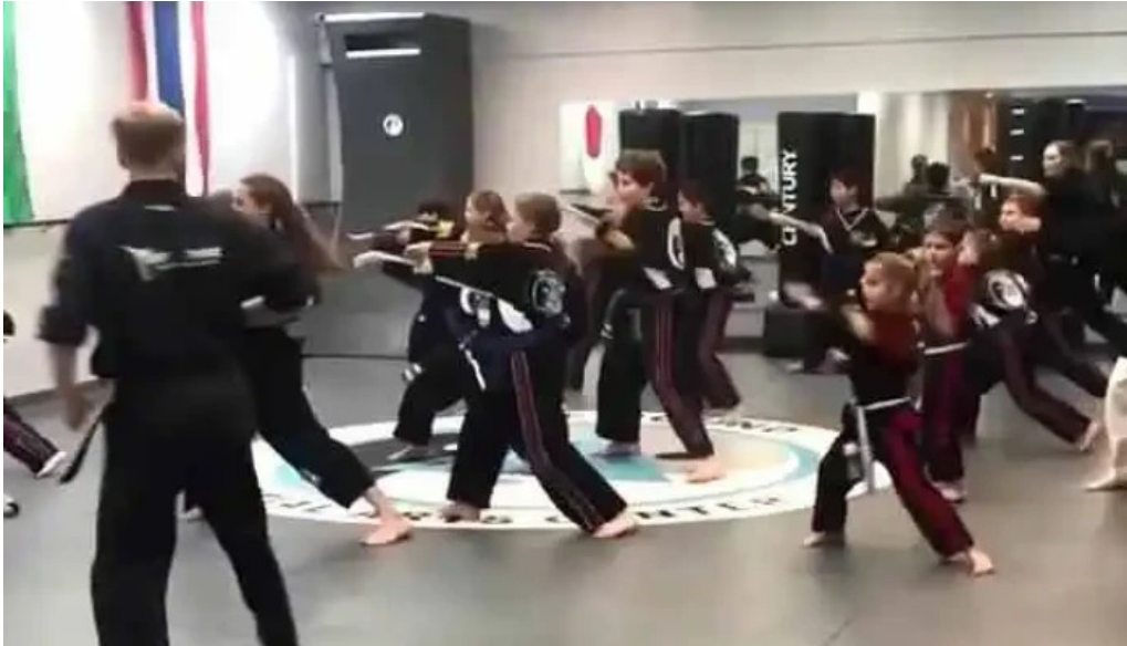
The pound martial arts center by owner