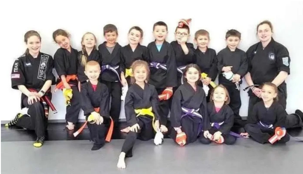
The pound martial arts center community