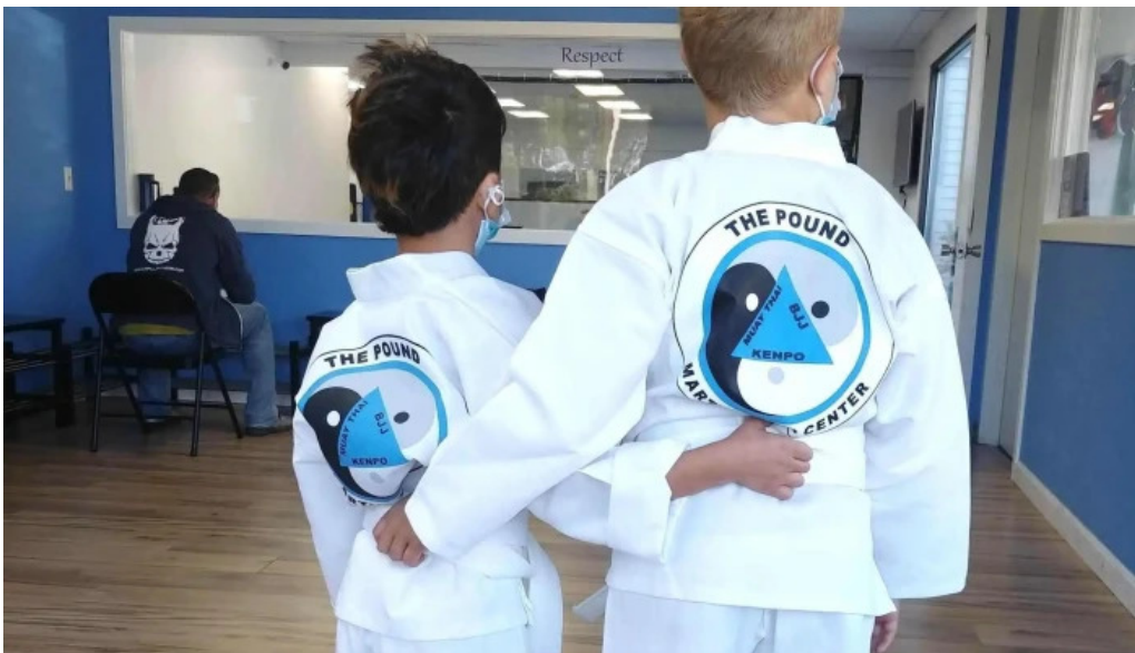
The pound martial arts center martial arts school