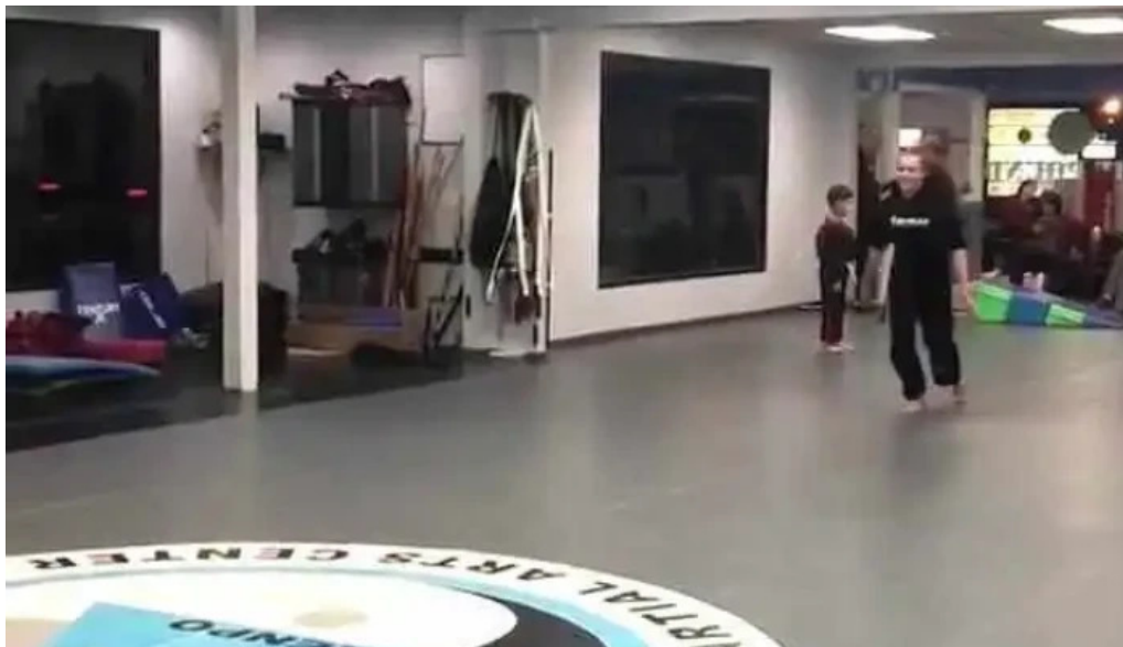
The pond martial arts center videos