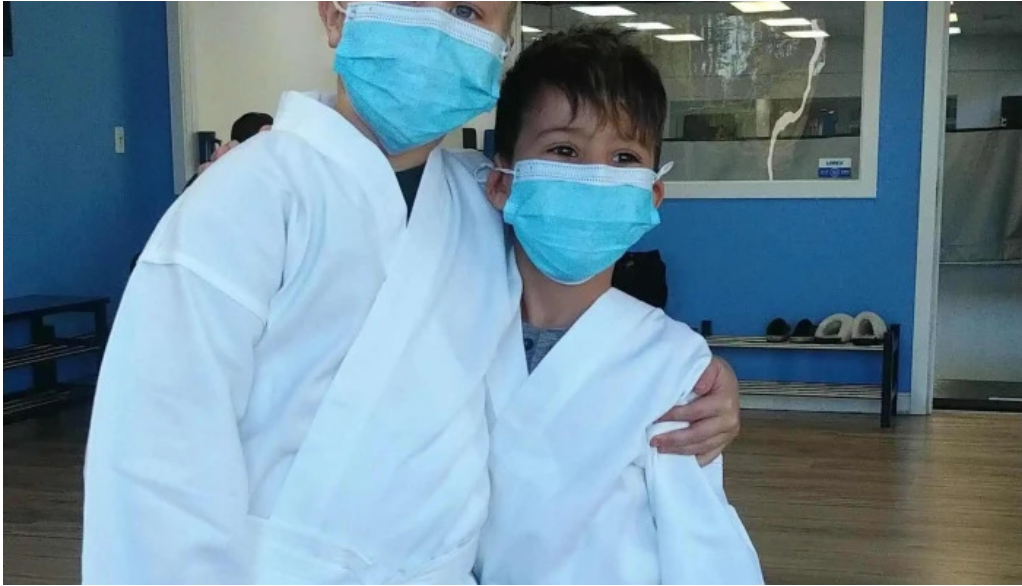
The pound martial arts center east wareham