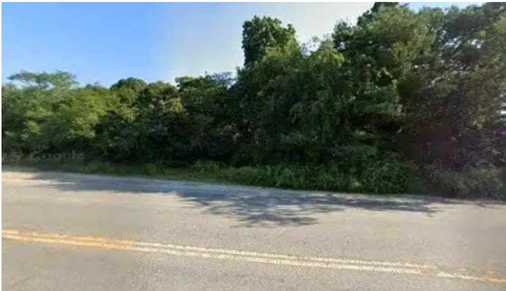
The pound martial arts center street view 360deg