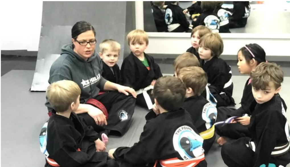
The pound martial arts center martial art