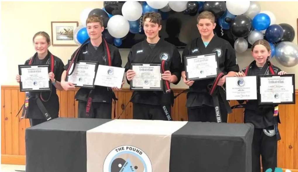
The pound martial arts center all