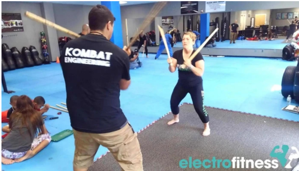
Bams martial arts fitness all