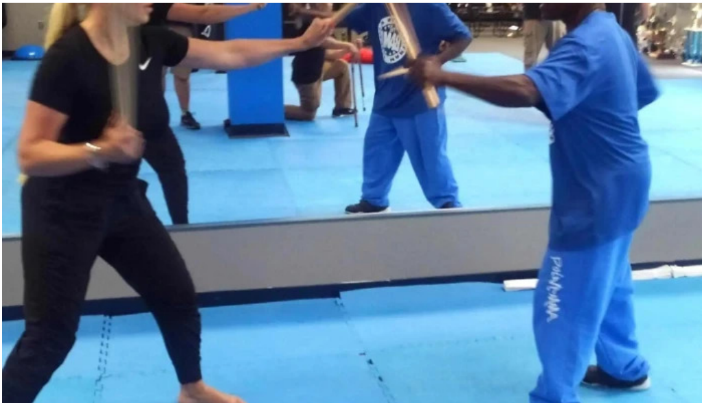
Bams martial arts fitness martial arts school