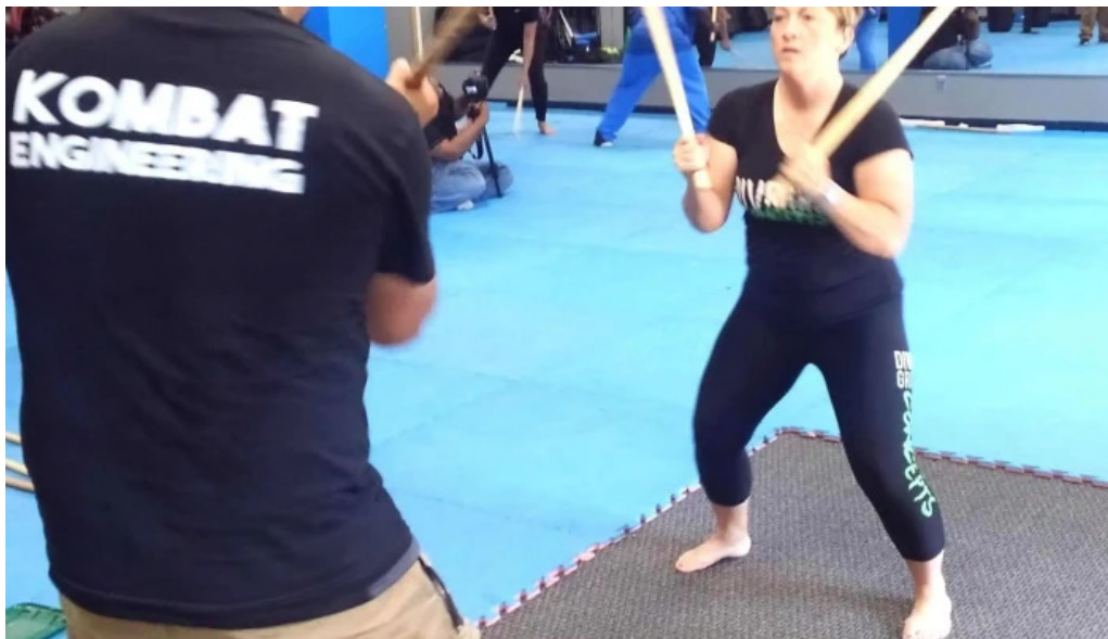
Bams martial arts fitness laurel