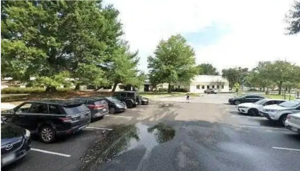
Bams martial arts fitness street view 360deg