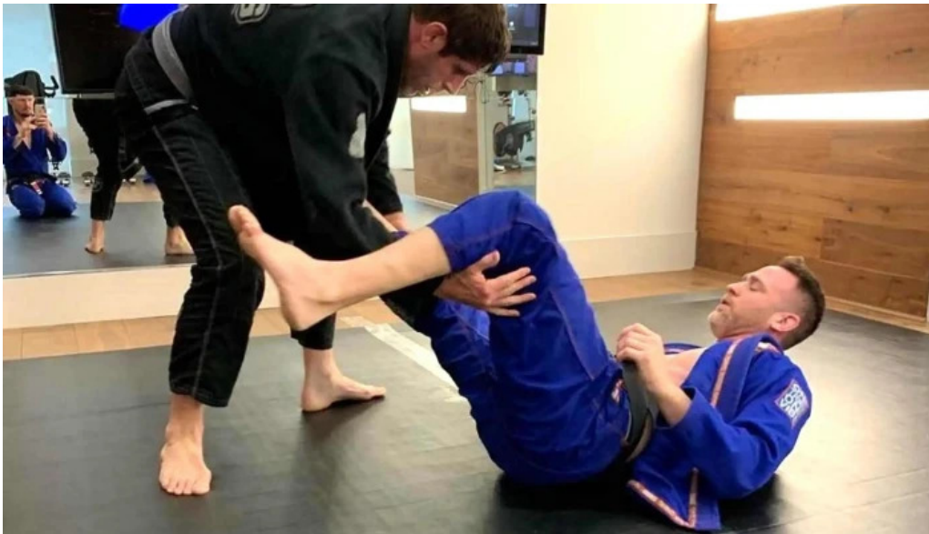
Sbg east coast martial arts school