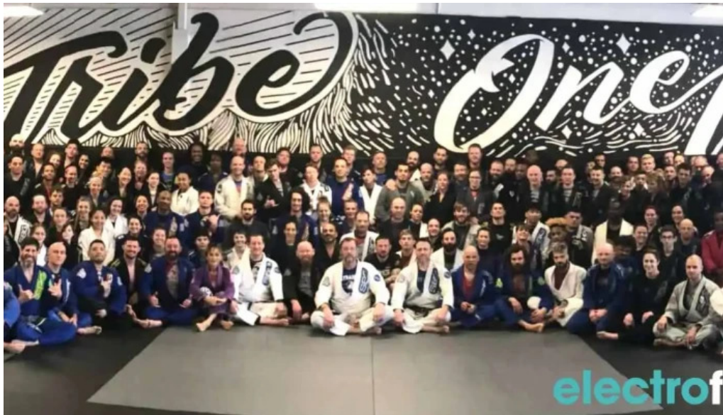
Sbg east coast all