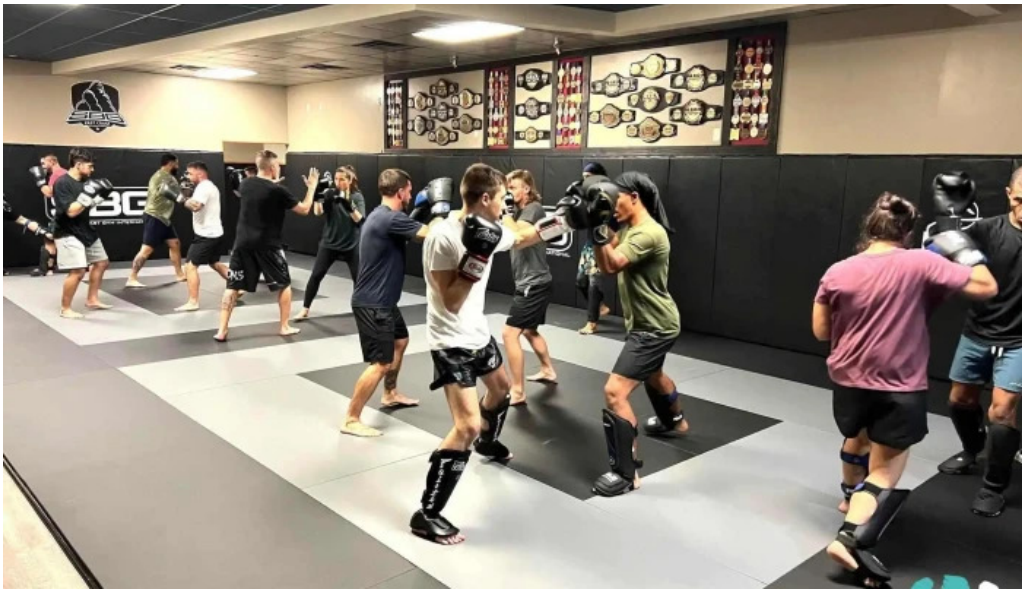
Sbg east coast by owner