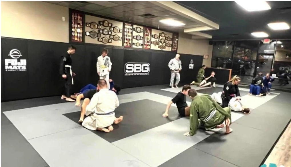
Sbg east coast martial art