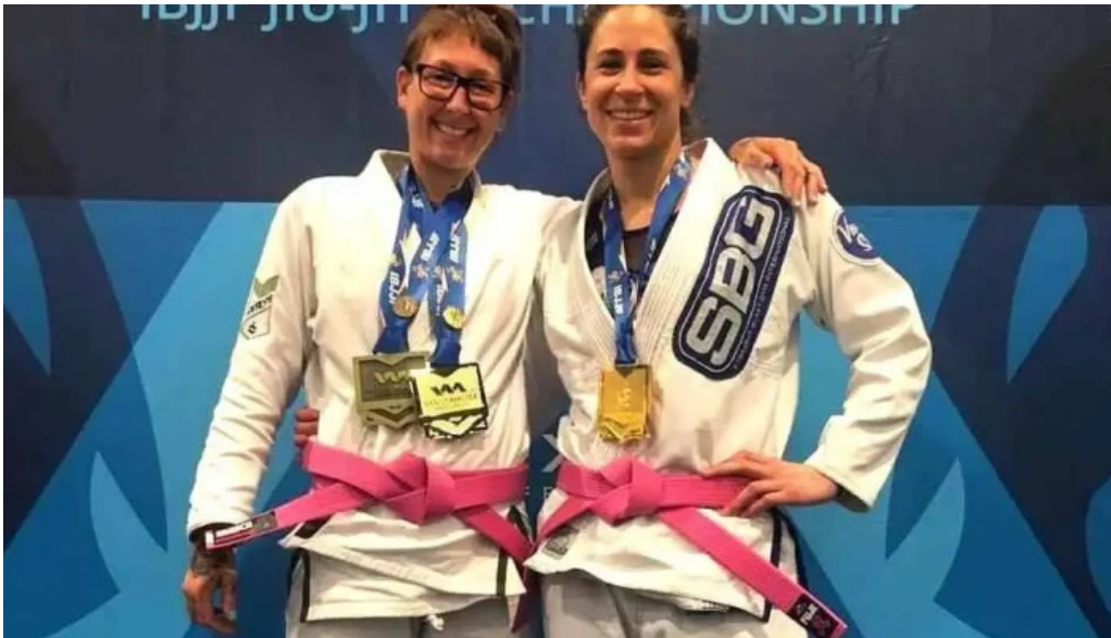
Sbg east coast uniform