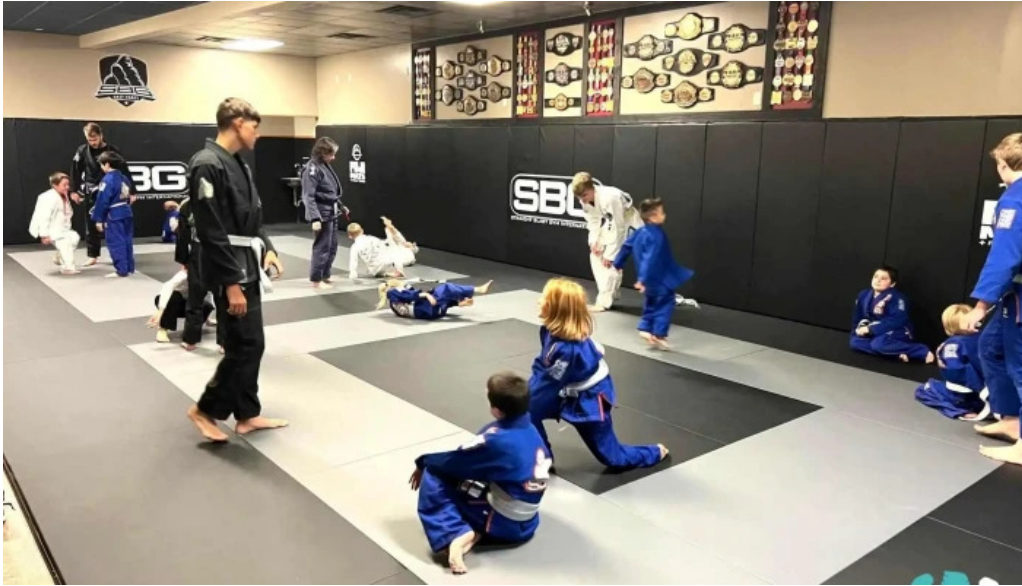
Sbg east coast community