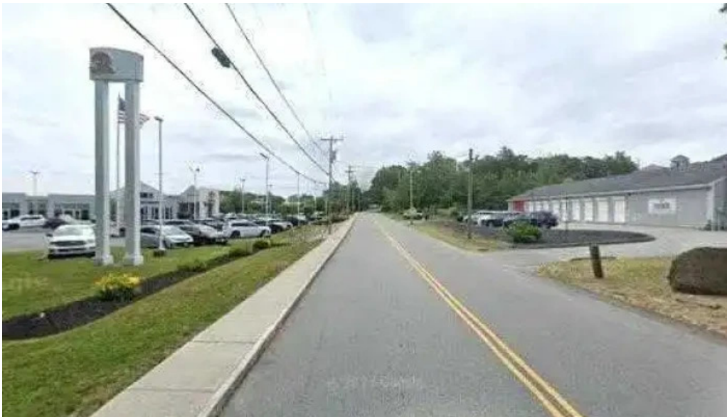
Sbg east coast street view 360deg