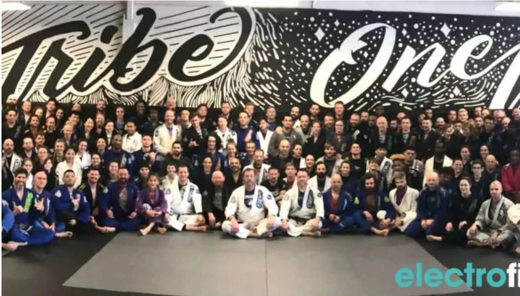
Sbg east coast north dartmouth