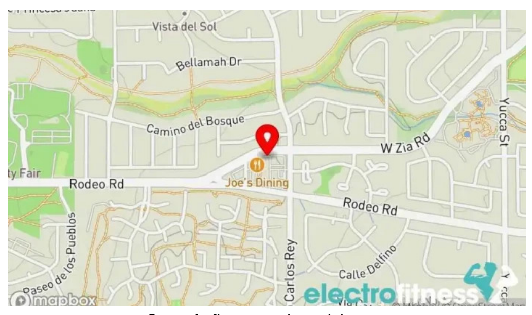
Santa fe fitness and martial arts map