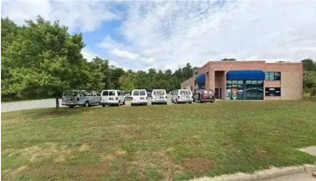
Tiger do jang karate fitness street view 360deg