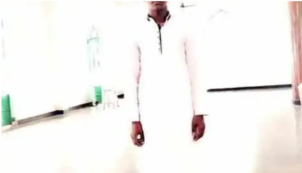
Tiger do jang karate fitness waldorf