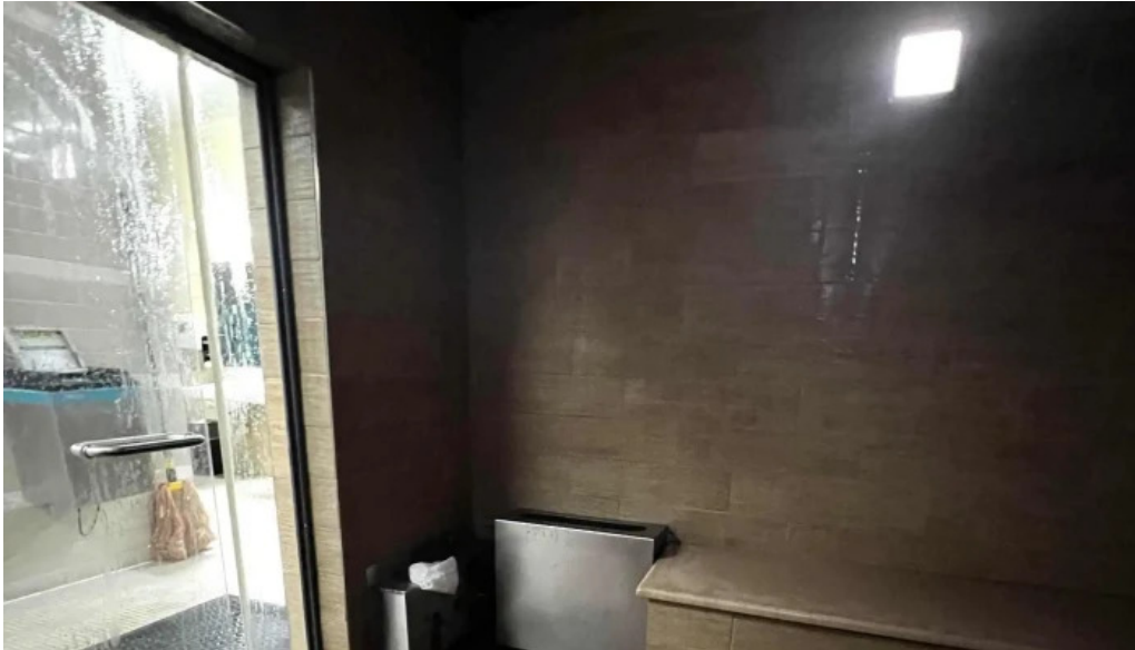
West boise ymca and boise city aquatic center non profit organization