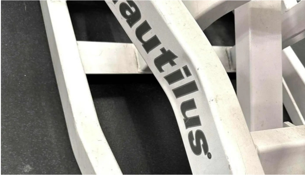
West boise ymca and boise city aquatic center reviews