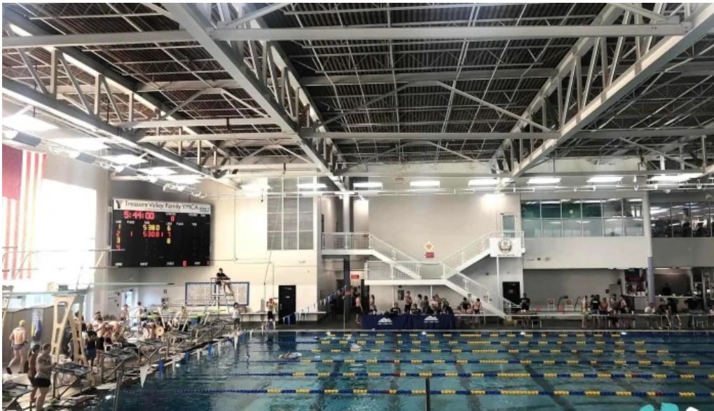
West boise ymca and boise city aquatic center all