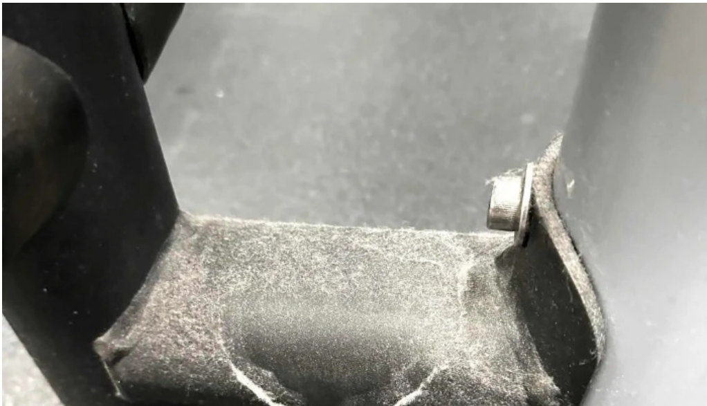
West boise ymca and boise city aquatic center promotion