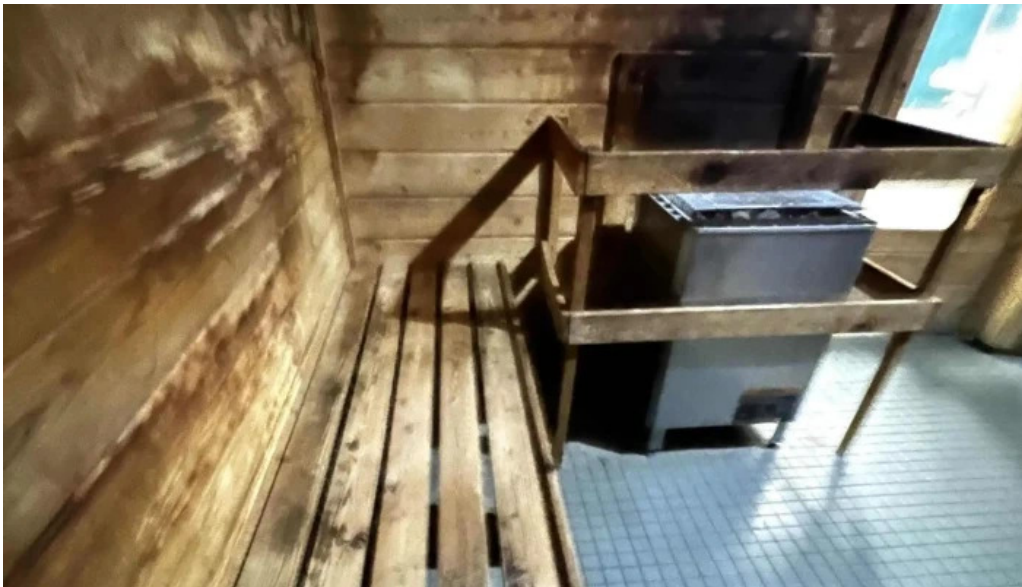
West boise ymca and boise city aquatic center boise