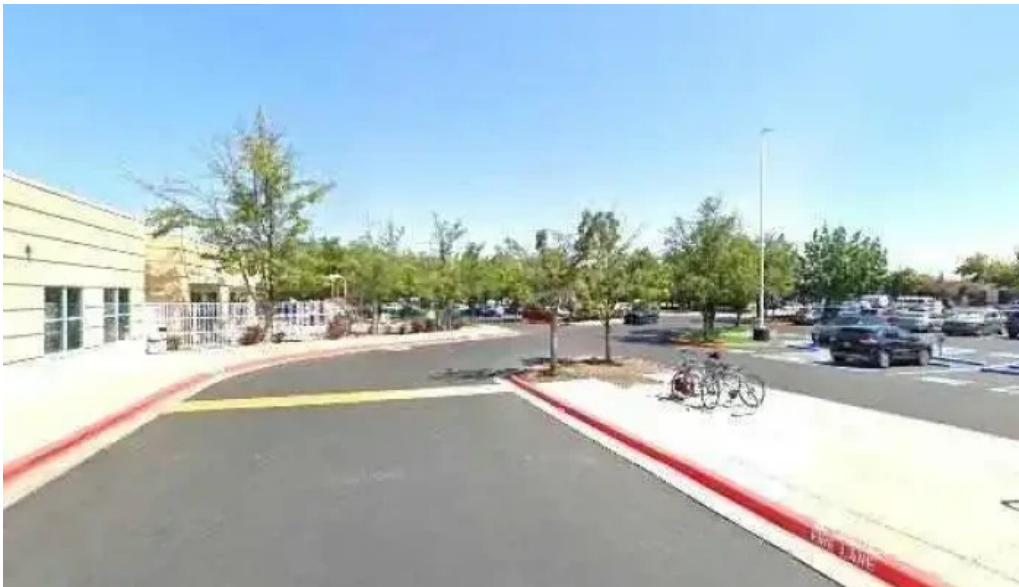
West boise ymca and boise city aquatic center street view 360deg