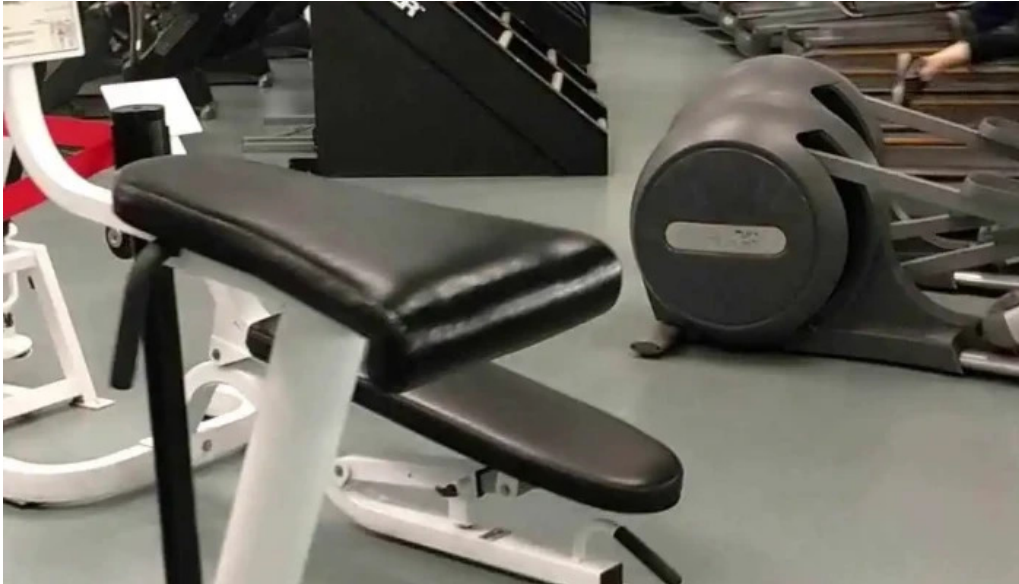
West boise ymca and boise city aquatic center videos