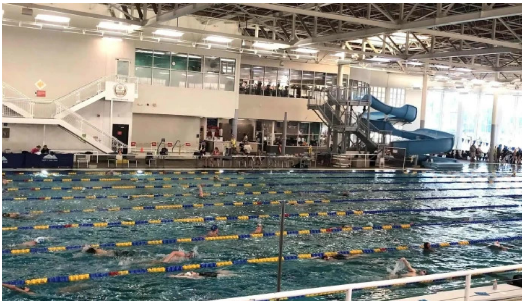
West boise ymca and boise city aquatic center instagram