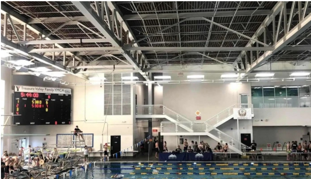
West boise ymca and boise city aquatic center location