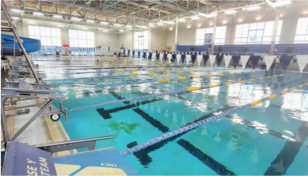
West boise ymca and boise city aquatic center catalog