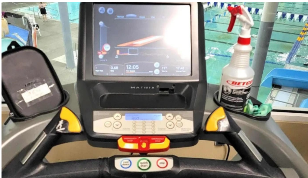
West boise ymca and boise city aquatic center number