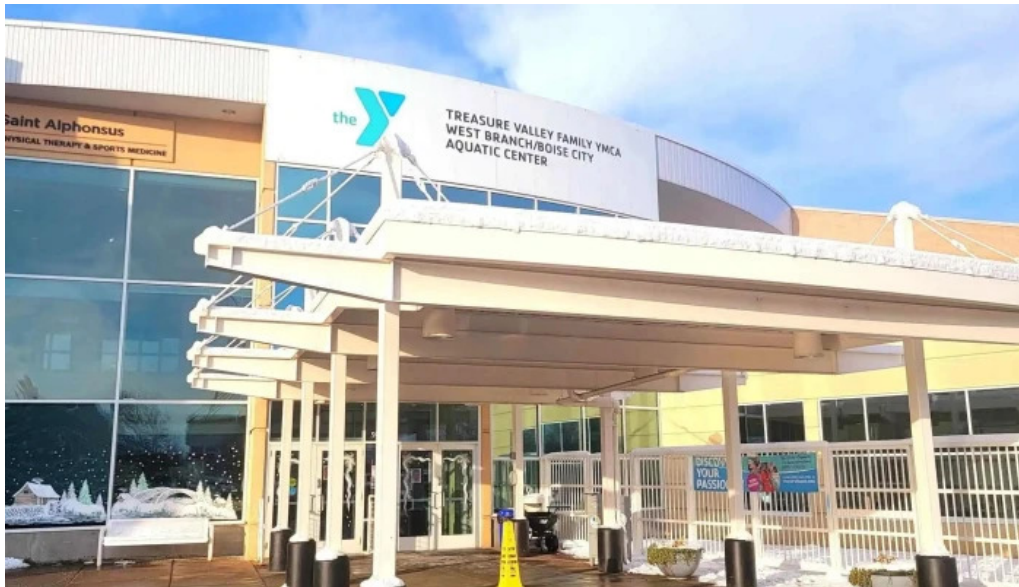
West boise ymca and boise city aquatic center photos