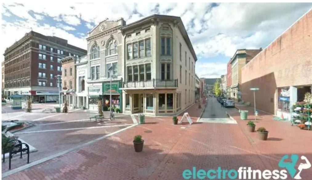
Recovery in fitness cumberland