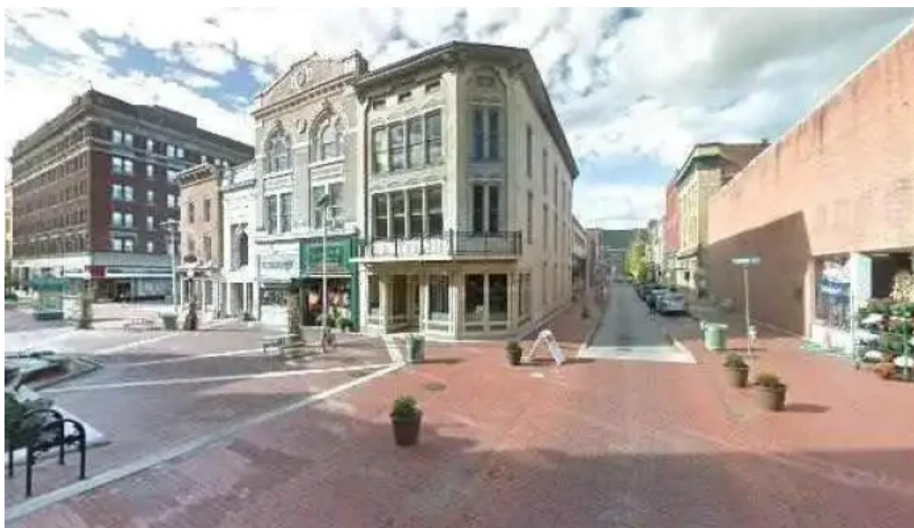
Recovery in fitness all