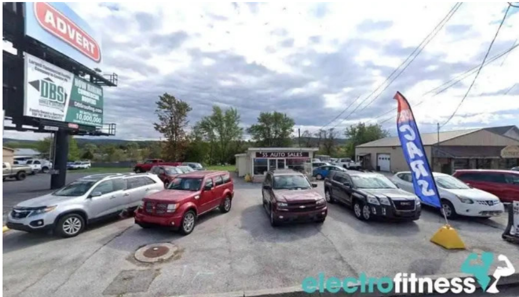
Your personal trainer fitness studio abbotstown