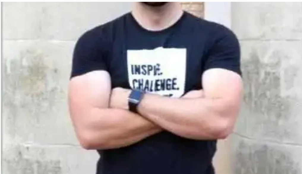
I am fitness all