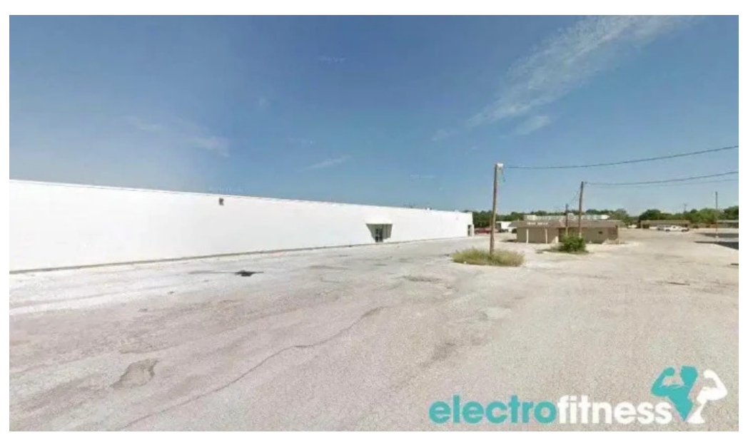
Perfected bodies fitness abilene abilene