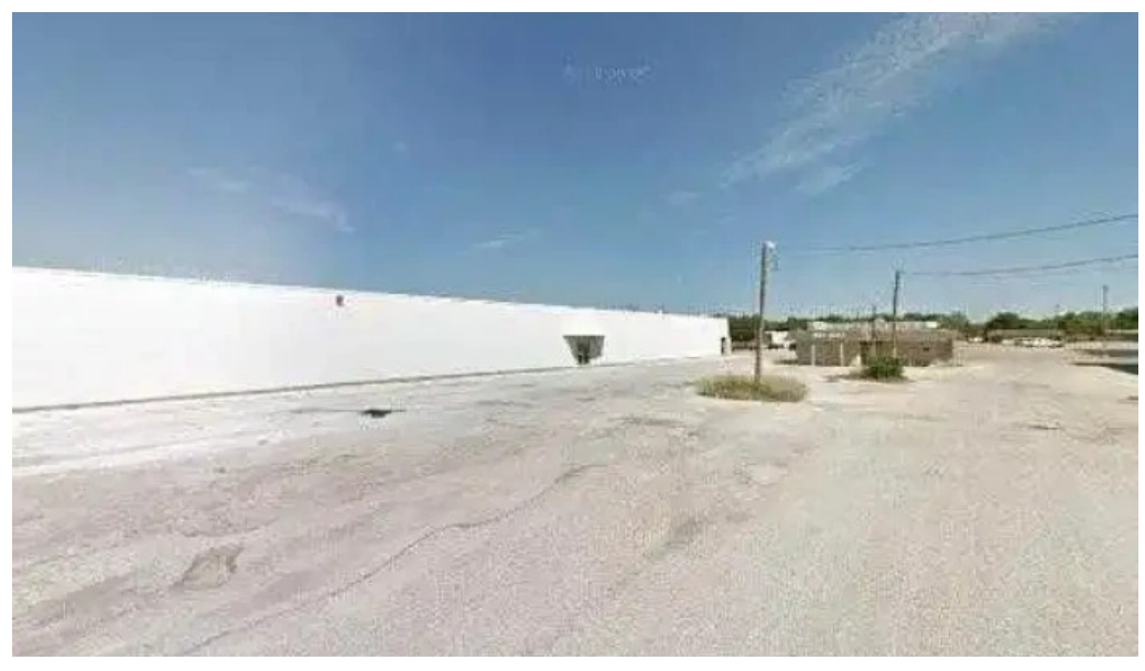
Perfected bodies fitness abilene all