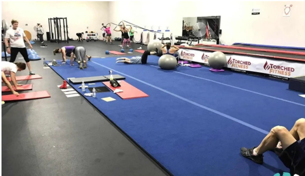
Torched fitness gym