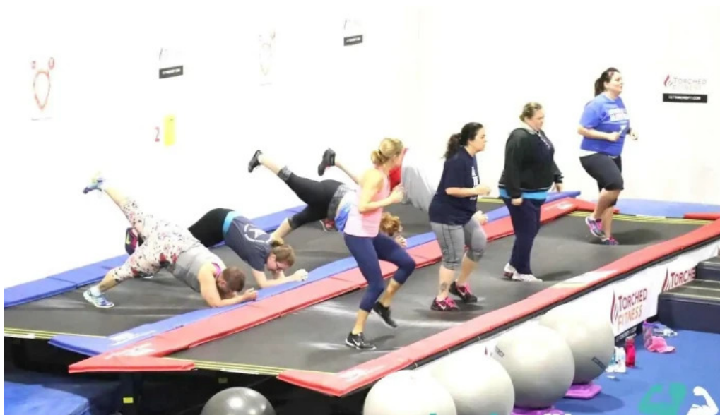
Torched fitness affton