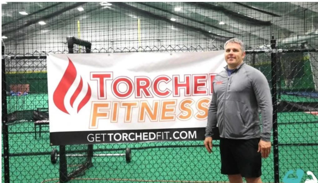
Torched fitness by owner