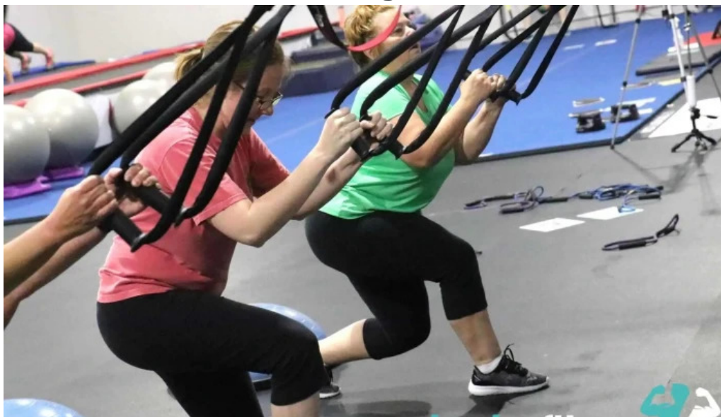
Torched fitness training