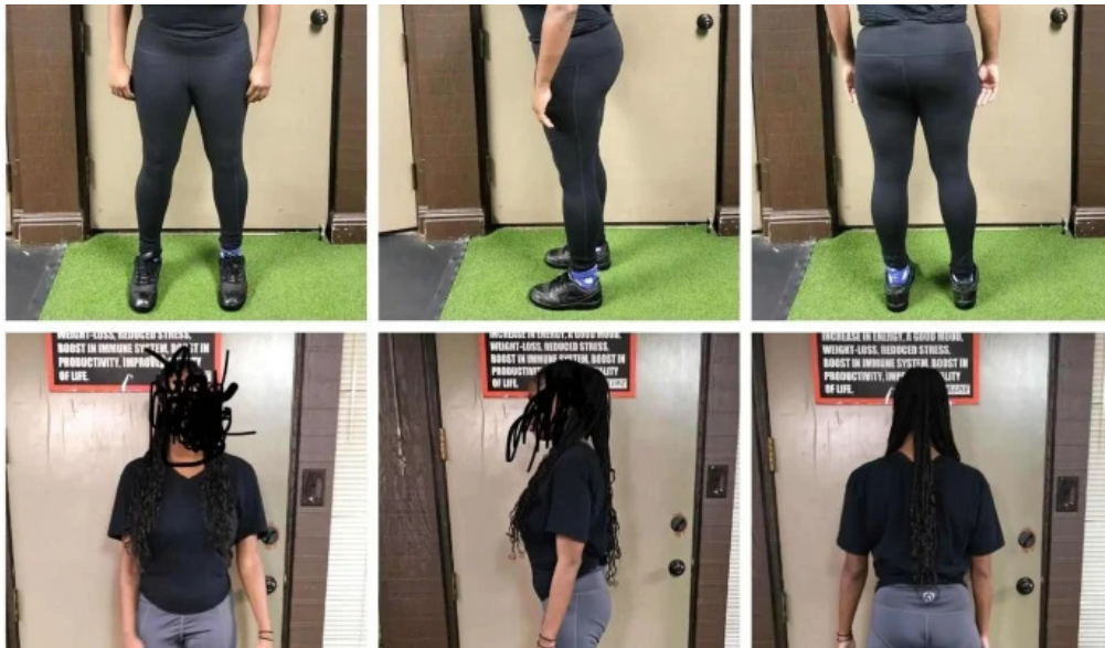
Rise n grind fitness personal trainer