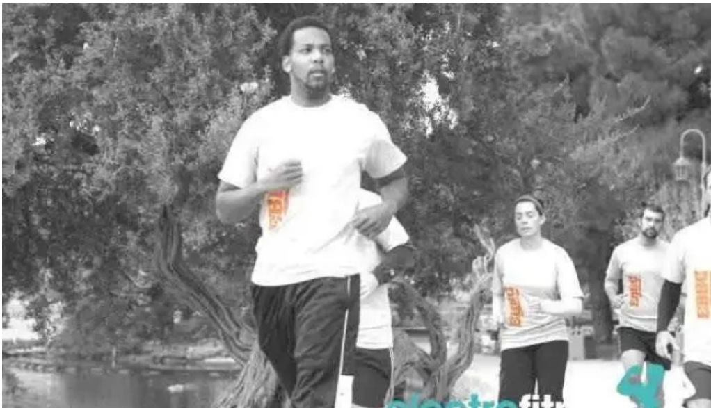
Rise n grind fitness physical fitness