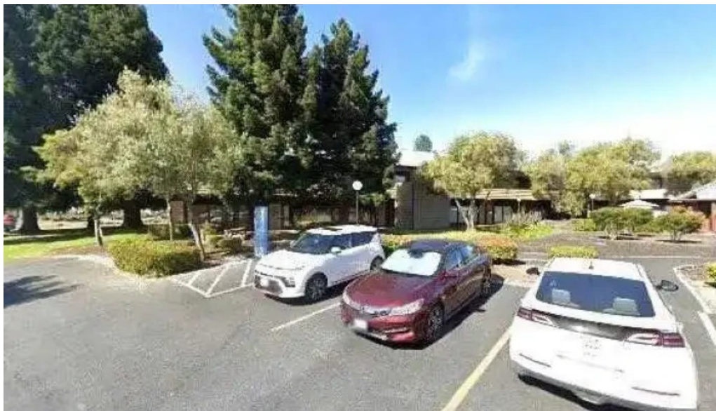
Rise n grind fitness street view 360deg