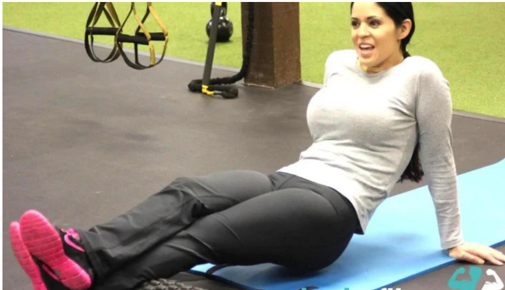
Rise n grind fitness training