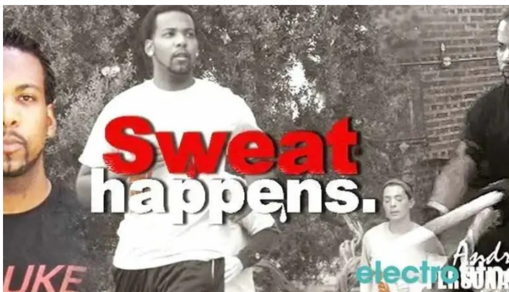
Rise n grind fitness all