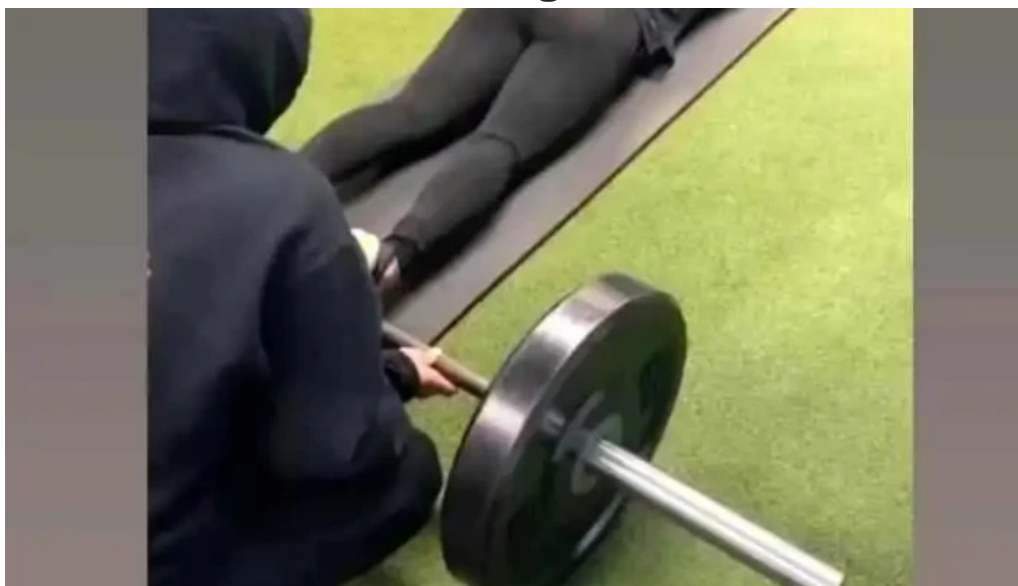
Rise n grind fitness videos