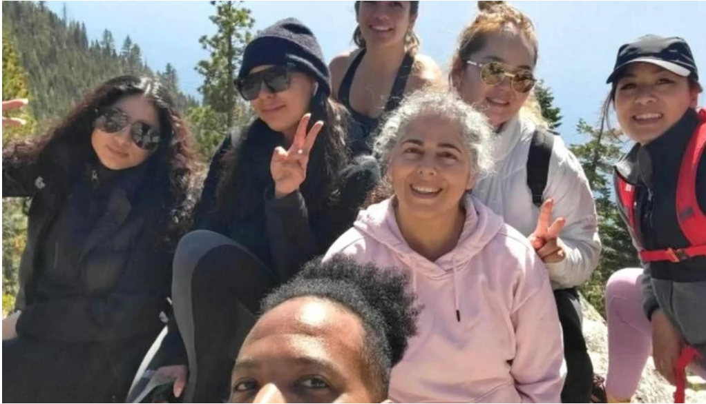
Rise n grind fitness score