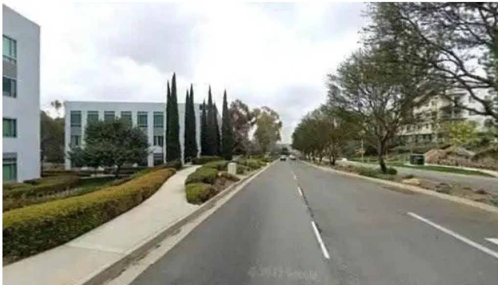
Coaching by jake barrena street view 360deg