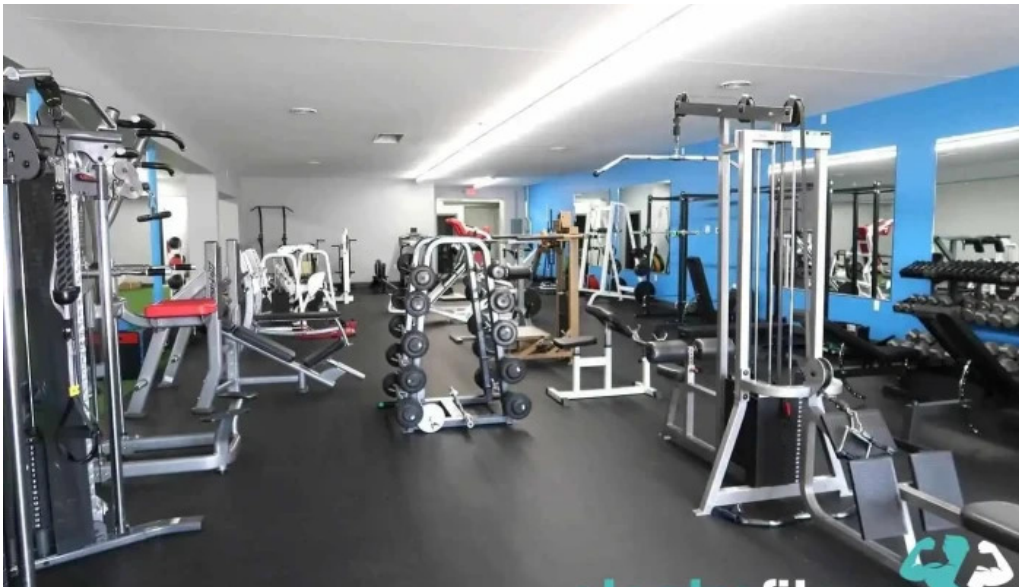
Lets get fit personal training llc physical fitness