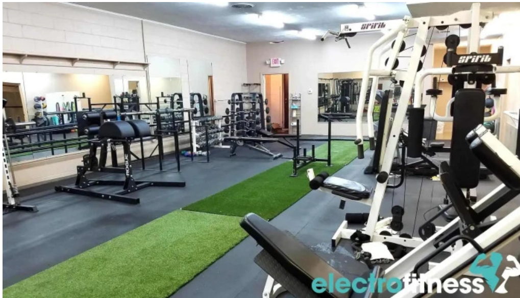
Lets get fit personal training llc gym