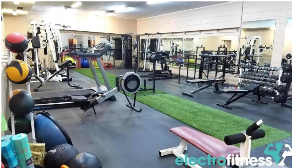
Lets get fit personal training llc training