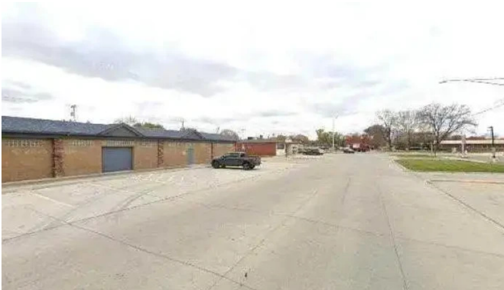
Lets get fit personal training llc street view 360deg