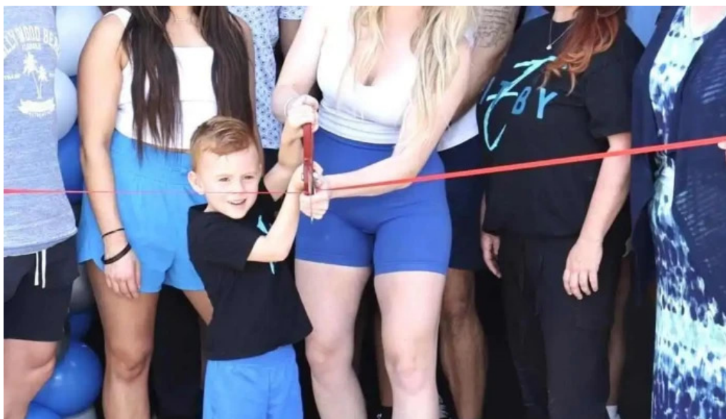
Lets get fit personal training llc all