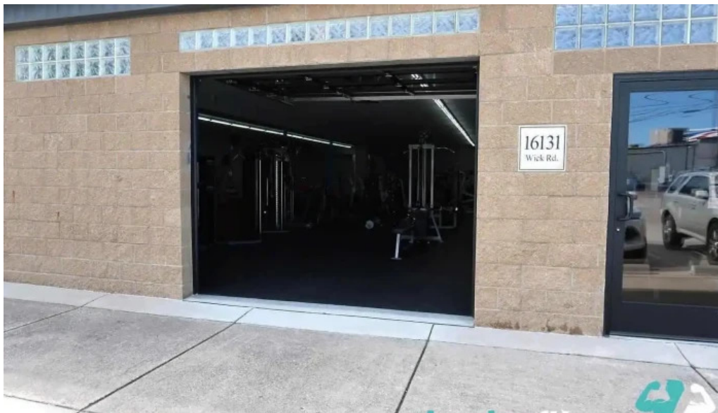
Lets get fit personal training llc by owner