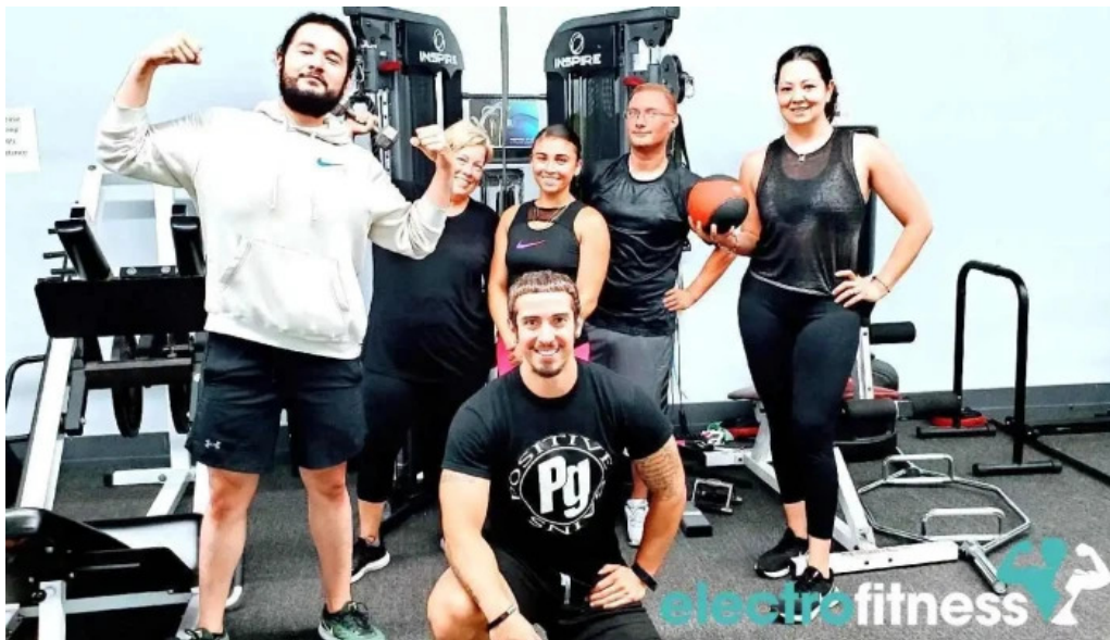
Positive gains training allen park