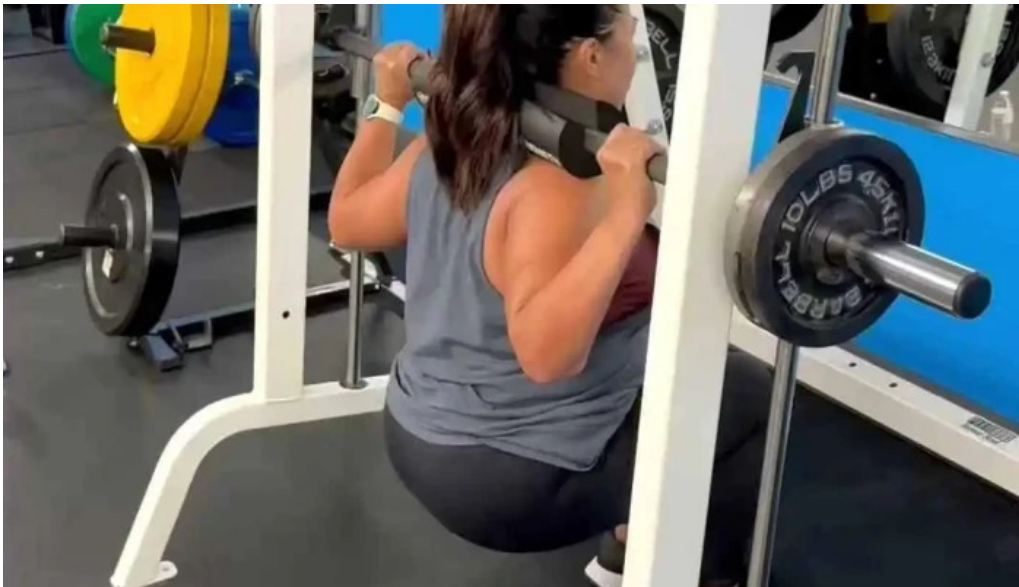
Positive gains training physical fitness