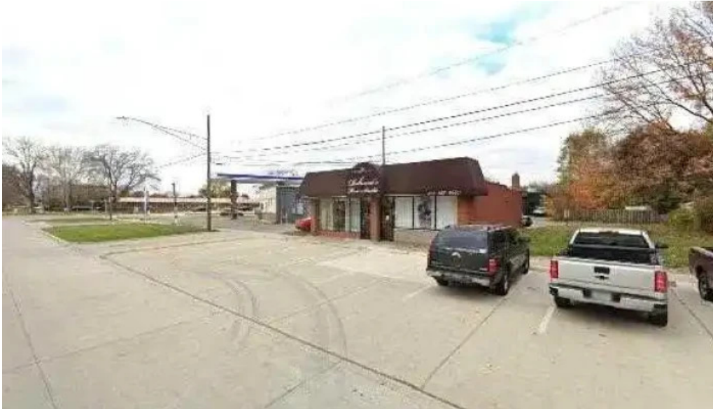
Positive gains training street view 360deg