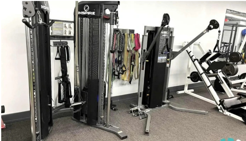
Positive gains training by owner