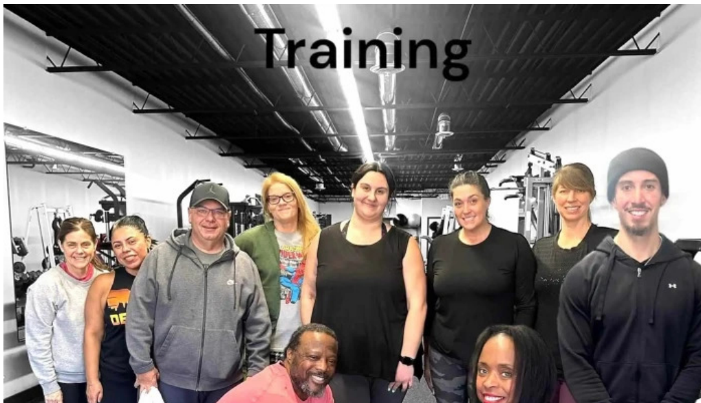
Positive gains training personal trainer