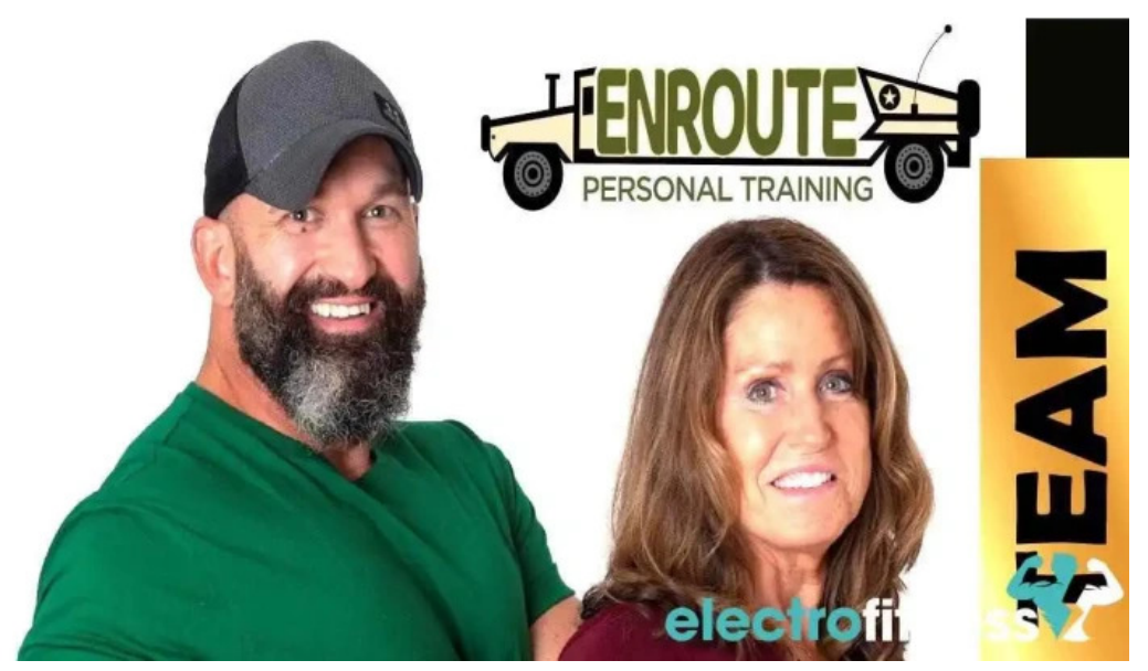
Enroute personal training llc all