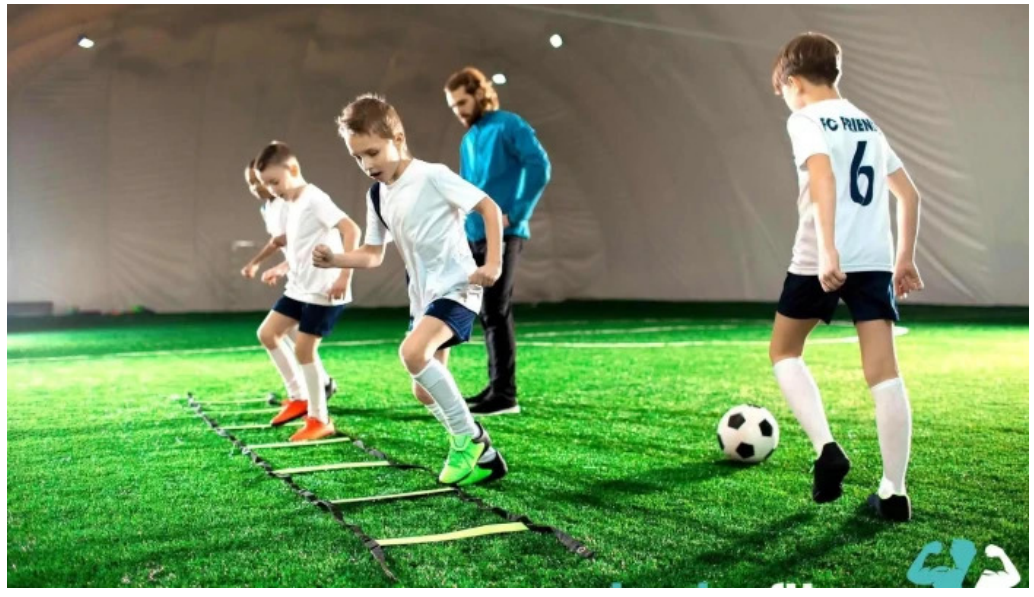
Enroute personal training llc training