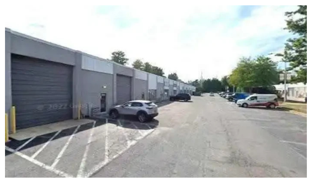
Enroute personal training IIc street view 360deg