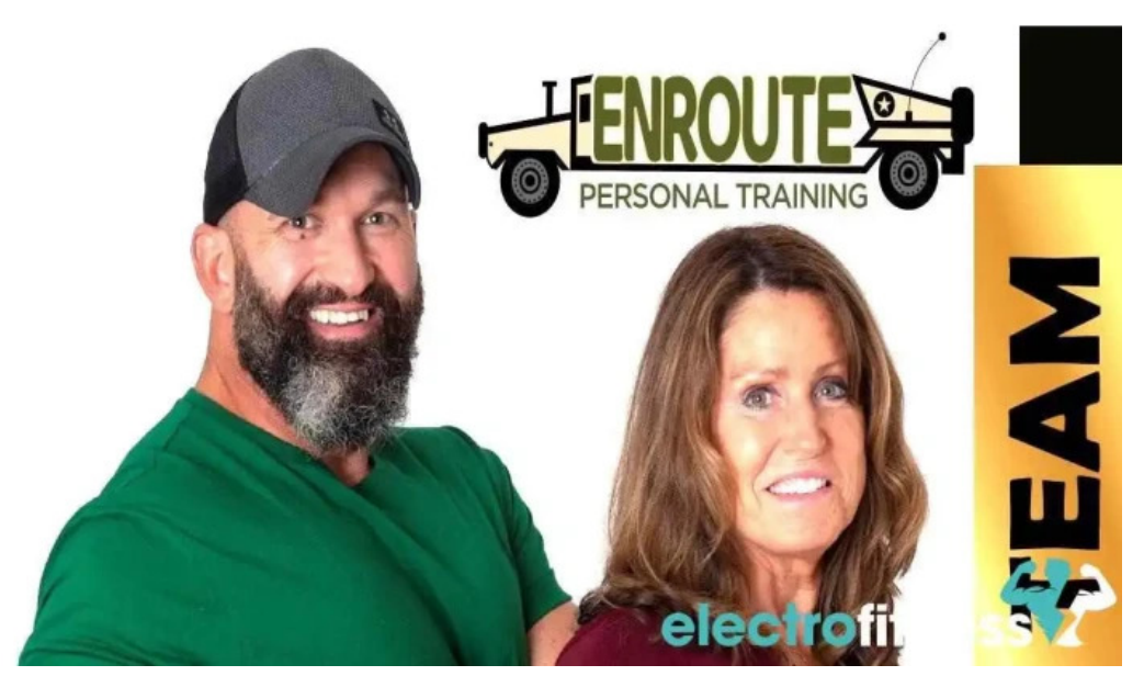
Enroute personal training llc annapolis