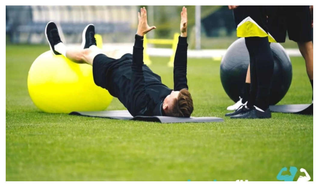
Enroute personal training llc by owner