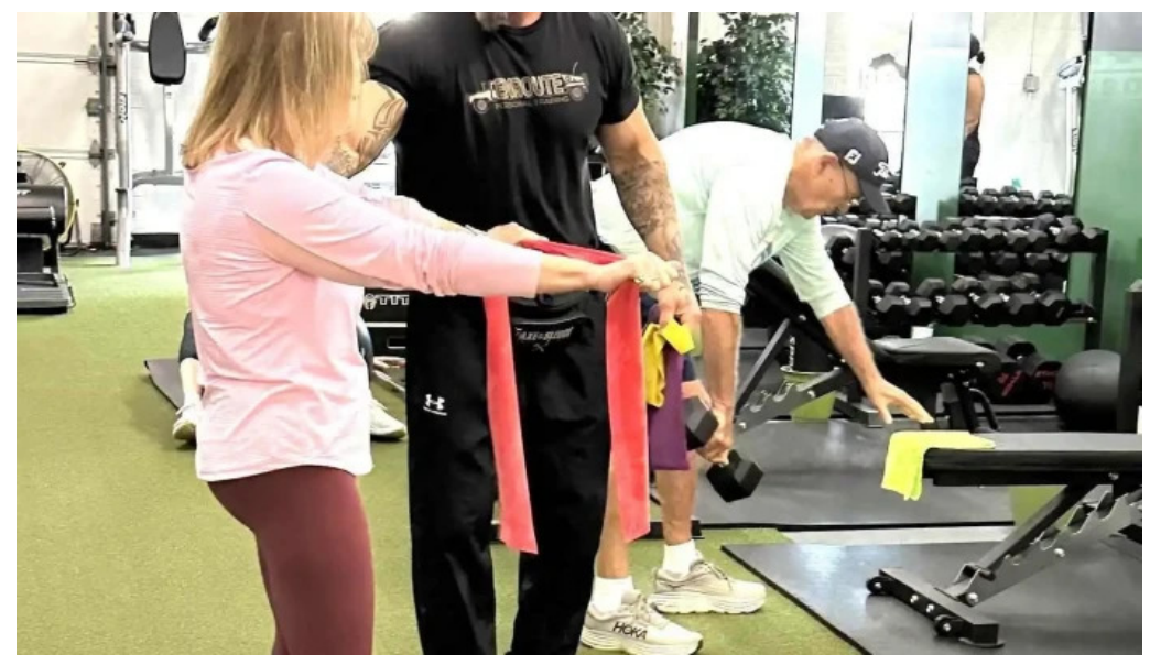
Enroute personal training IIc physical fitness