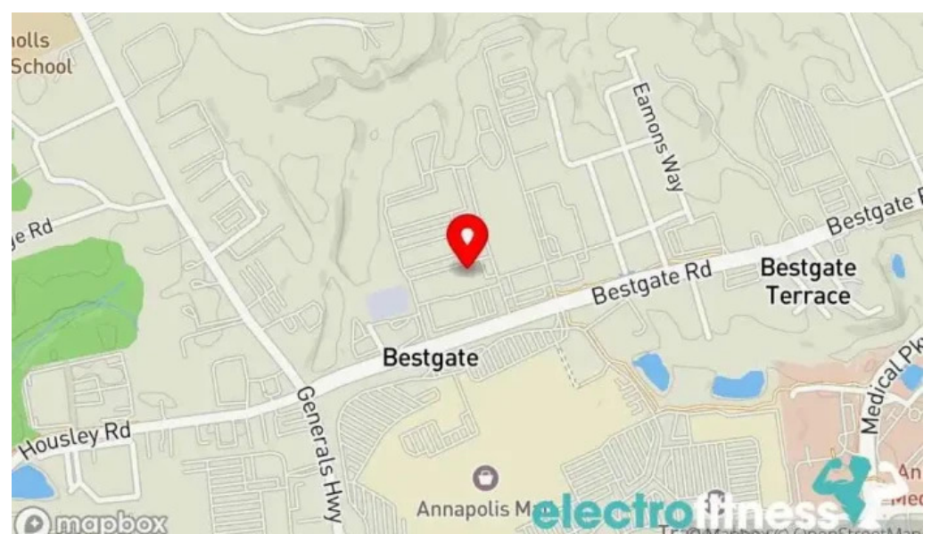
Enroute personal training llc map