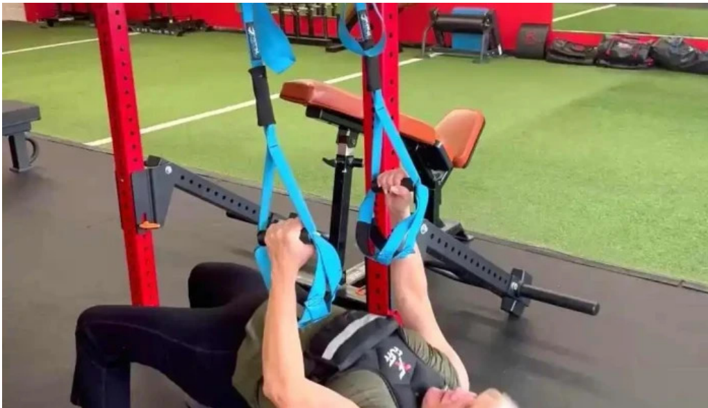
Ross fitness out of the box training gym