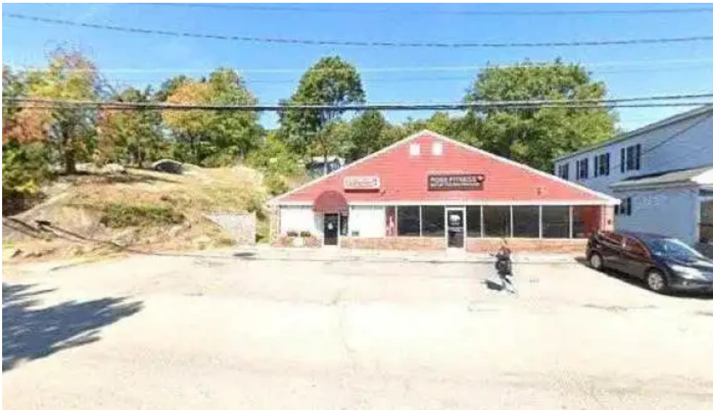
Ross fitness out of the box training street view 360deg