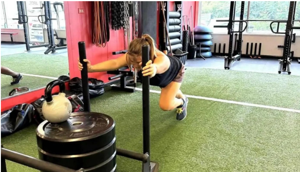
Ross fitness out of the box training all