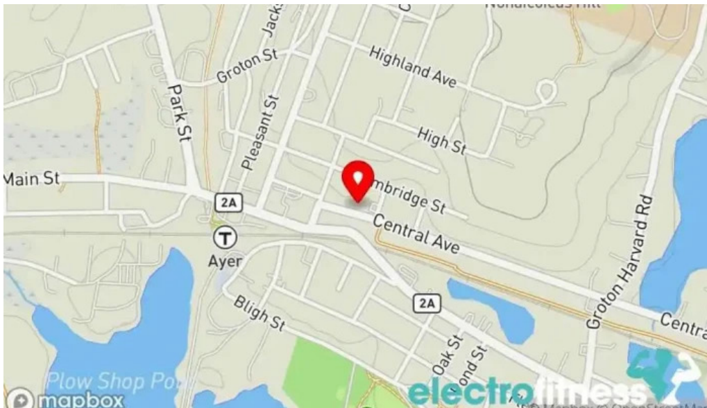
Ross fitness out of the box training map