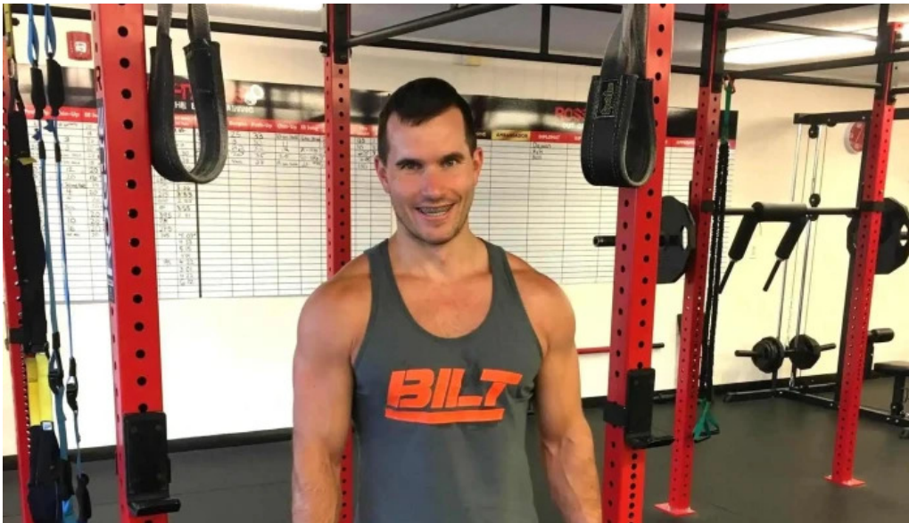
Ross fitness out of the box training personal trainer