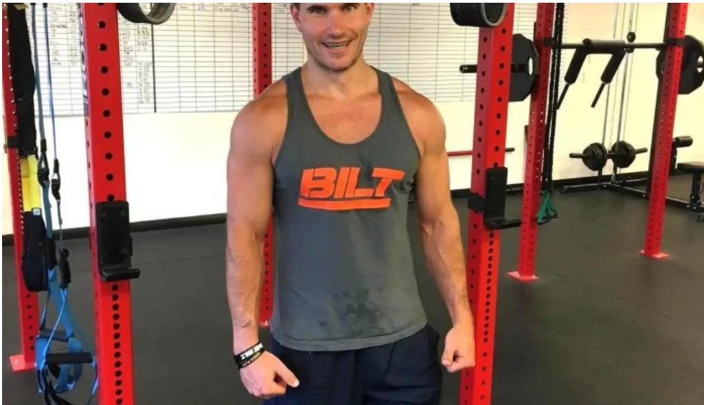
Ross fitness out of the box training training