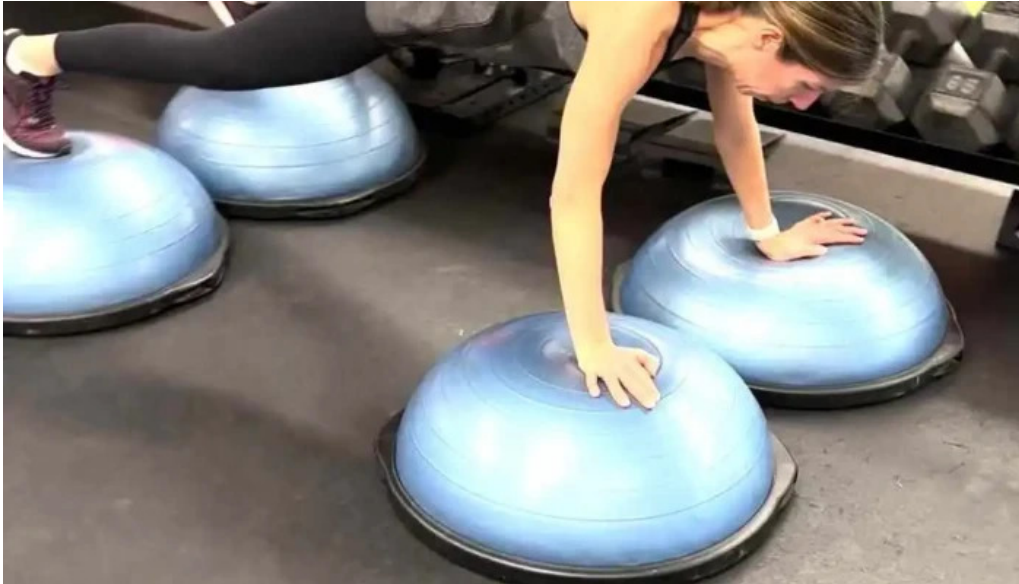
Ross fitness out of the box training physical fitness