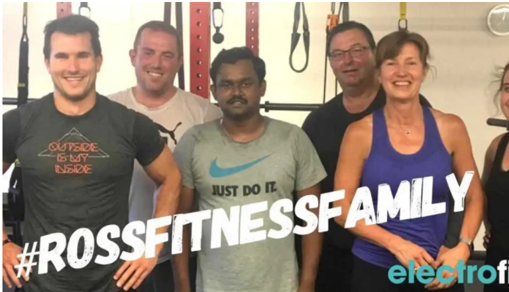
Ross fitness out of the box training by owner