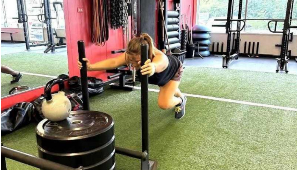
Ross fitness out of the box training ayer