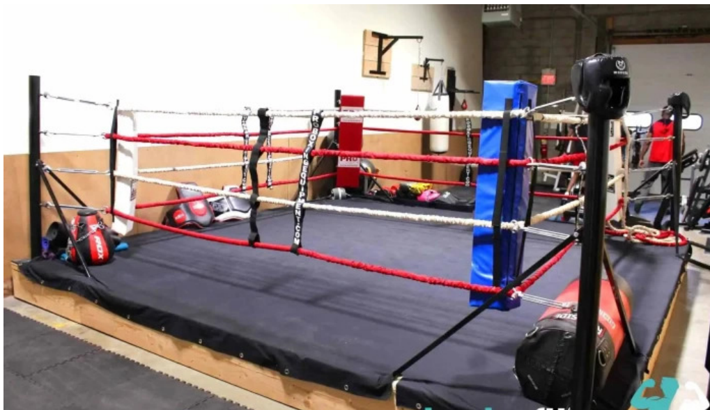
Firmfit training and boxing by owner