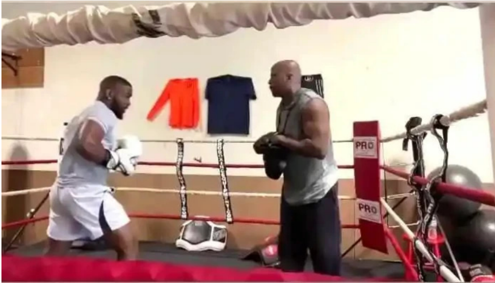
Firmfit training and boxing physical fitness