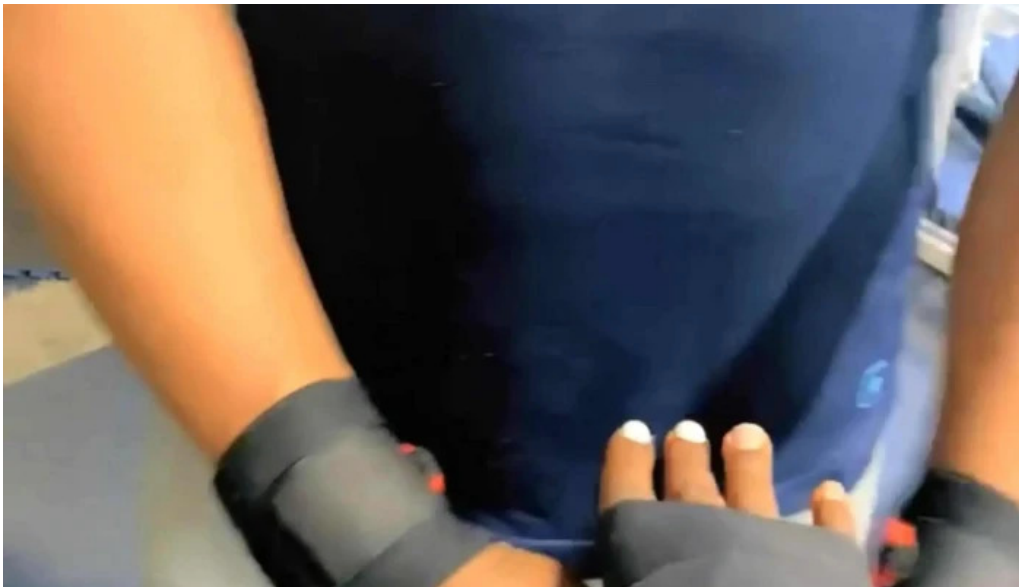
Firmfit training and boxing personal trainer