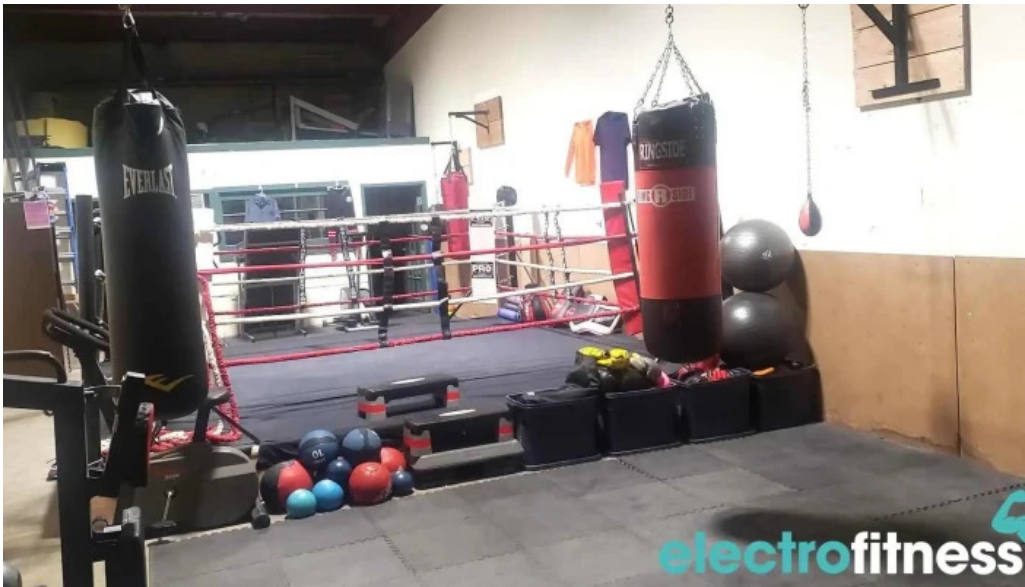
Firmfit training and boxing training