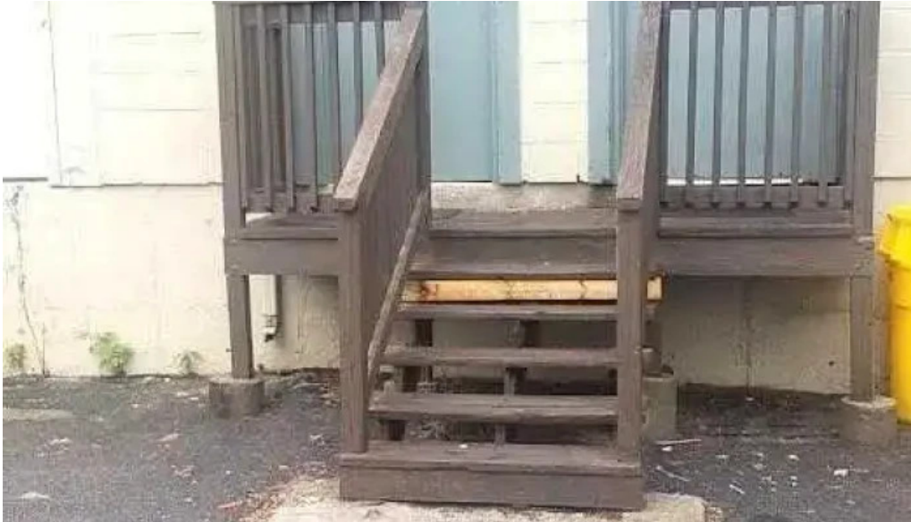
Firmfit training and boxing brockton