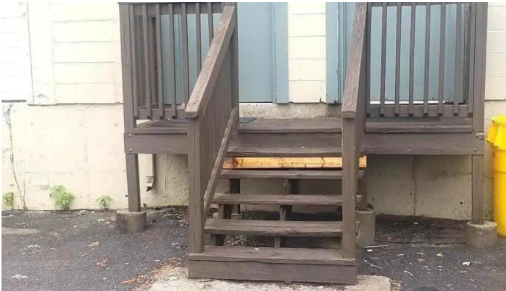
Firmfit training and boxing all