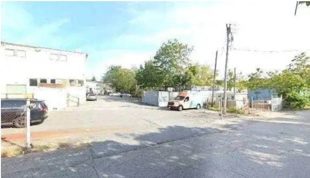
Firmfit training and boxing street view 360deg