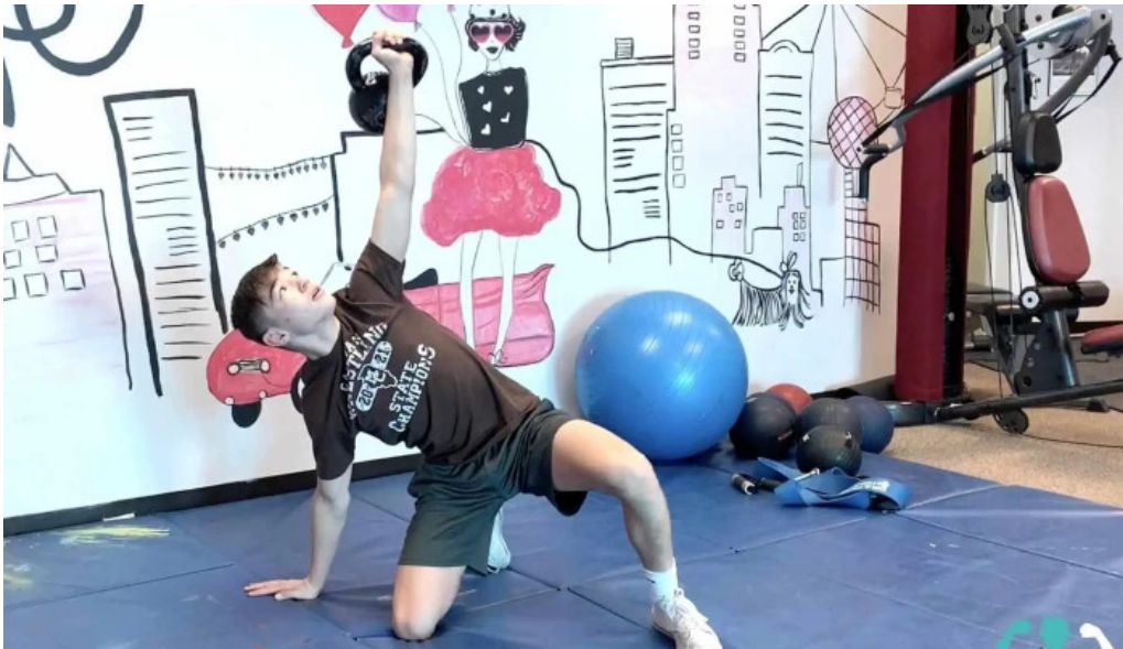
Trainer troy fitness and training by owner