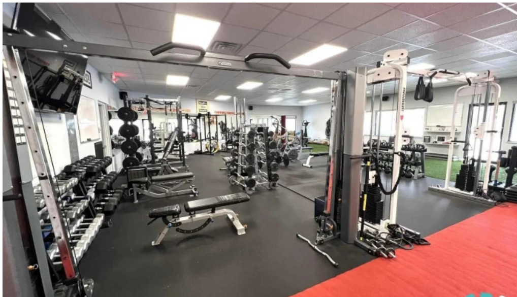
Trainer troy fitness and training training