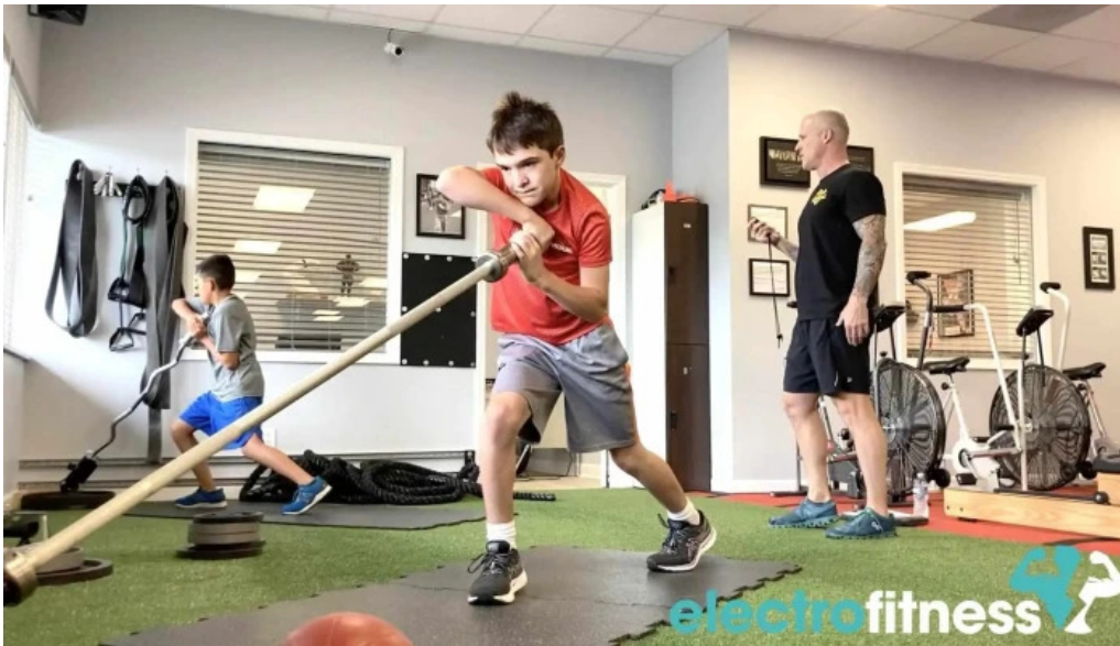
Trainer troy fitness and training physical fitness