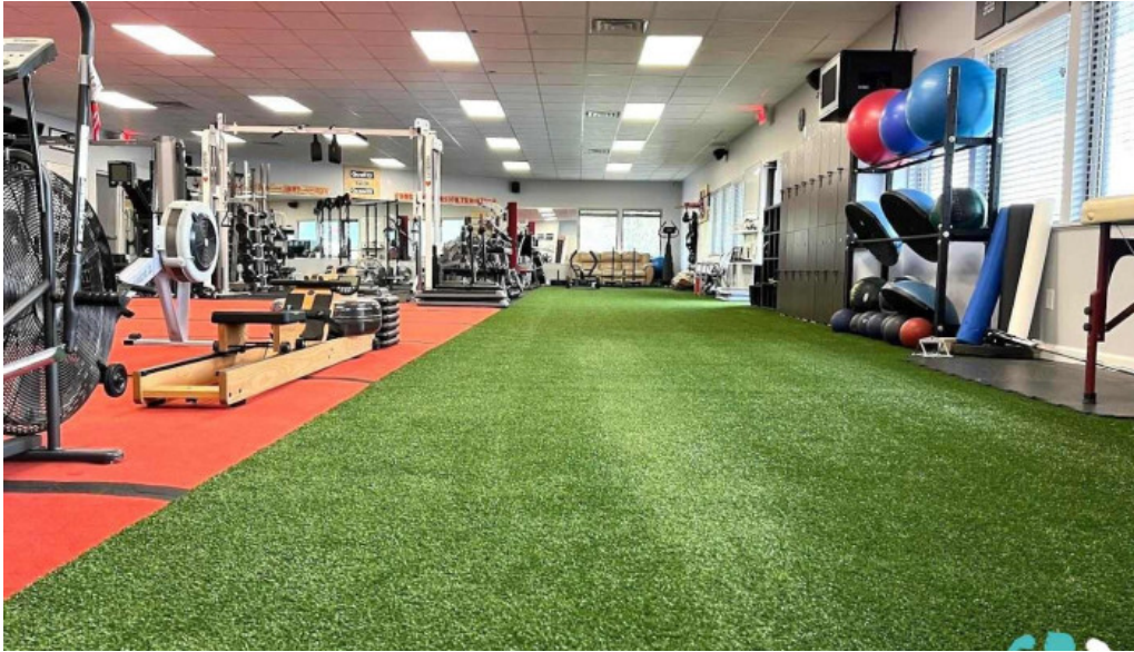
Trainer troy fitness and training crown point