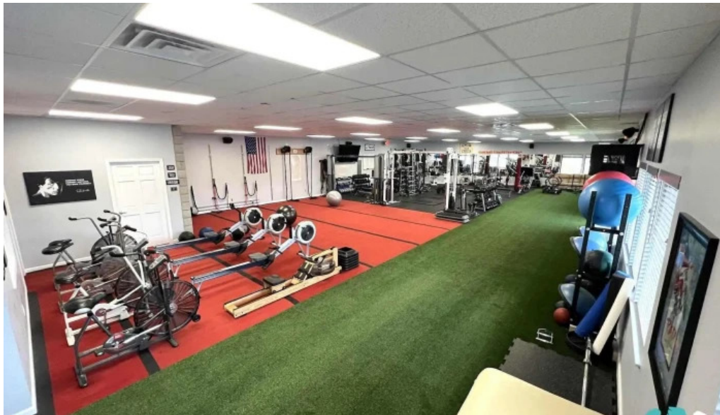
Trainer troy fitness and training gym