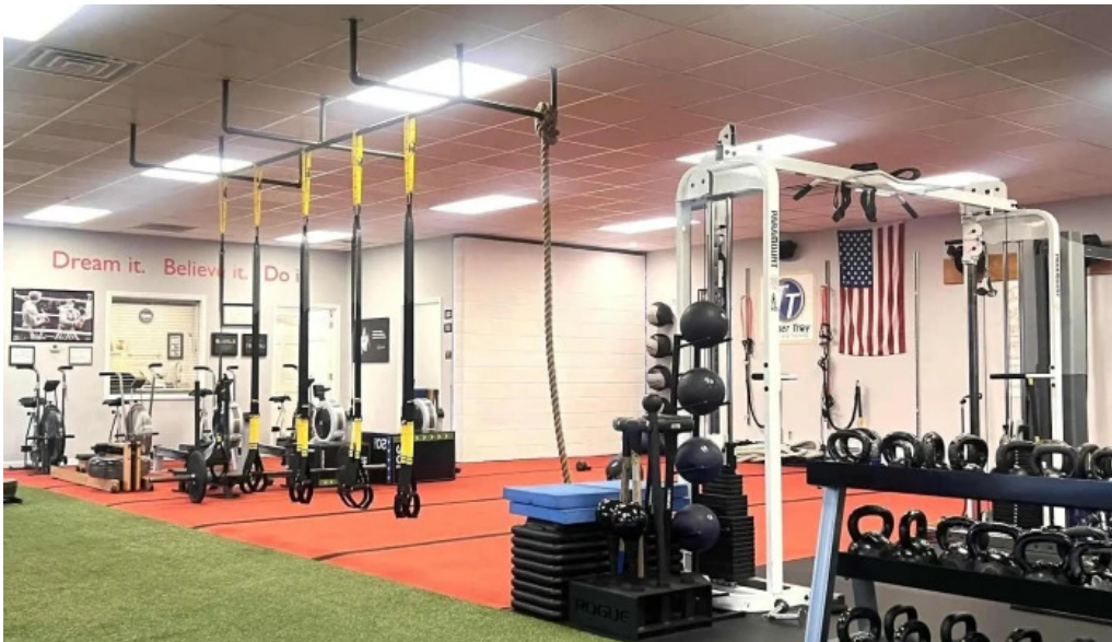
Trainer troy fitness and training personal trainer