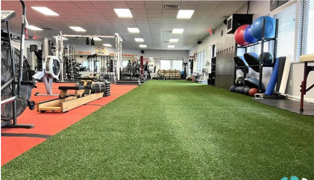
Trainer troy fitness and training all