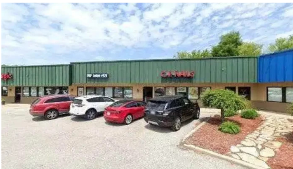
Trainer troy fitness and training street view 360