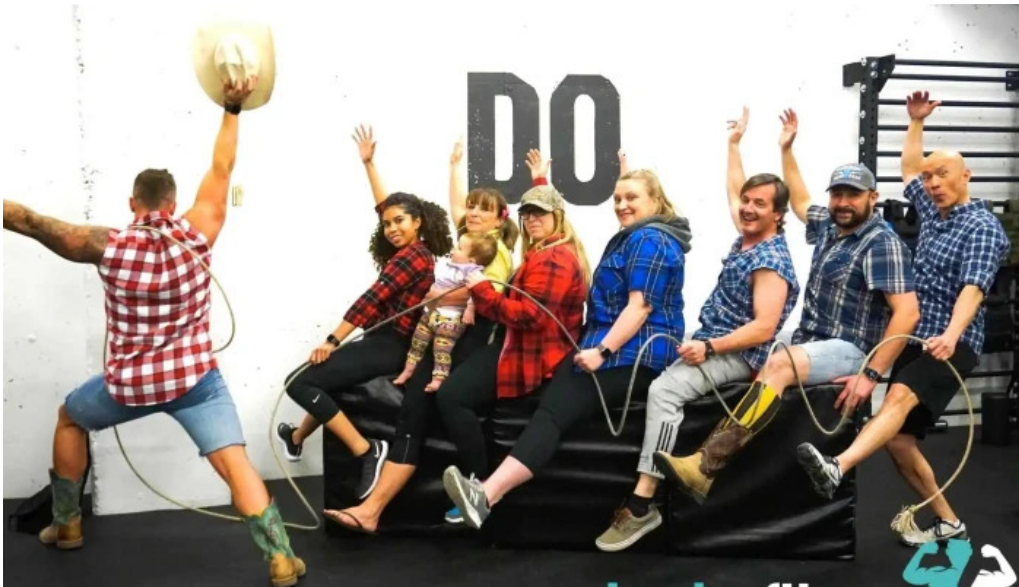
Sixth union fitness physical fitness