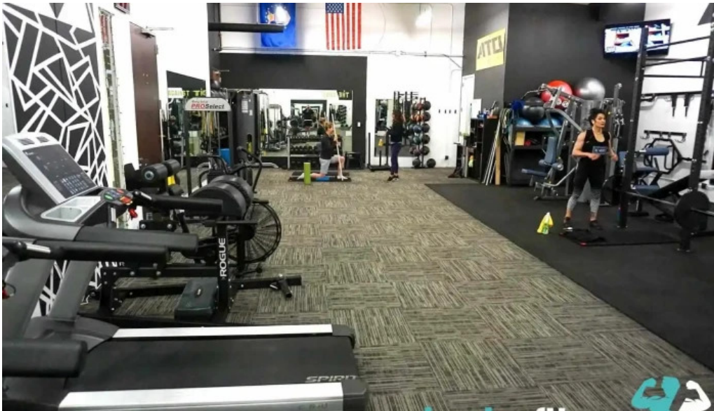
Sixth union fitness englewood