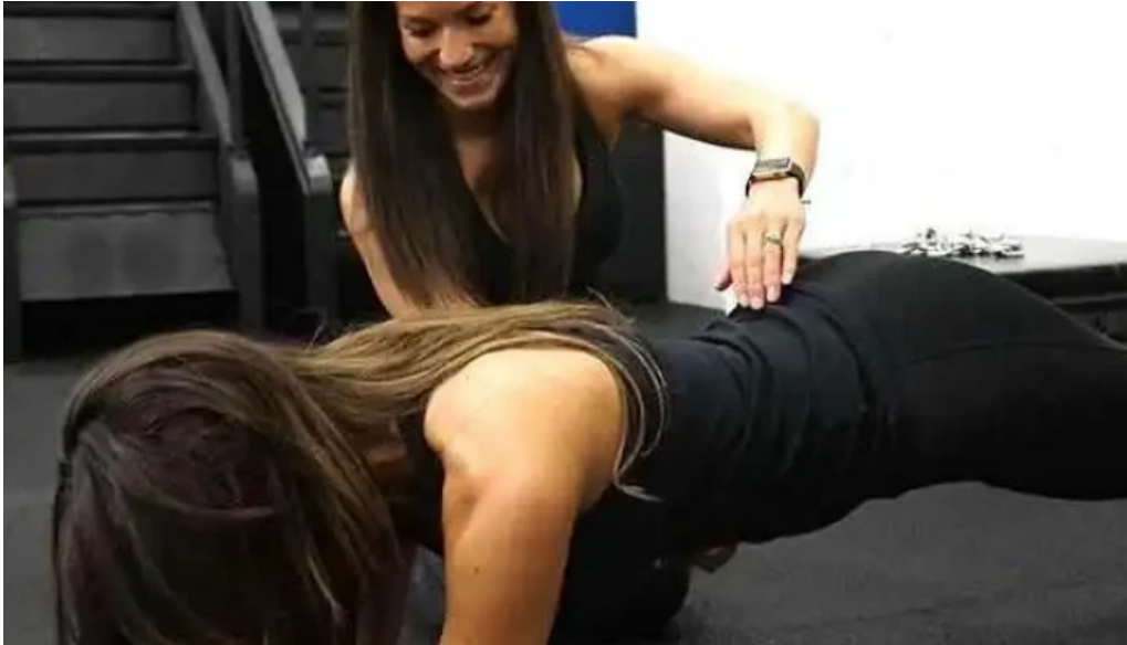
Sixth union fitness by owner