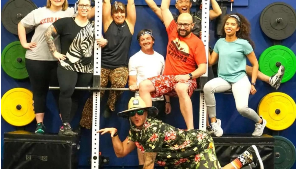
Sixth union fitness training