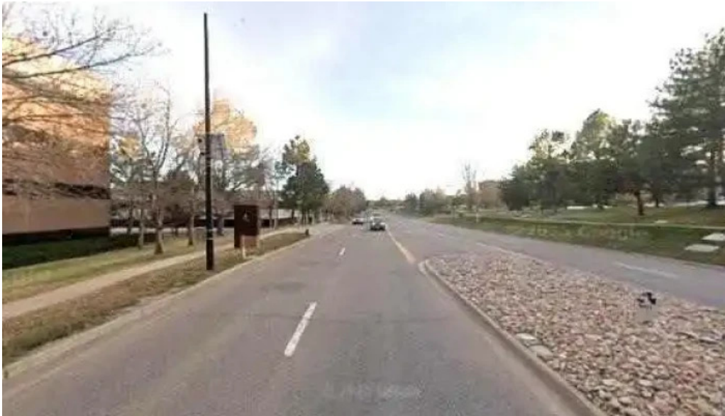
Sixth union fitness street view 360deg