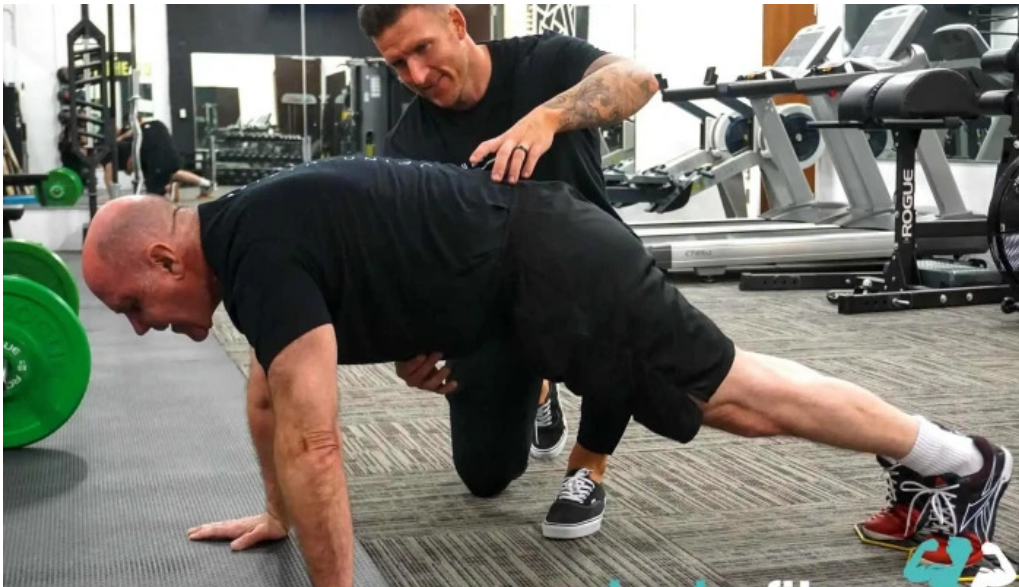
Sixth union fitness gym