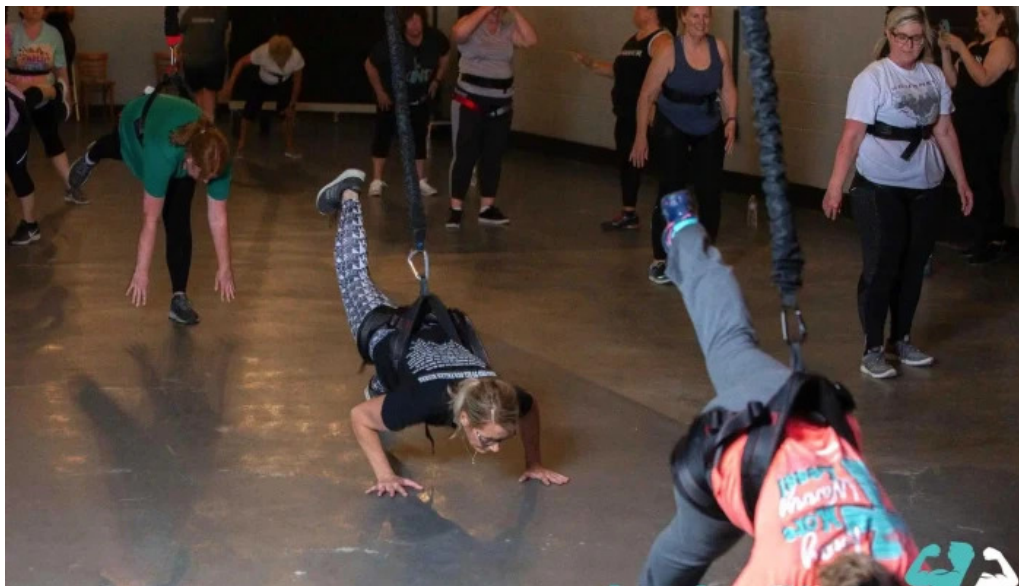
Bodybychantal physical fitness