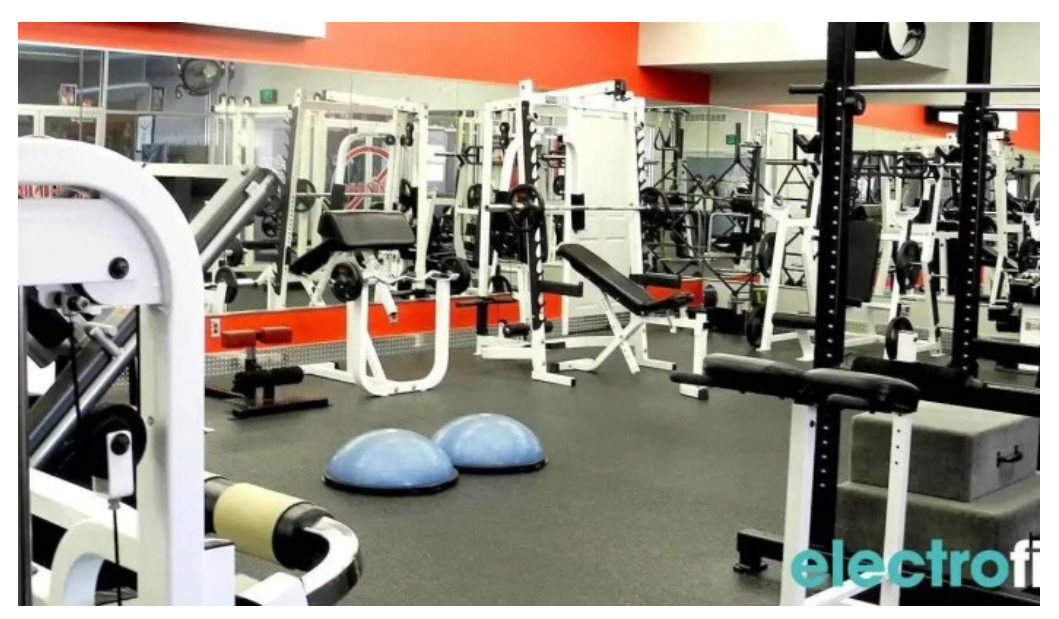
Above average personal fitness systems green bay