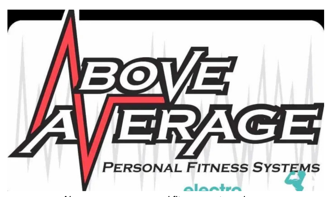
Above average personal fitness systems by owner