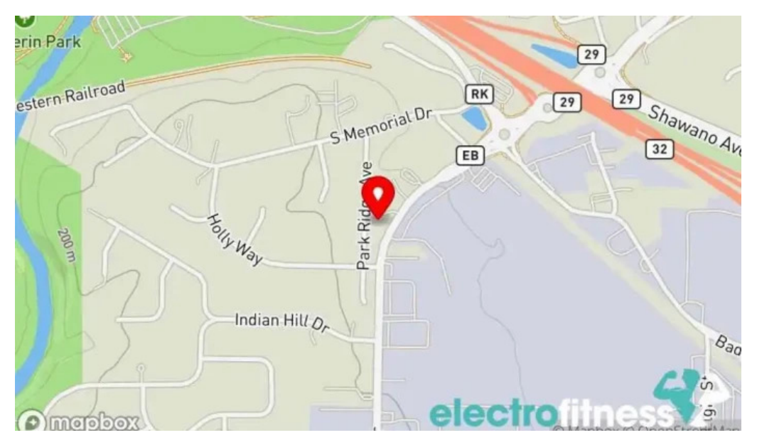
Above average personal fitness systems map