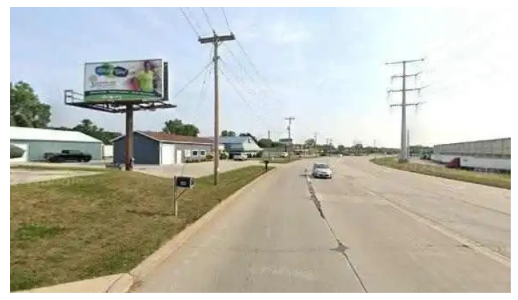
Above average personal fitness systems street view 360deg