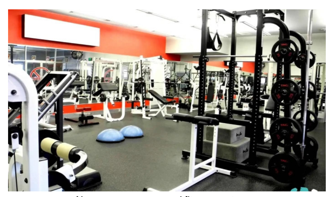
Above average personal fitness systems gym