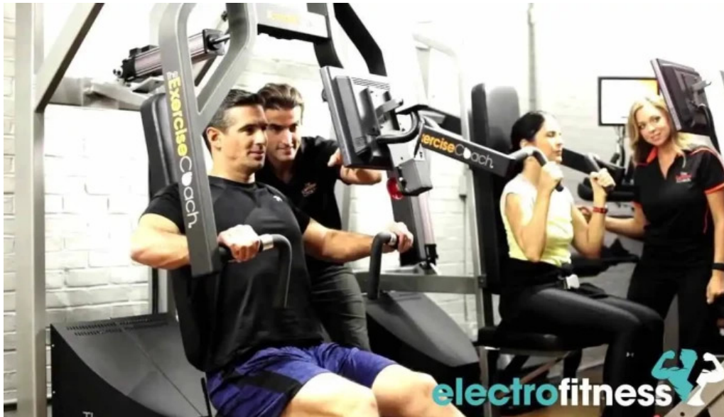
The exercise coach lone tree videos