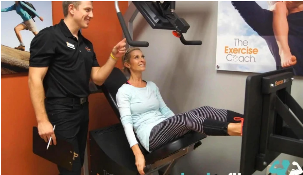
The exercise coach lone tree gym