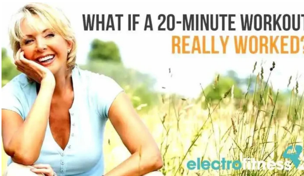
The exercise coach lone tree highlands ranch