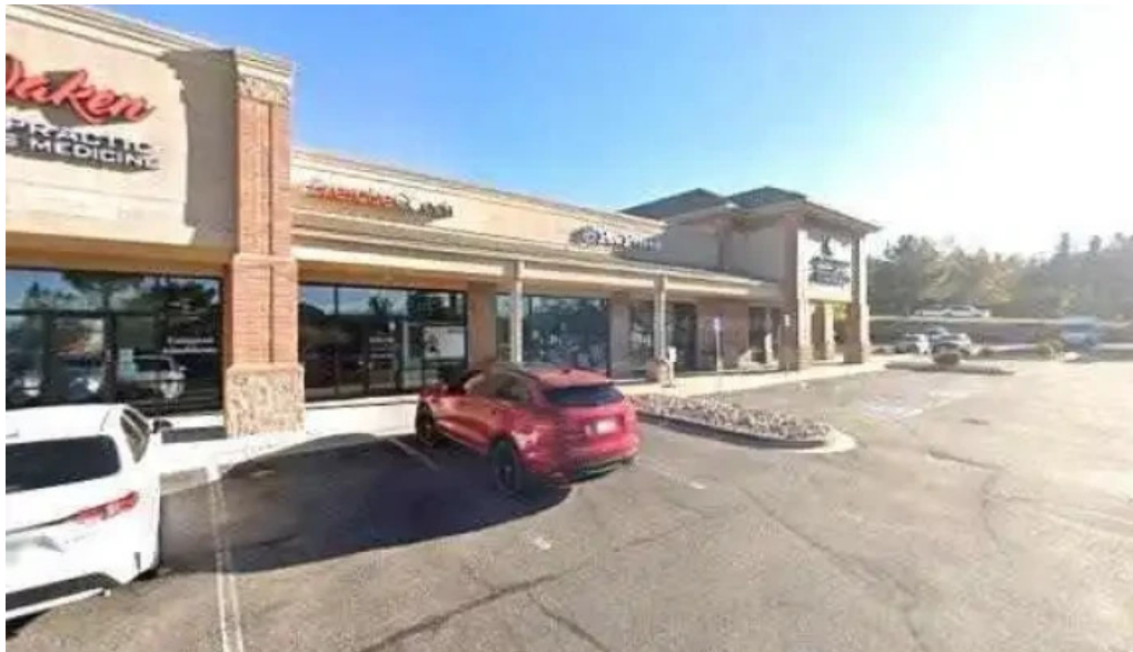
The exercise coach lone tree street view 360deg