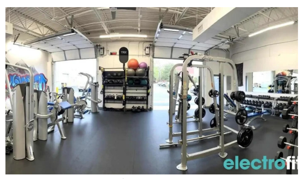
Total fitness colorado training