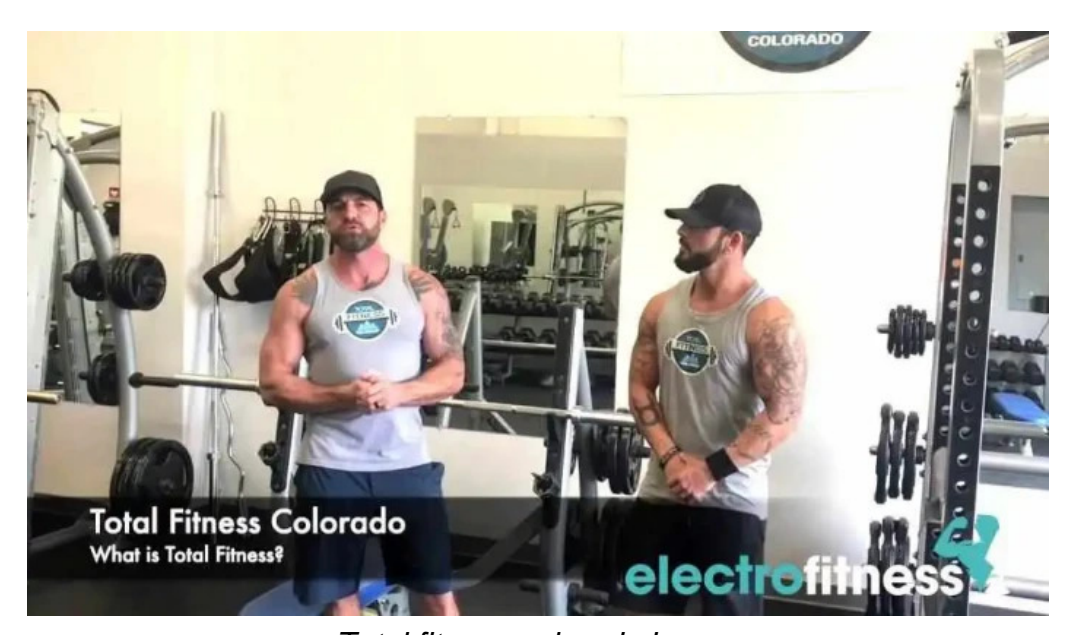
Total fitness colorado by owner