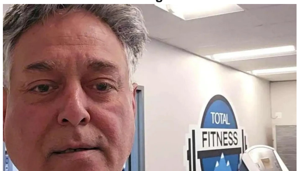
Total fitness colorado videos