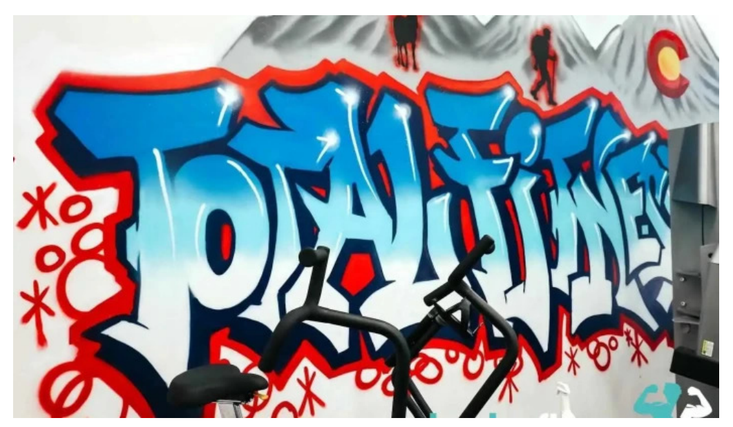
Total fitness colorado highlands ranch