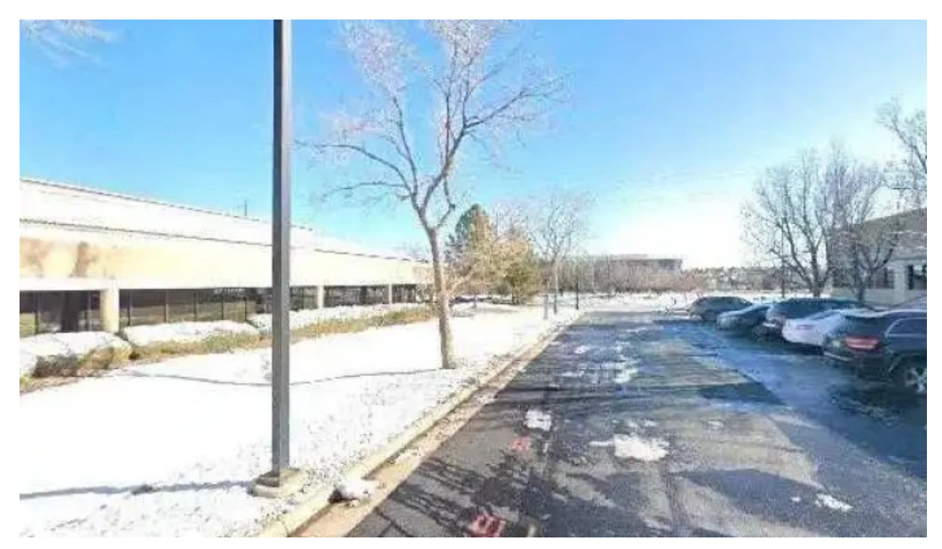
Total fitness colorado street view 360deg