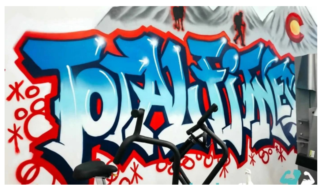
Total fitness colorado all