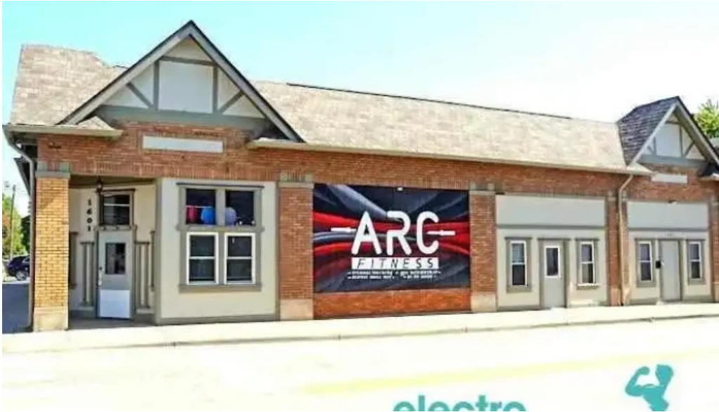
Arc fitness indianapolis