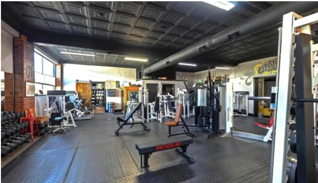
Arc fitness gym