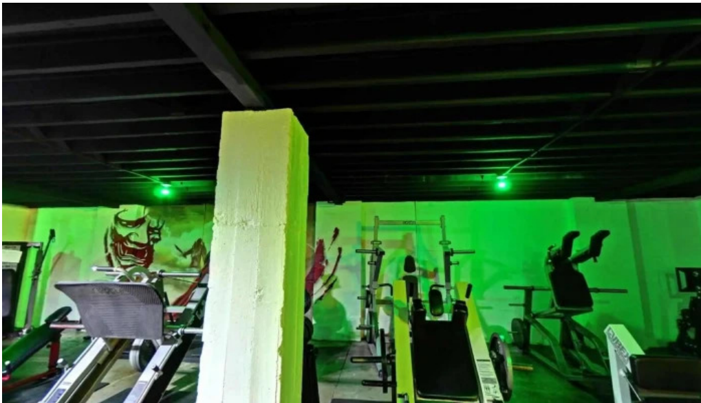
Arc fitness street view 360deg