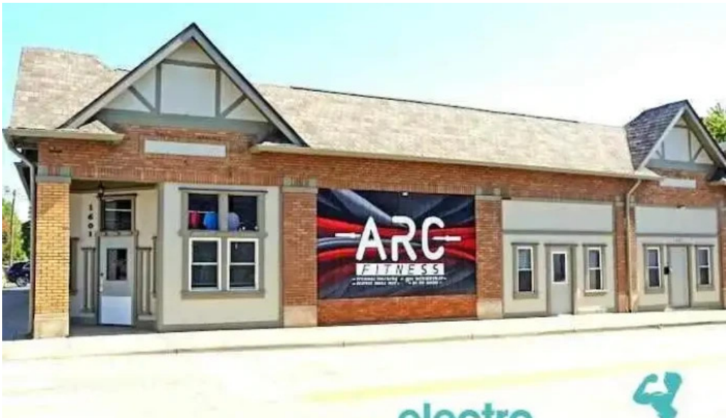
Arc fitness all