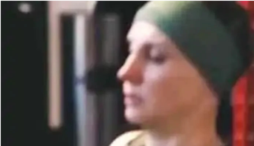
Arc fitness videos