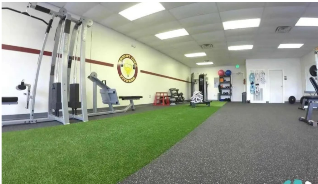
Bright idea fitness lafayette