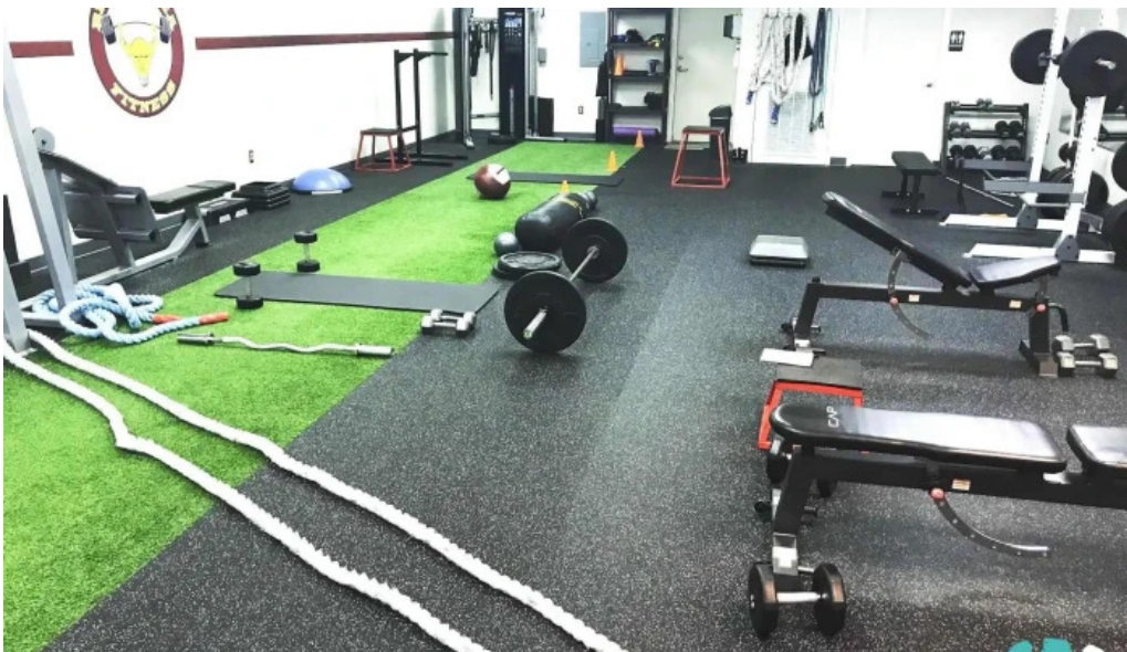
Bright idea fitness physical fitness