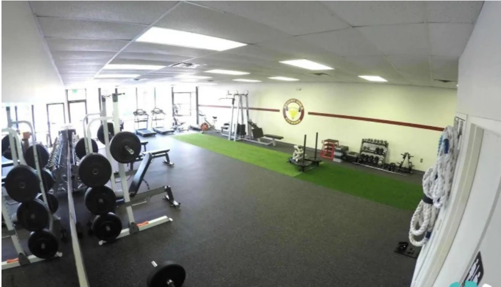
Bright idea fitness by owner