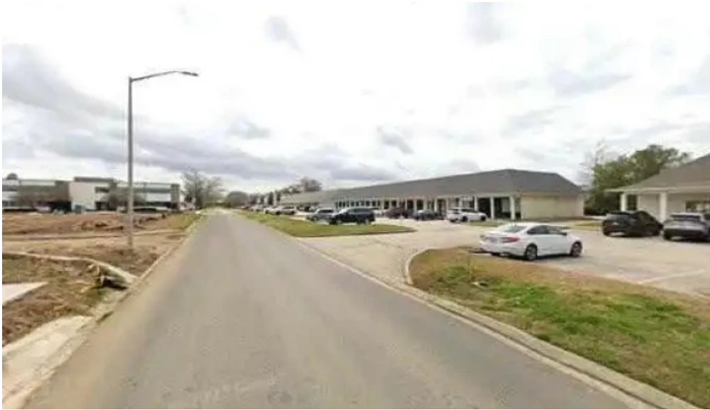
Bright idea fitness street view 360deg