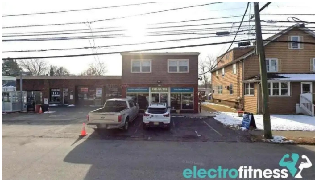
Embracing fitness little falls township