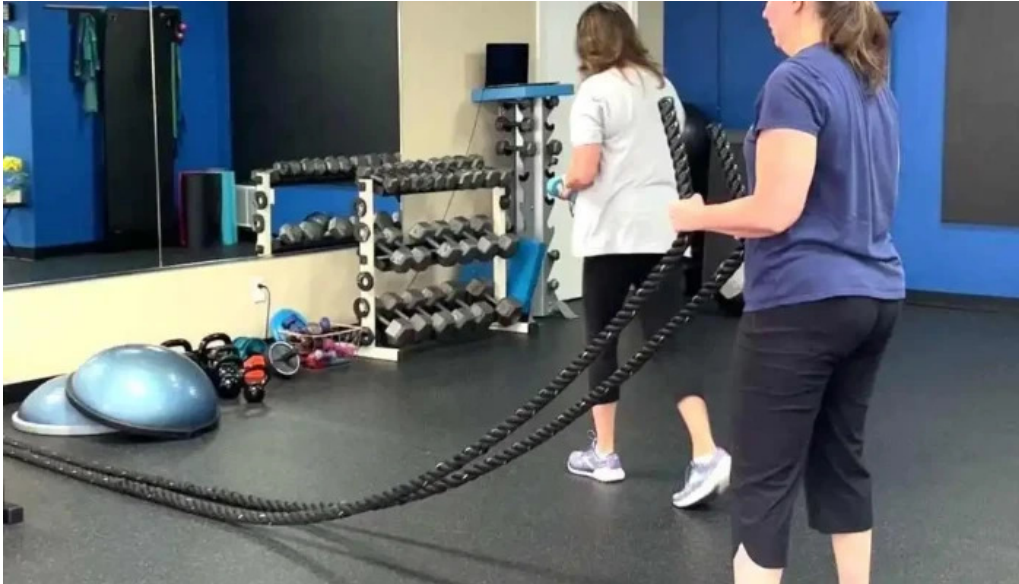
Aim for fitness physical fitness