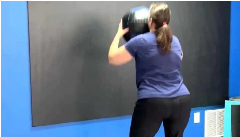
Aim for fitness videos