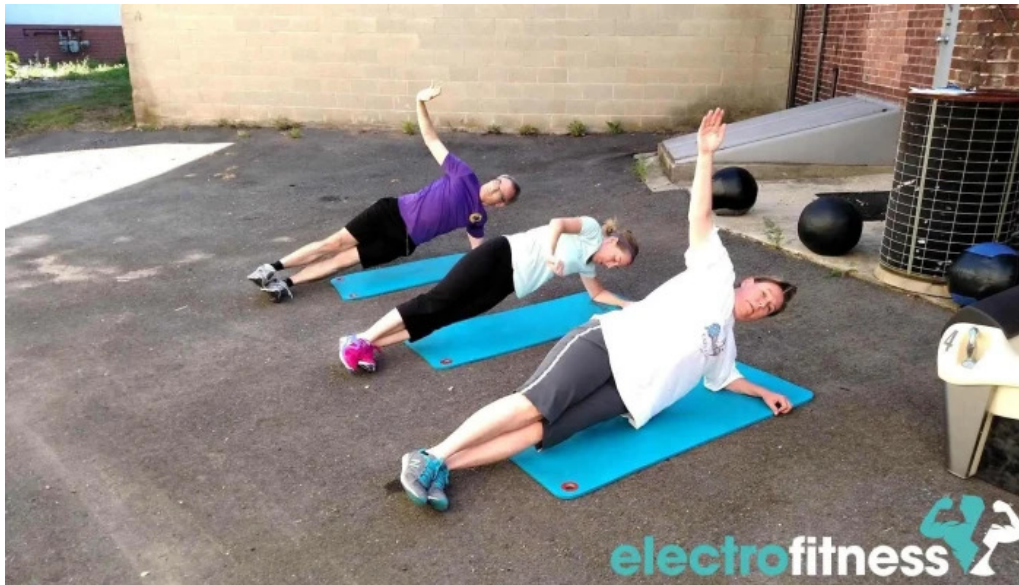
Aim for fitness training