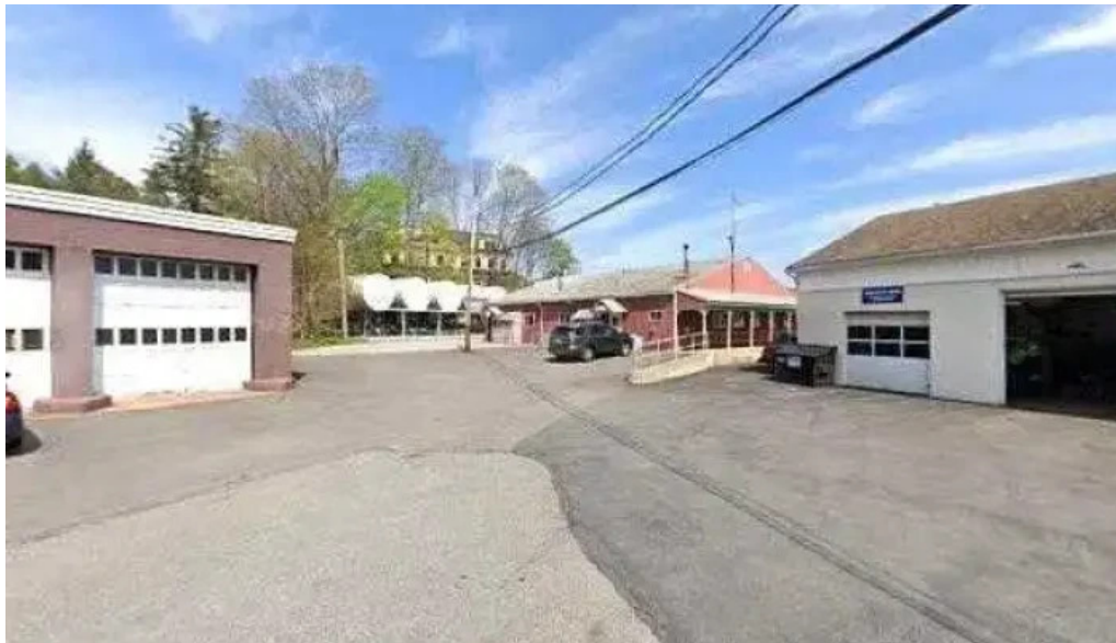
Aim for fitness street view 360deg