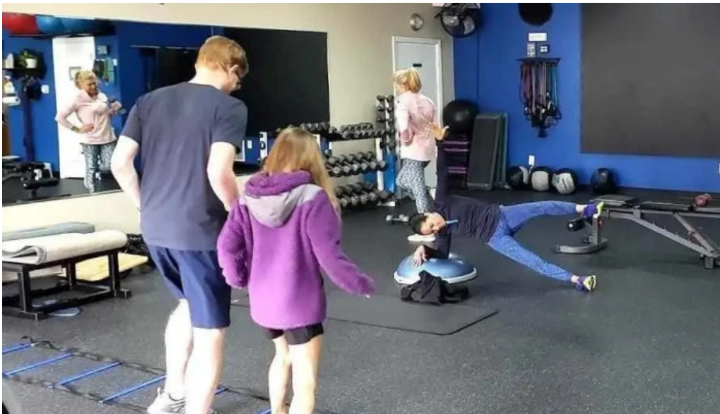
Aim for fitness maynard