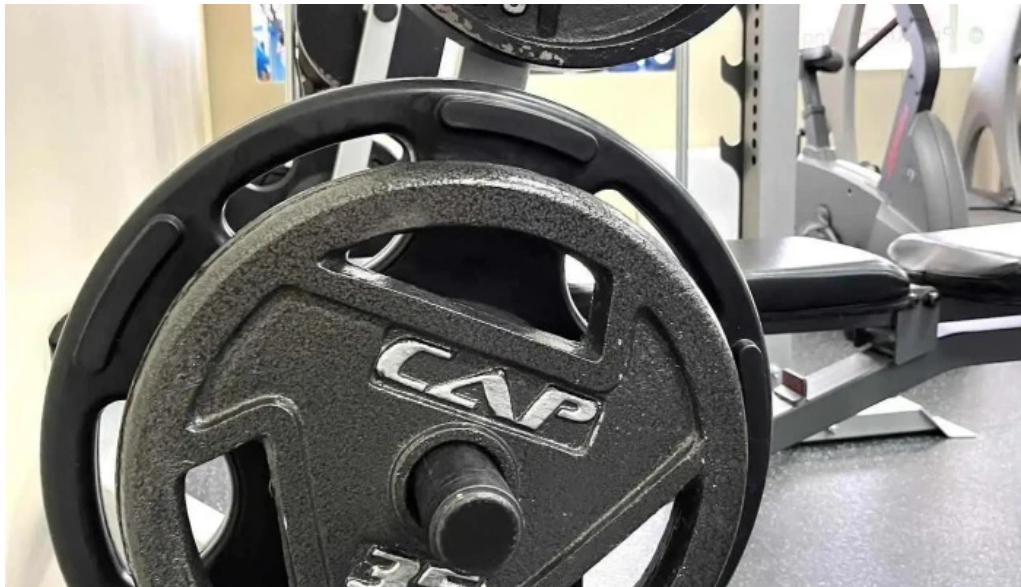
Aim for fitness by owner