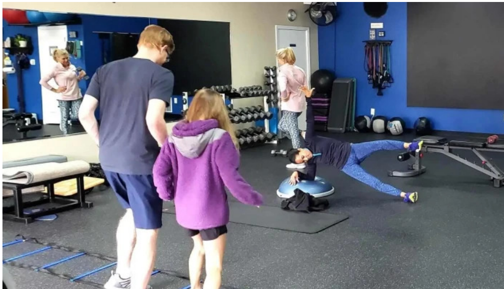
Aim for fitness all