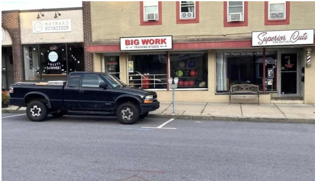
Big work training studio by owner