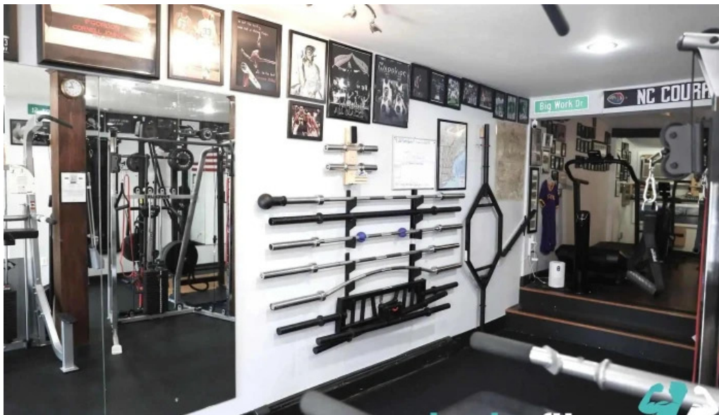
Big work training studio all