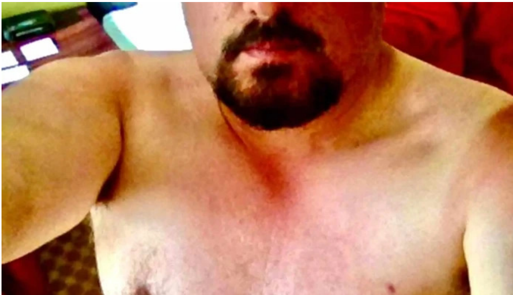
Big work training studio maynard