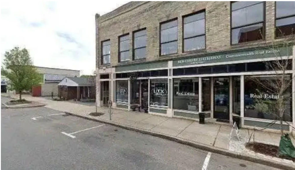
Big work training studio street view 360deg