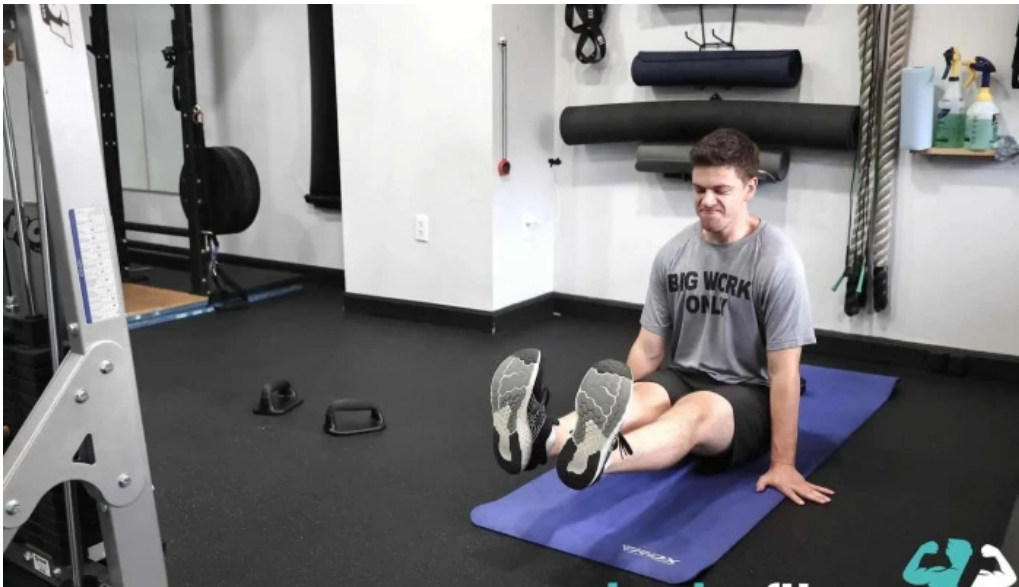
Big work training studio physical fitness