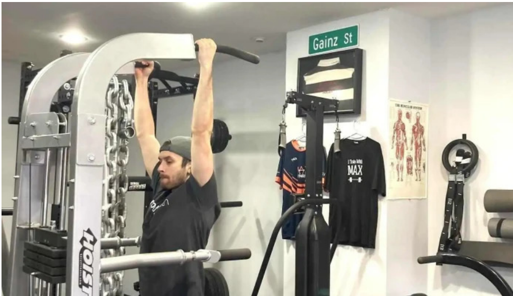
Big work training studio training