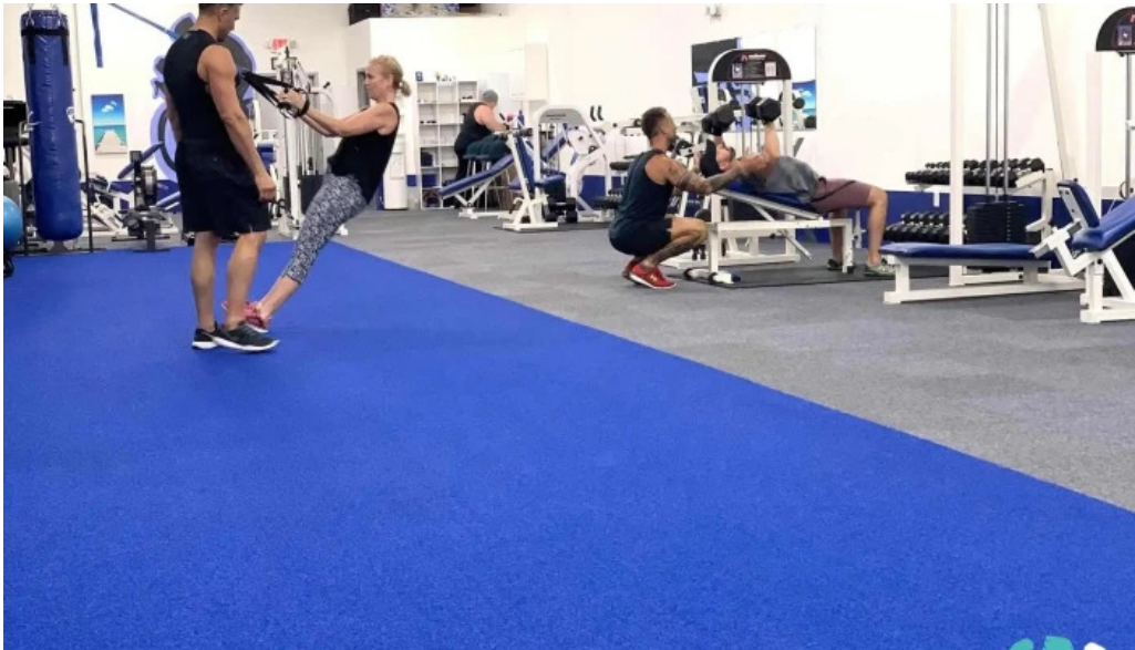
Hiperfit personal training training