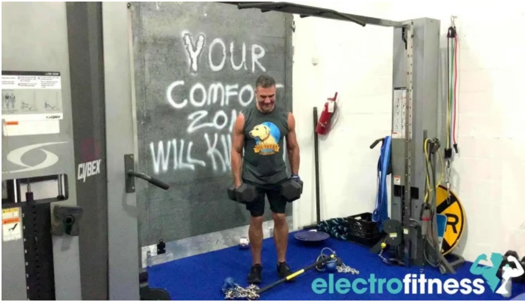
Hiperfit personal training videos

correct it promptly. Thank you in advance thanks.