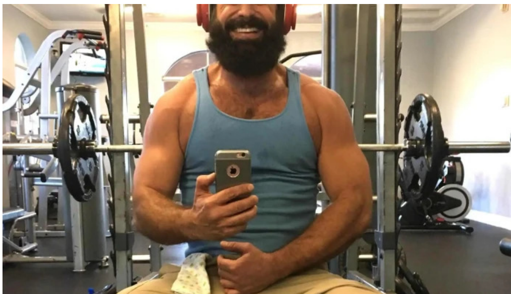
Hiperfit personal training miami