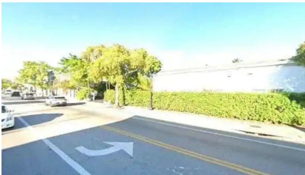
Hiperfit personal training street view 360deg