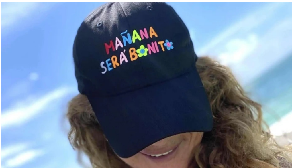
Hiperfit personal training personal trainer