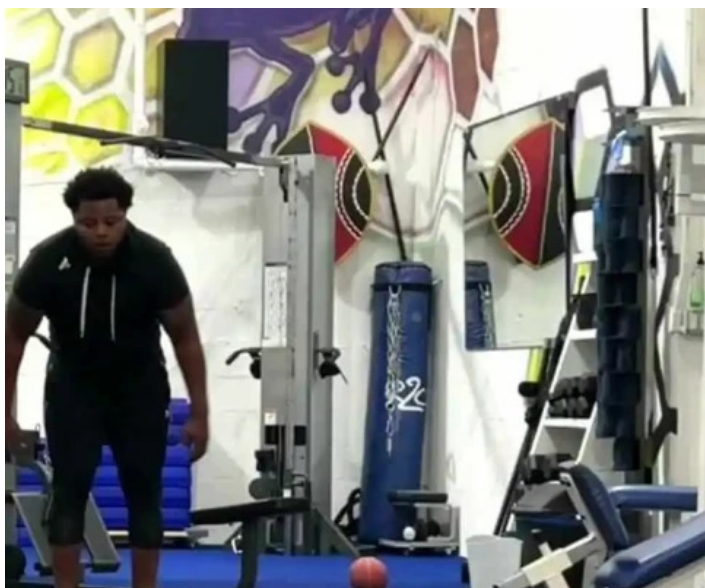
Hiperfit personal training physical fitness