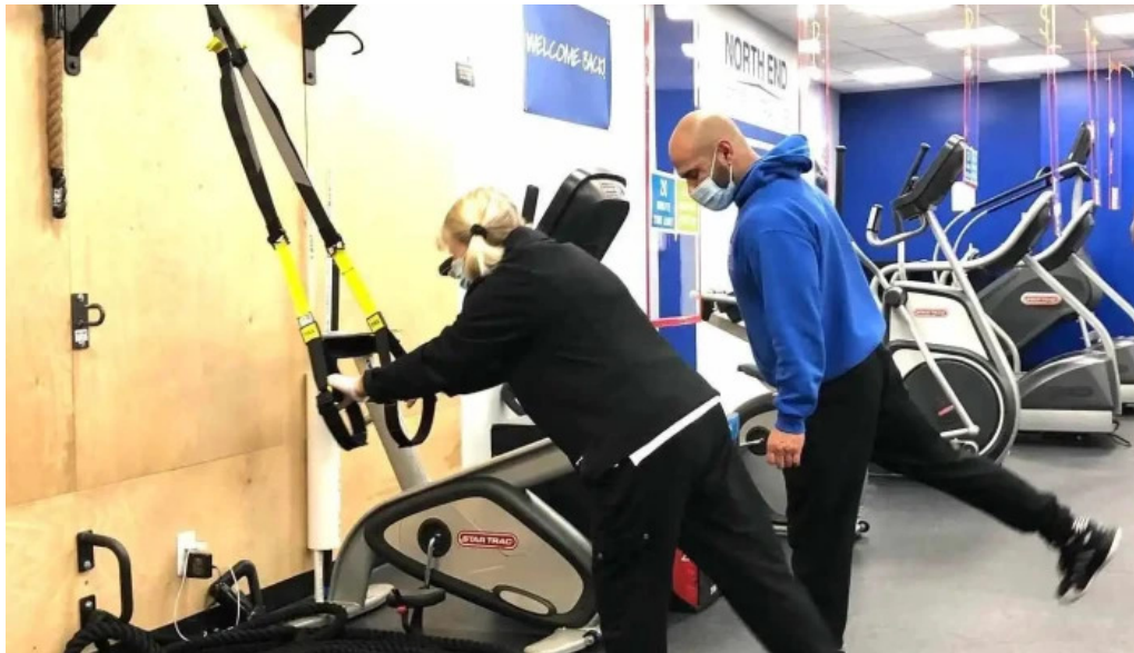
North end fitness training professional fitness coach