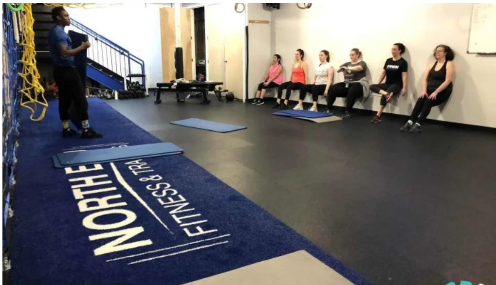
North end fitness training physical fitness