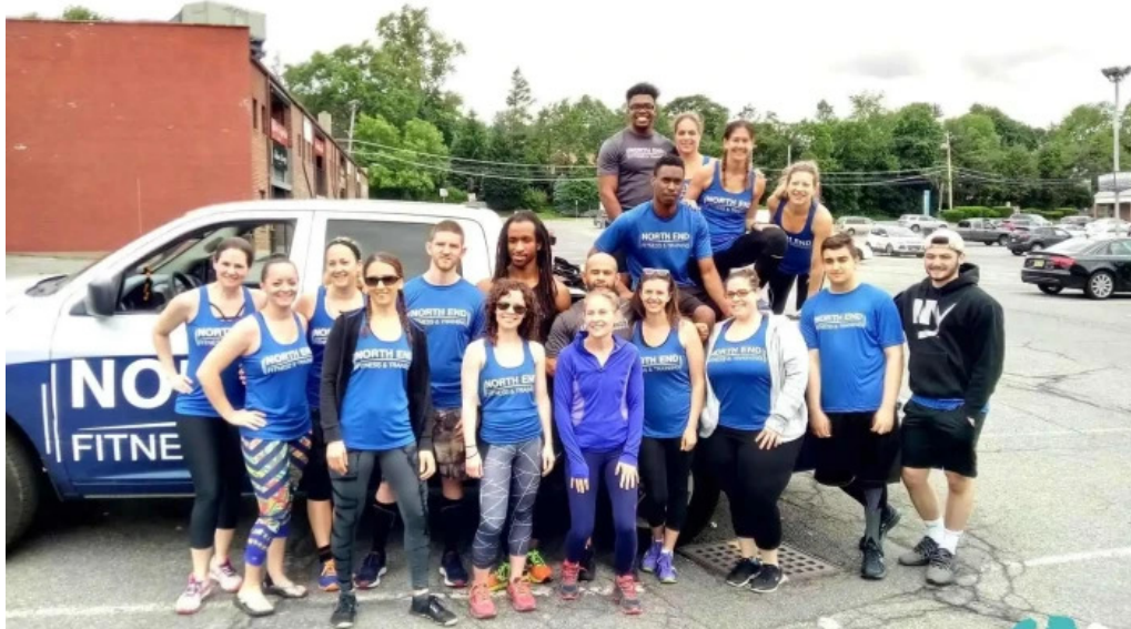
North end fitness training by owner