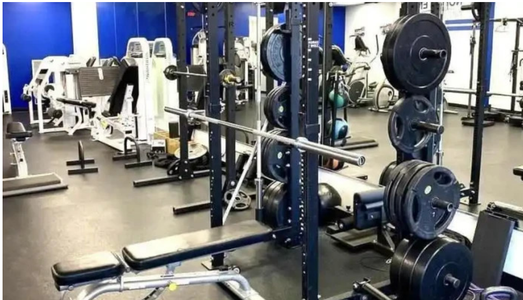
North end fitness training training