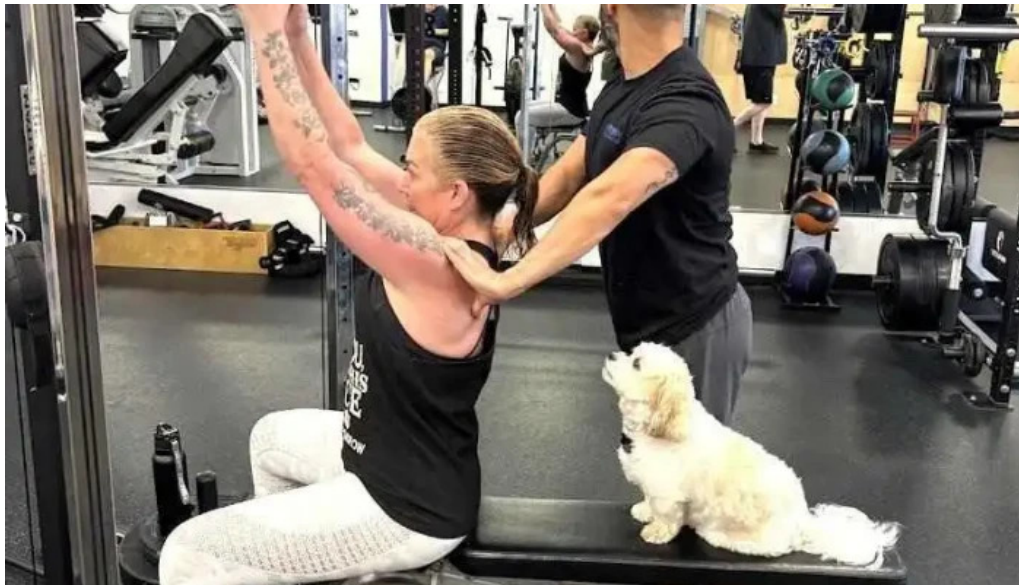
North end fitness training new rochelle