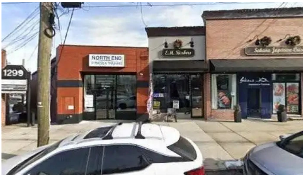
North end fitness training street view 360deg