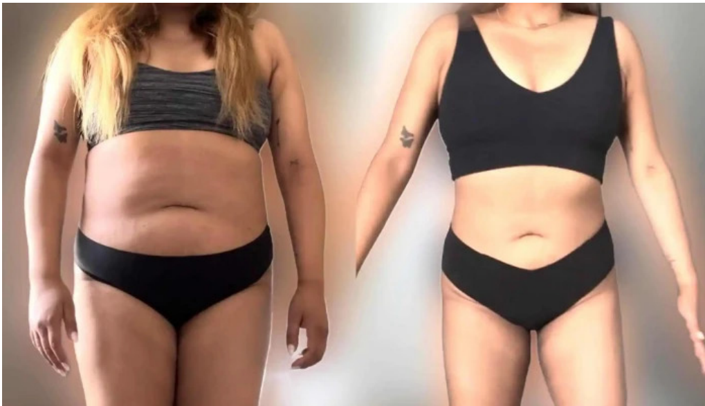
Abby ball fitness latest