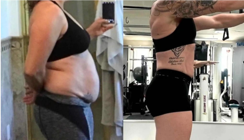
Abby ball fitness physical fitness