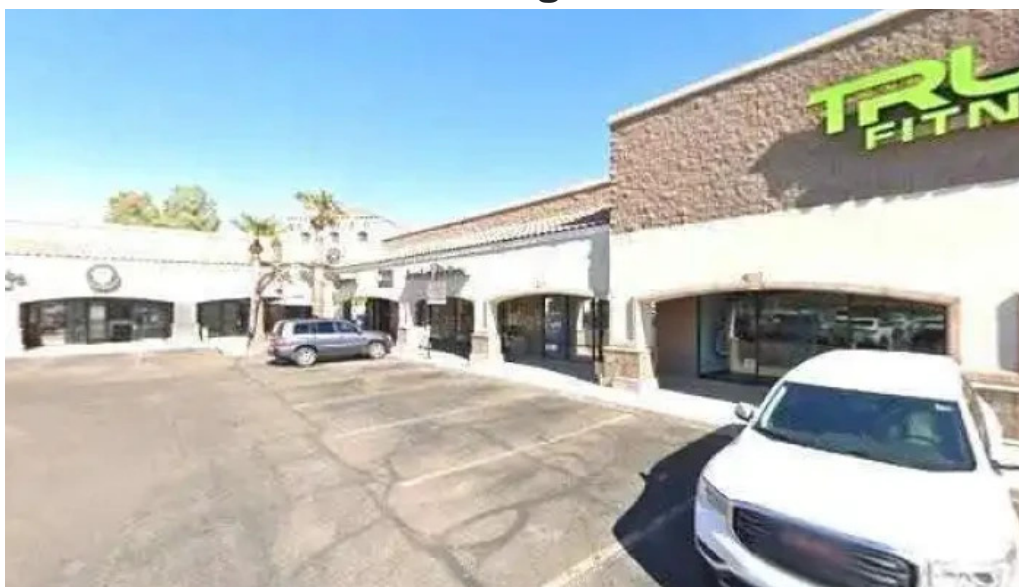
Abby ball fitness street view 360deg