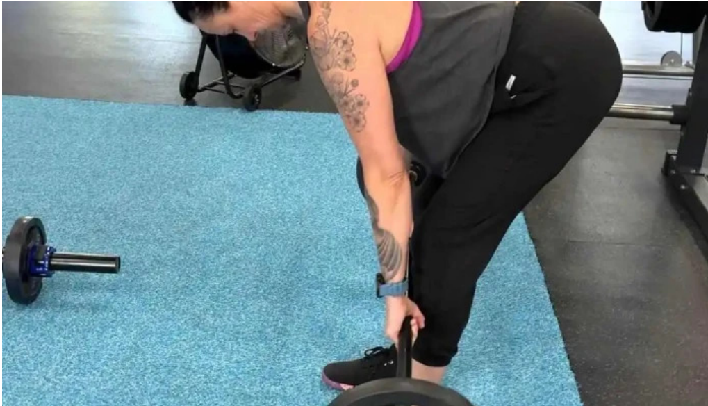
Abby ball fitness gym