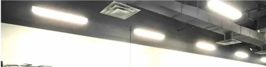
Visualize fitness physical fitness