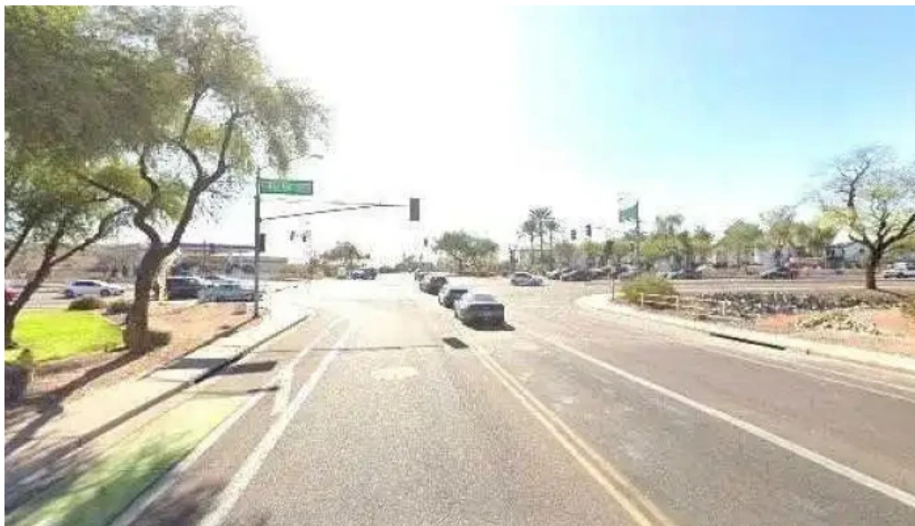
Visualize fitness all