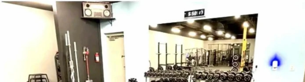
Visualize fitness by owner