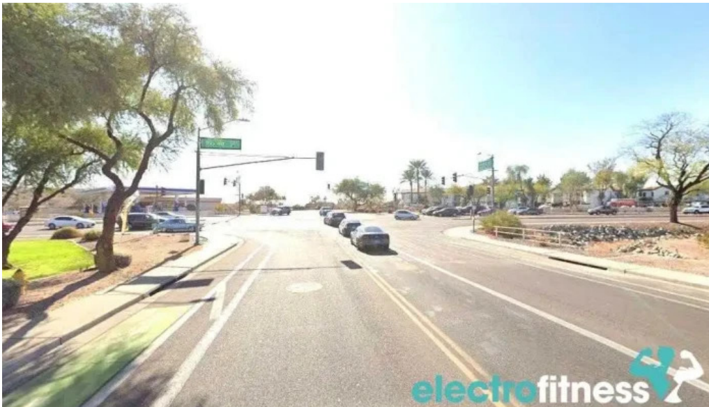
Visualize fitness phoenix