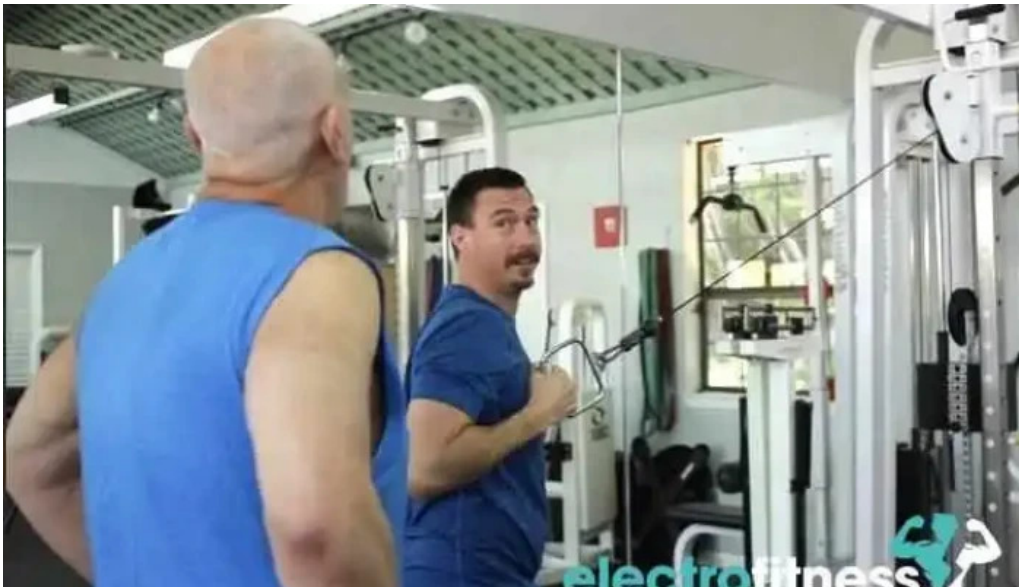
Live good fitness pleasant hill