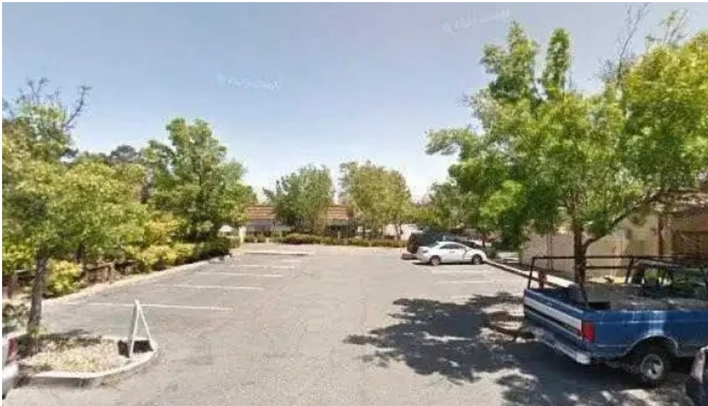
Live good fitness street view 360deg