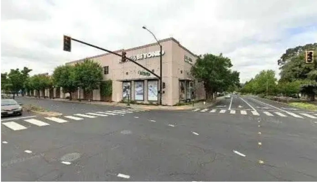
Pure fitness street view 360deg