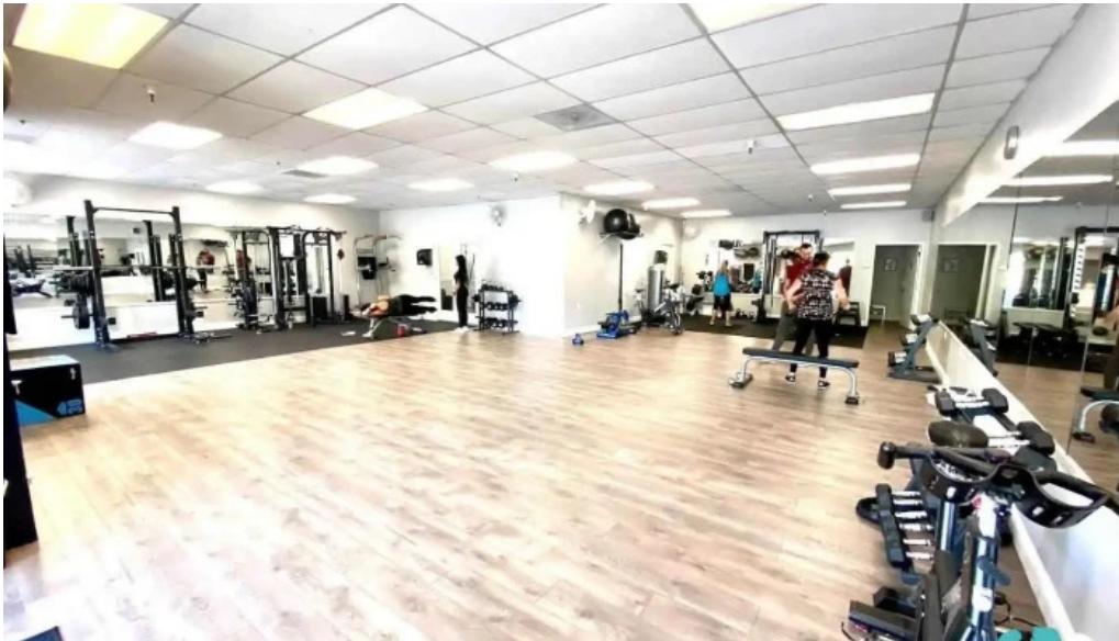
Pure fitness pleasant hill