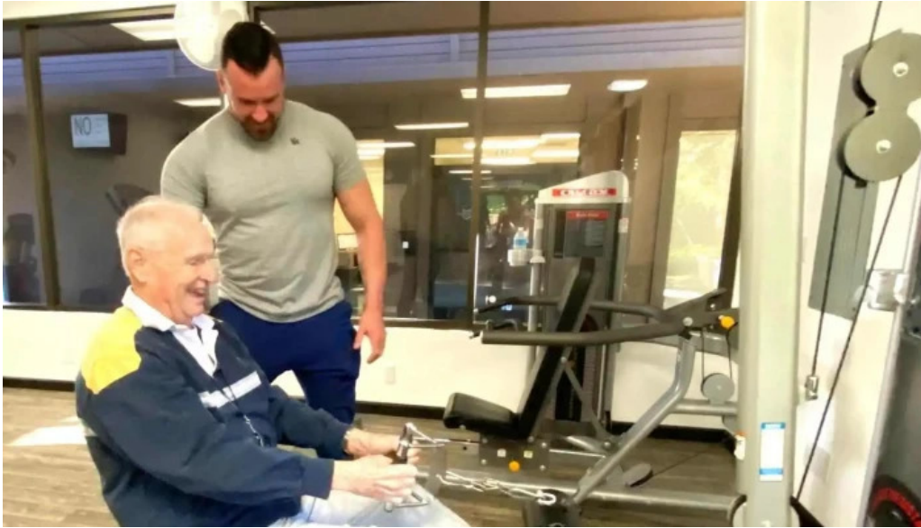
Pure fitness gym