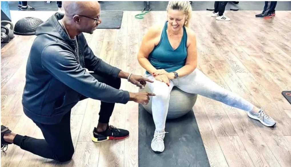
Pure fitness physical fitness