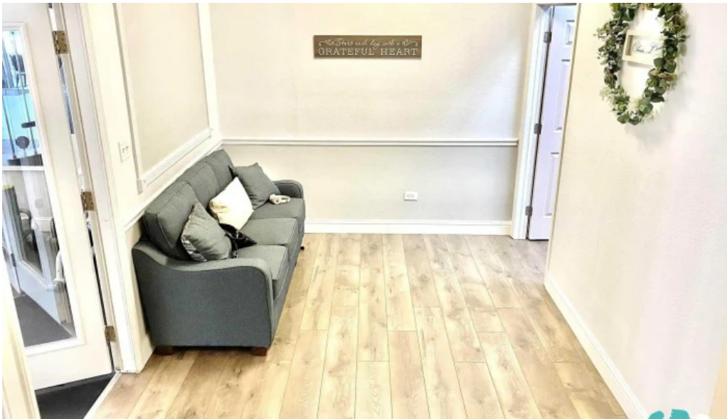
Pure fitness by owner