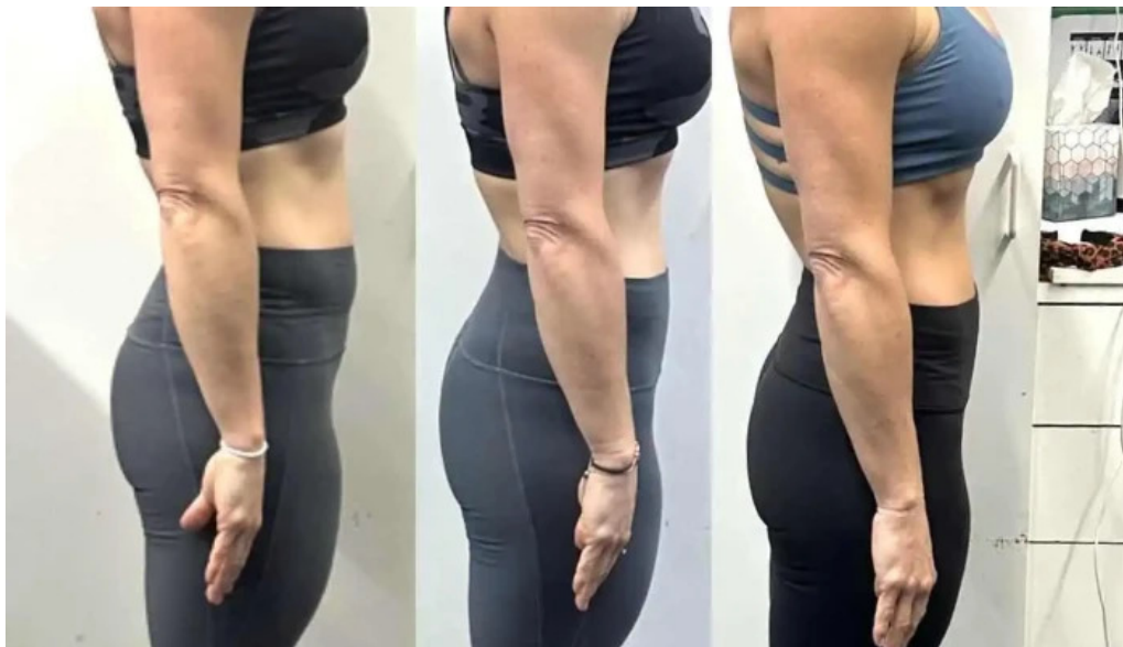
Lovingoodfitness llc physical fitness