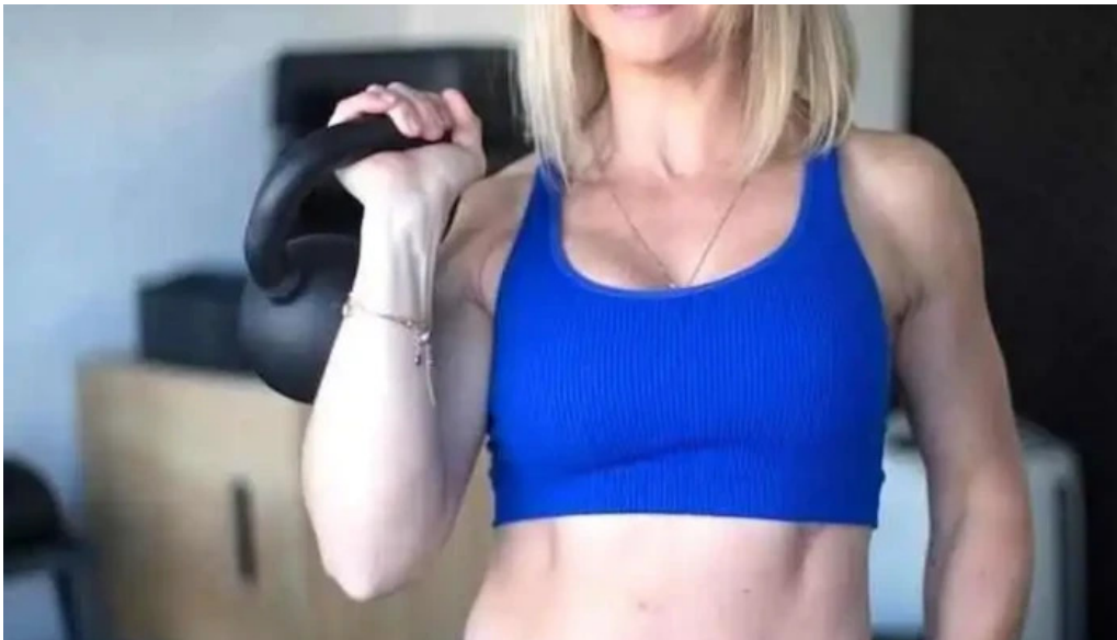
Lovingoodfitness llc santa clarita