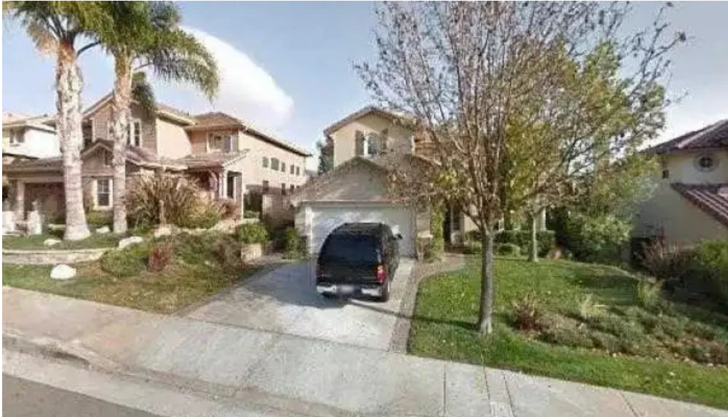
Lovingoodfitness llc street view 360deg