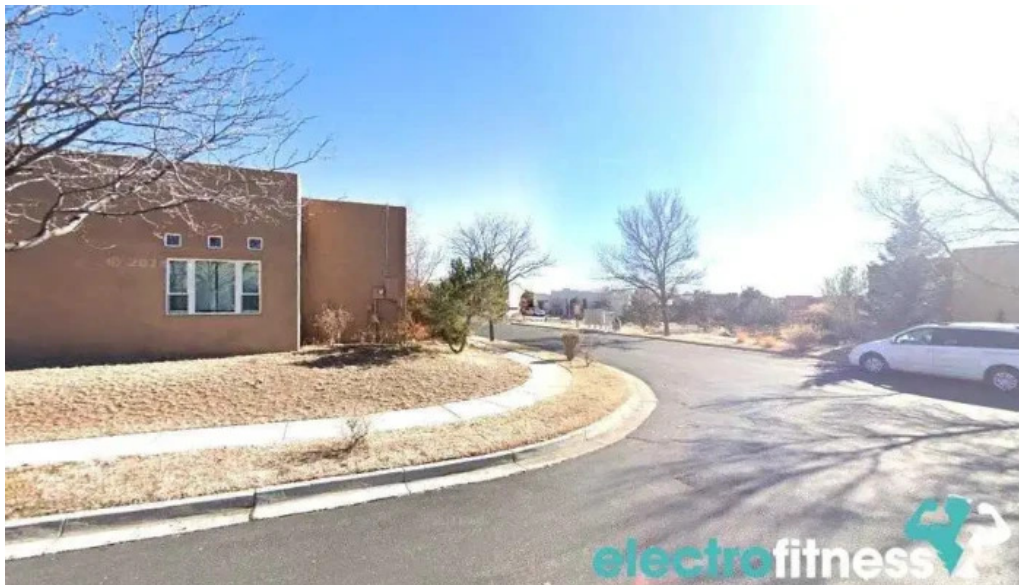
One chapter fitness santa fe