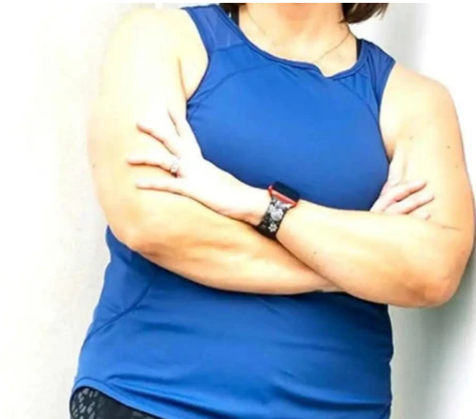
Livfit training studio physical fitness