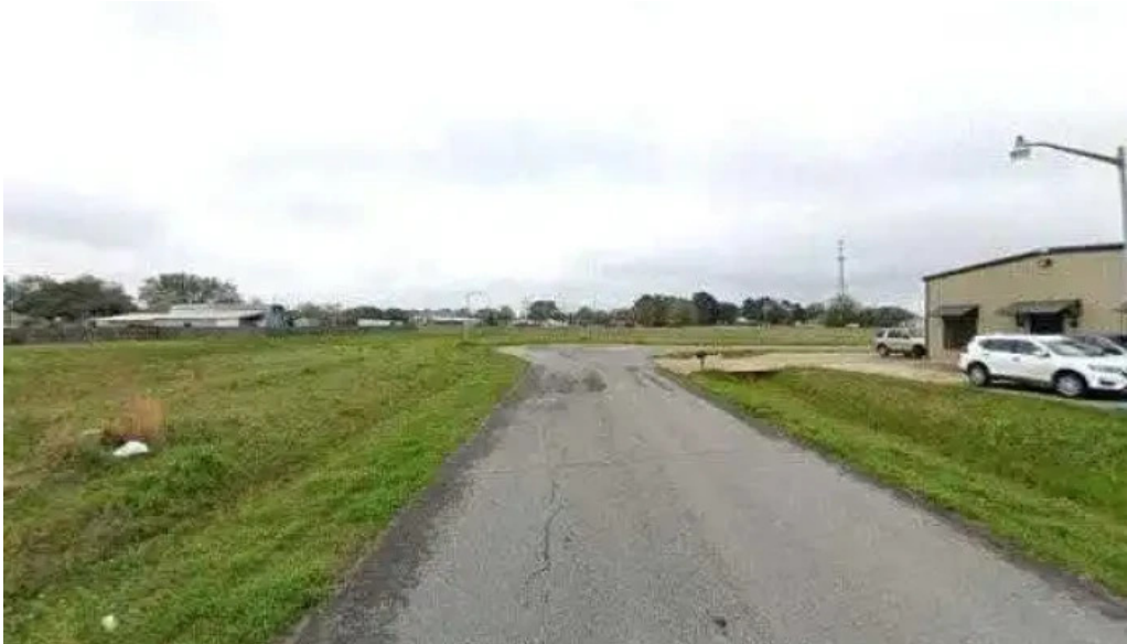
Livfit training studio street view 360deg