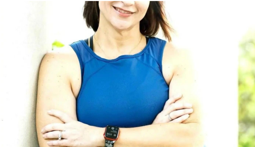
Livfit training studio by owner