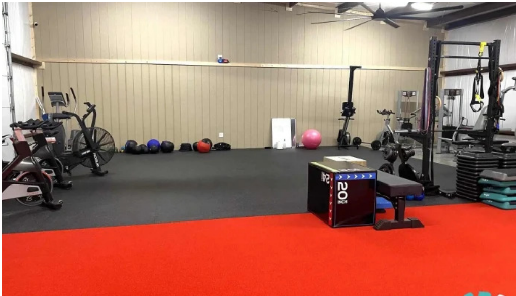
Livfit training studio all