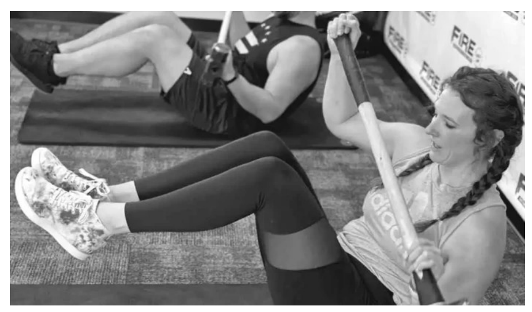
Fire fitness camp shawano by owner