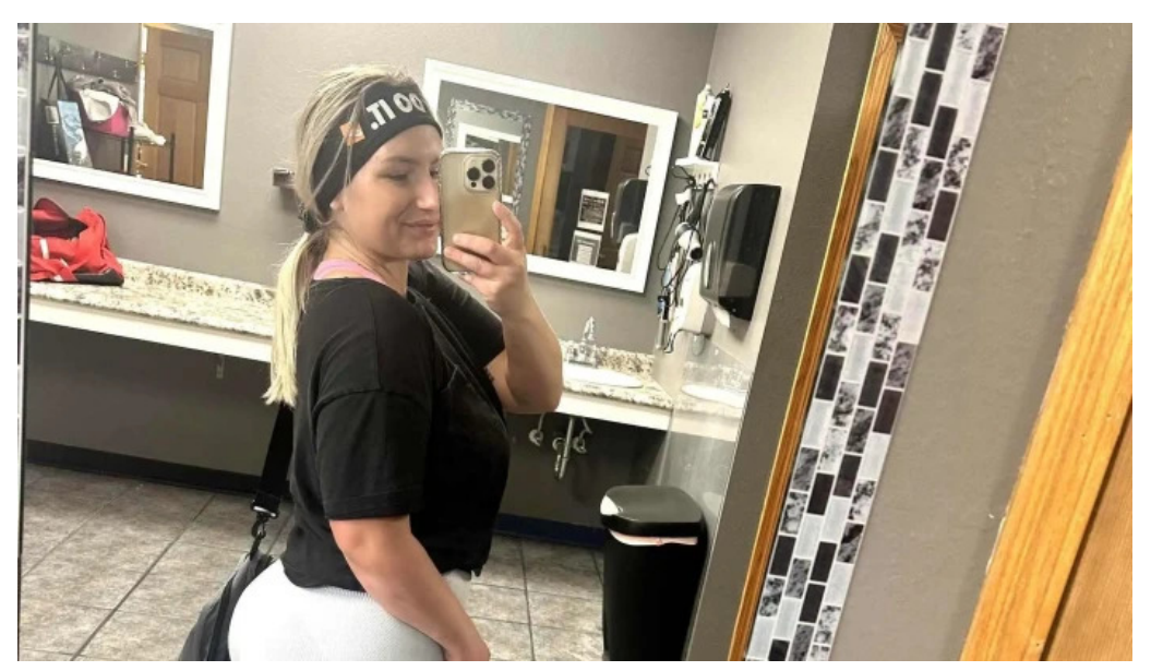
Fire fitness camp shawano personal trainer