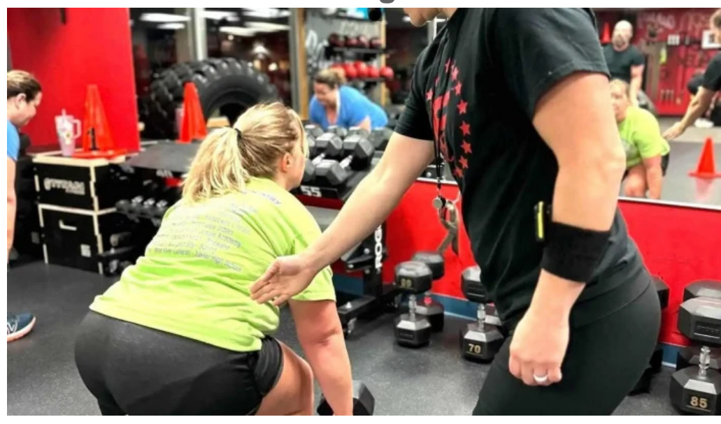
Fire fitness camp shawano training