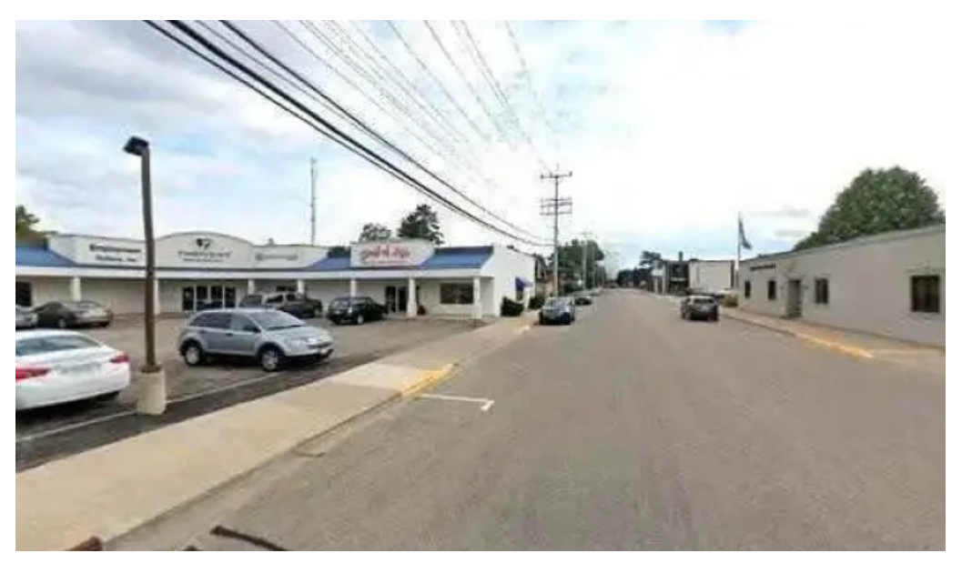
Fire fitness camp shawano street view 360