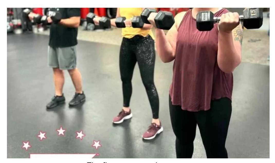
Fire fitness camp shawano gym