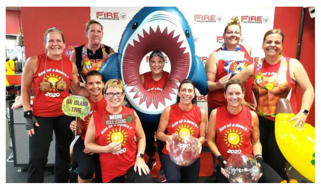
Fire fitness camp shawano physical fitness