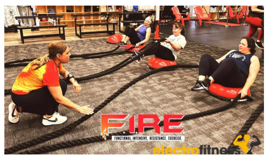
Fire fitness camp shawano all