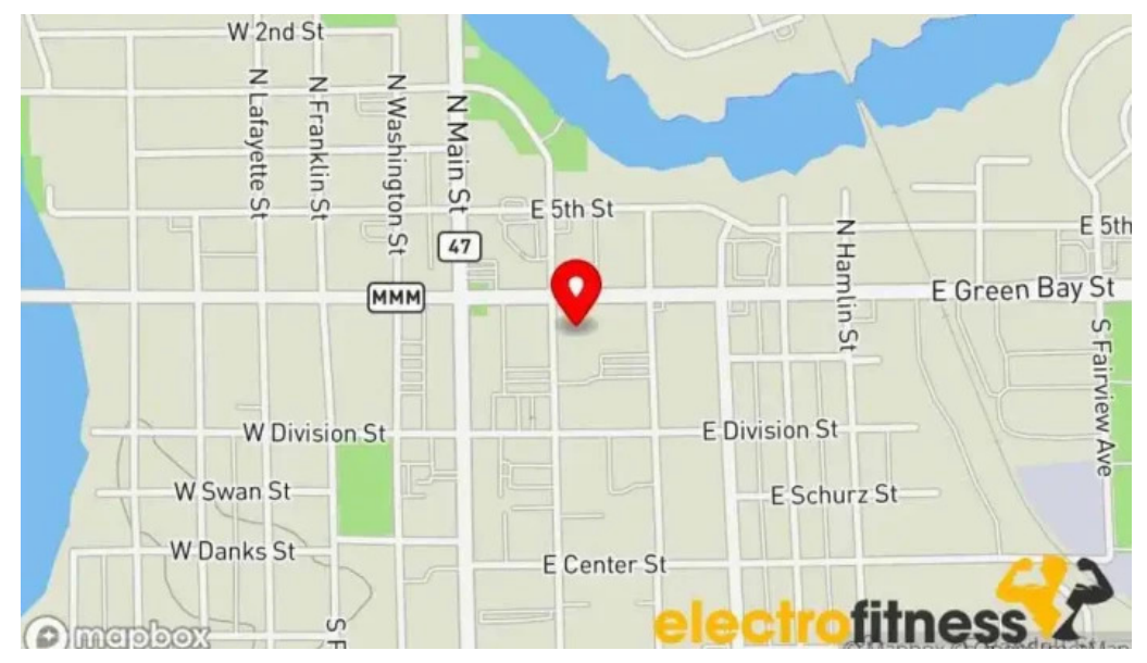
Fire fitness camp shawano map