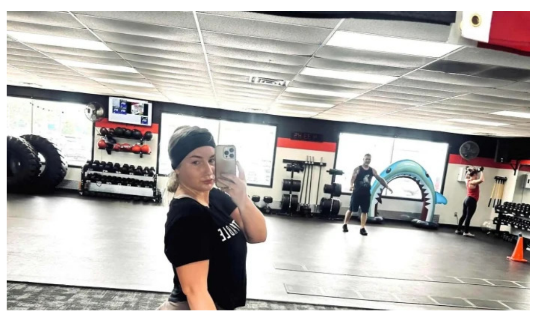
Fire fitness camp shawano shawano