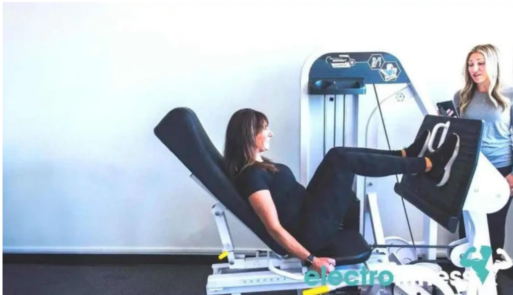
The perfect workout silver spring