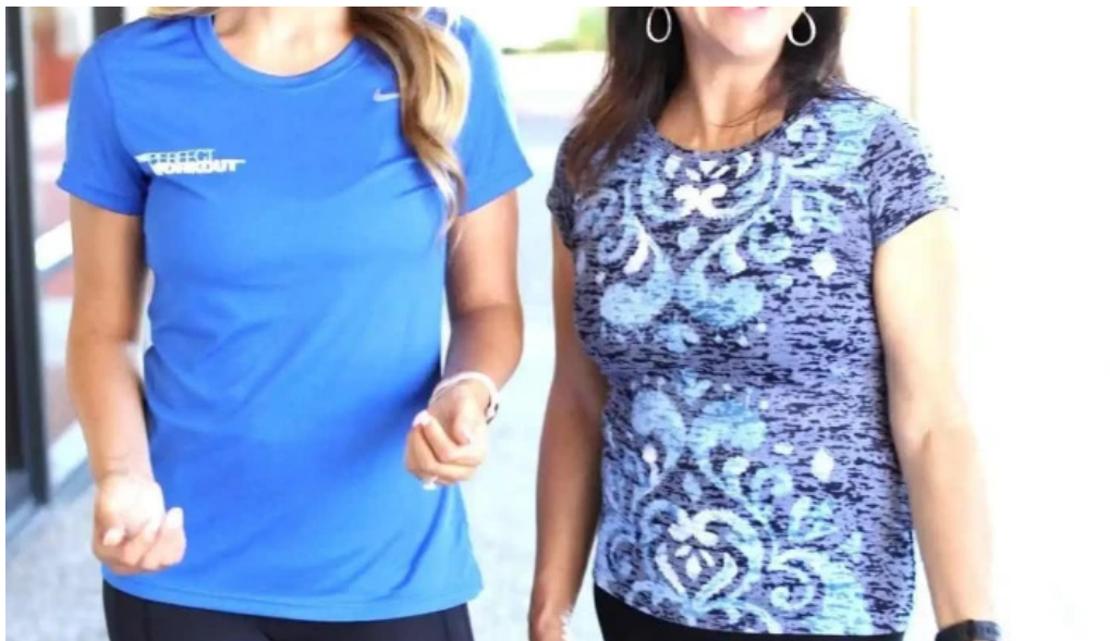
The perfect workout physical fitness