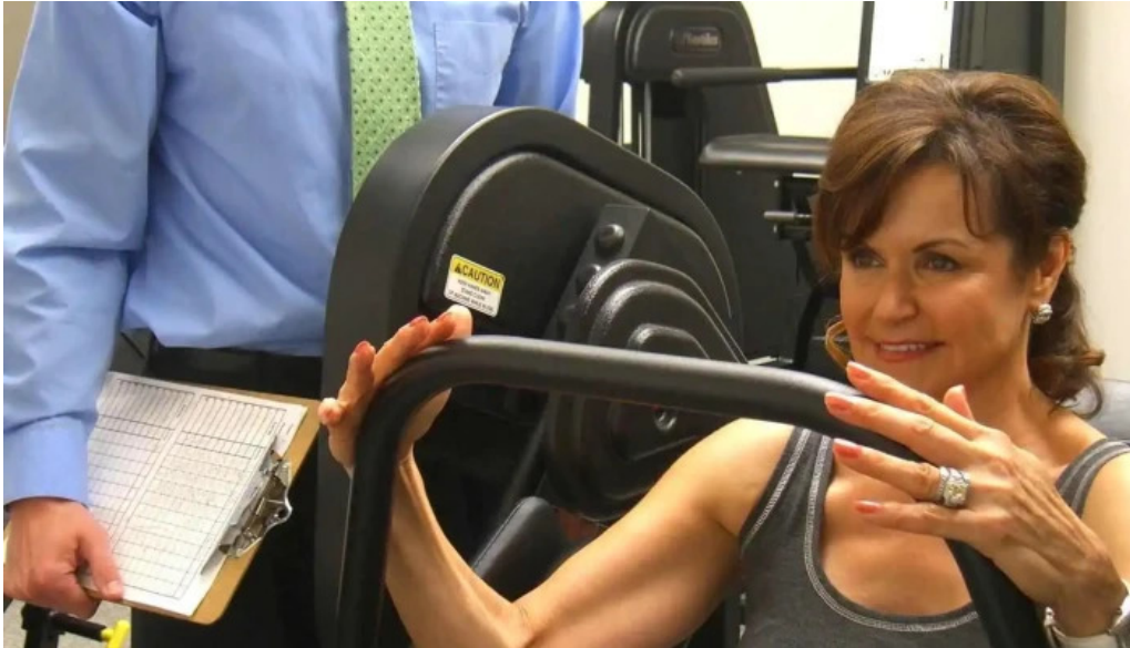
The perfect workout training