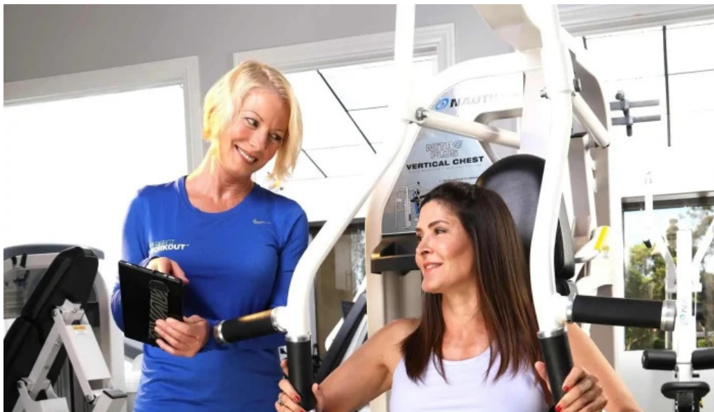
The perfect workout gym