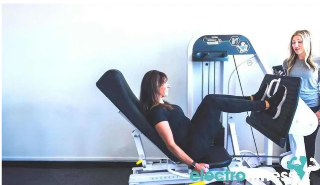
The perfect workout all