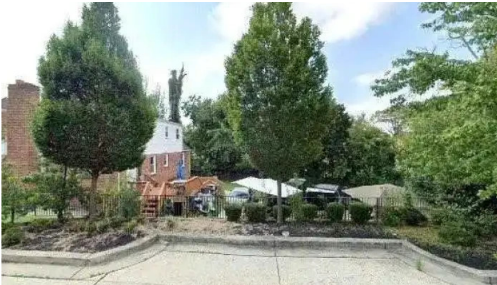
The perfect workout street view 360deg