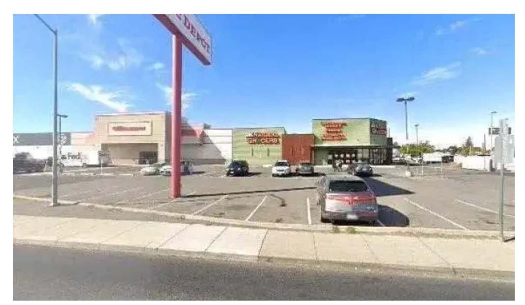
Body by biju one on one personal training private gym spokane street view 360deg