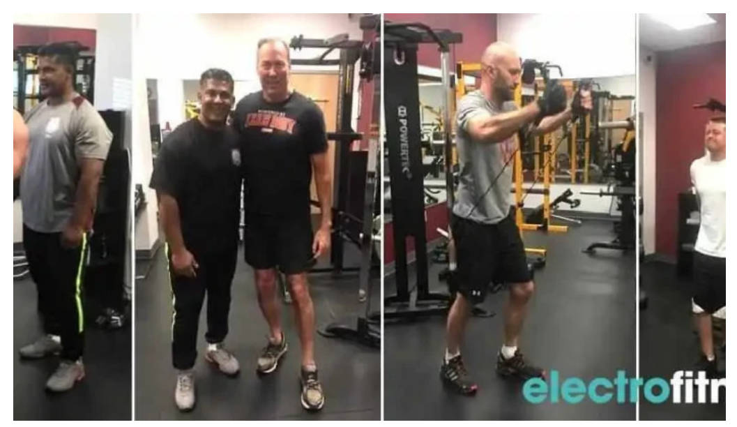
Body by biju one on one personal training private gym spokane all