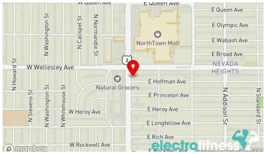
Body by biju one on one personal training private gym spokane map