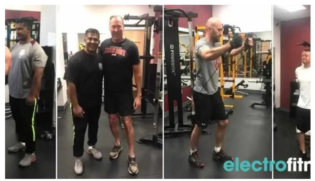
Body by biju one on one personal training private gym spokane spokane