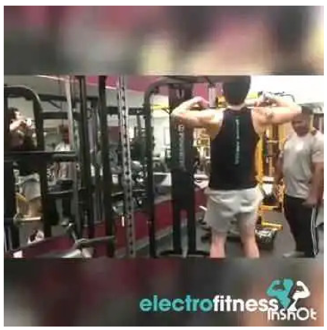
Body by biju one on one personal training private gym spokane videos