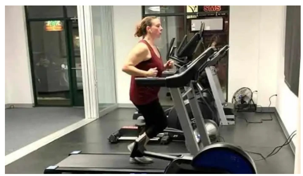
Body by biju one on one personal training private gym spokane professional fitness coach