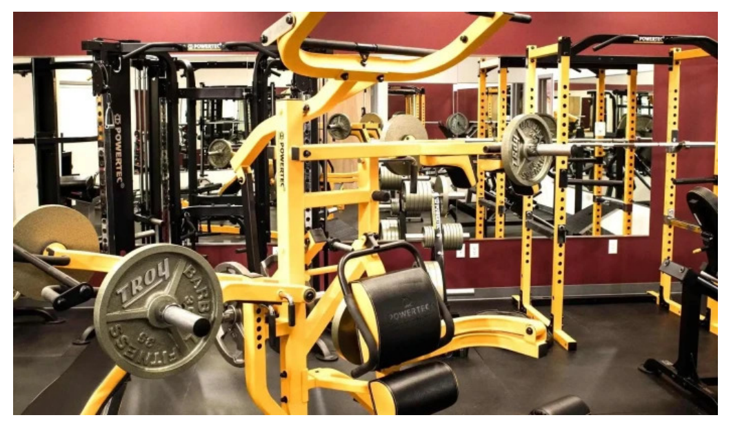
Body by biju one on one personal training private gym spokane by owner