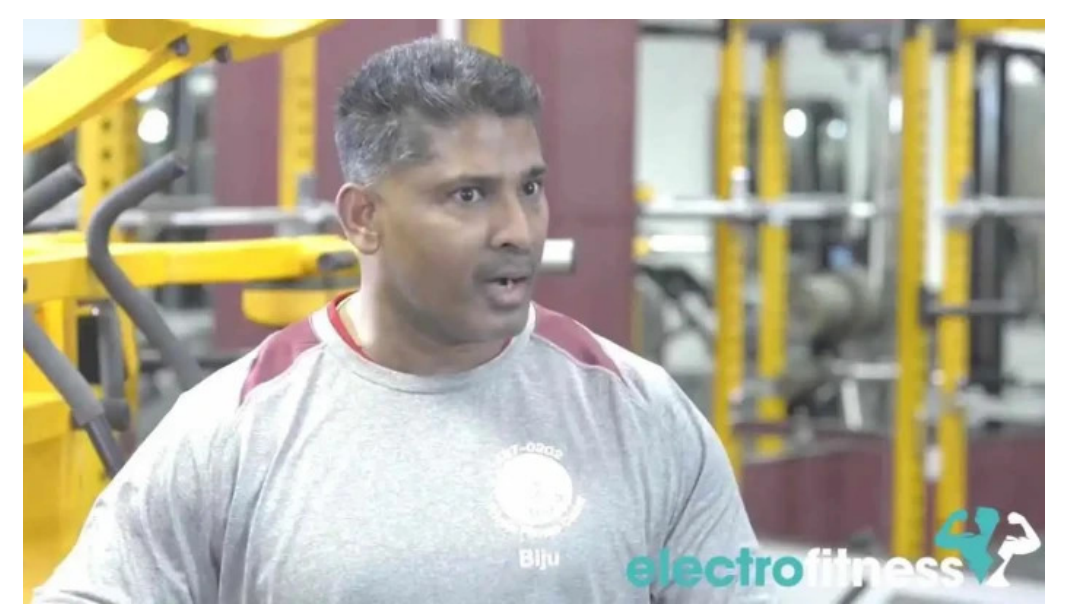
Body by biju one on one personal training private gym spokane physical fitness