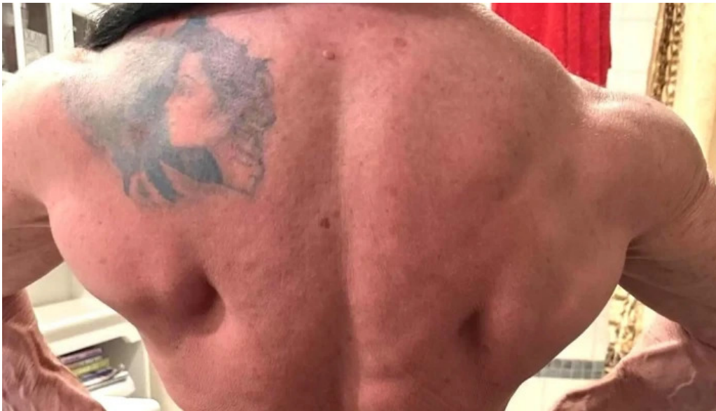
Sean shannon fitness personal fitness trainers personal trainer