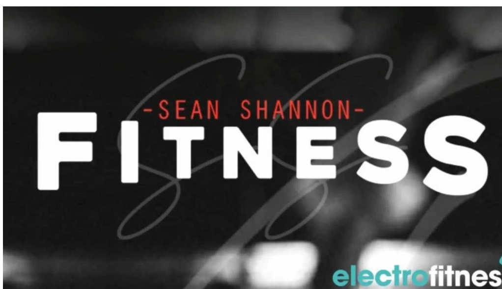
Sean shannon fitness personal fitness trainers all