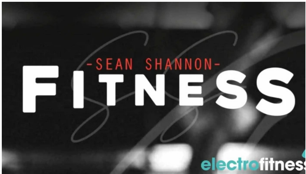
Sean shannon fitness personal fitness trainers temecula