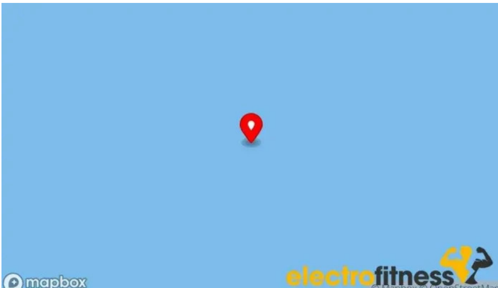
Fitness spot karate personal training map