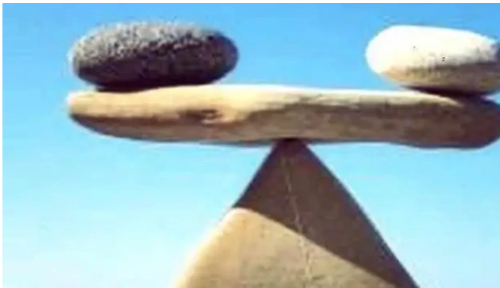
Fitness spot karate personal training all