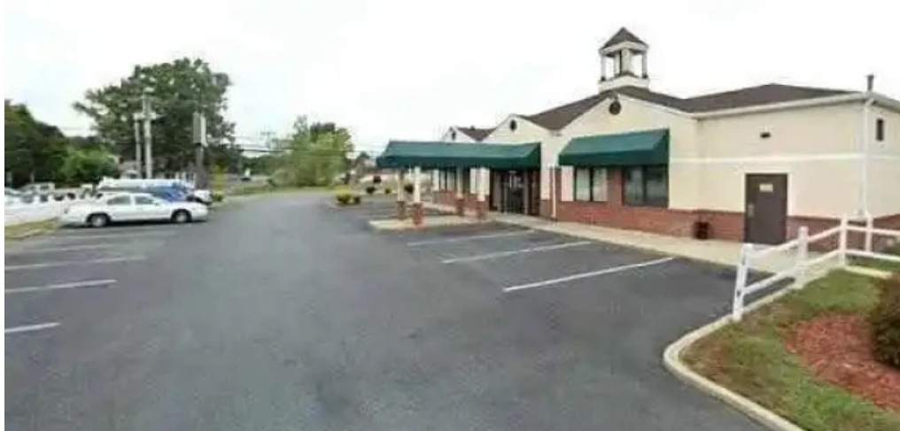
Strong health fitness center all