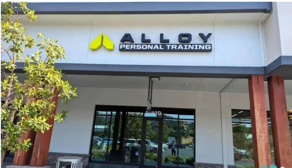
Alloy personal training rossmoor walnut creek