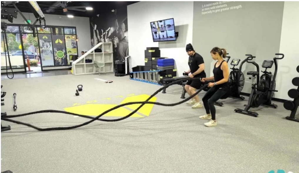
Alloy personal training rossmoor training