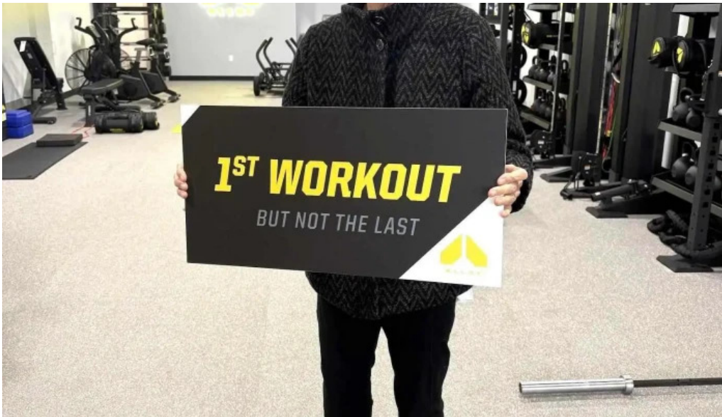
Alloy personal training rossmoor physical fitness