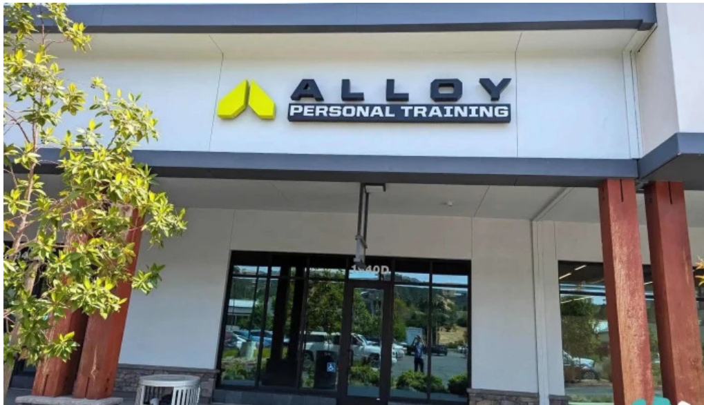
Alloy personal training rossmoor all