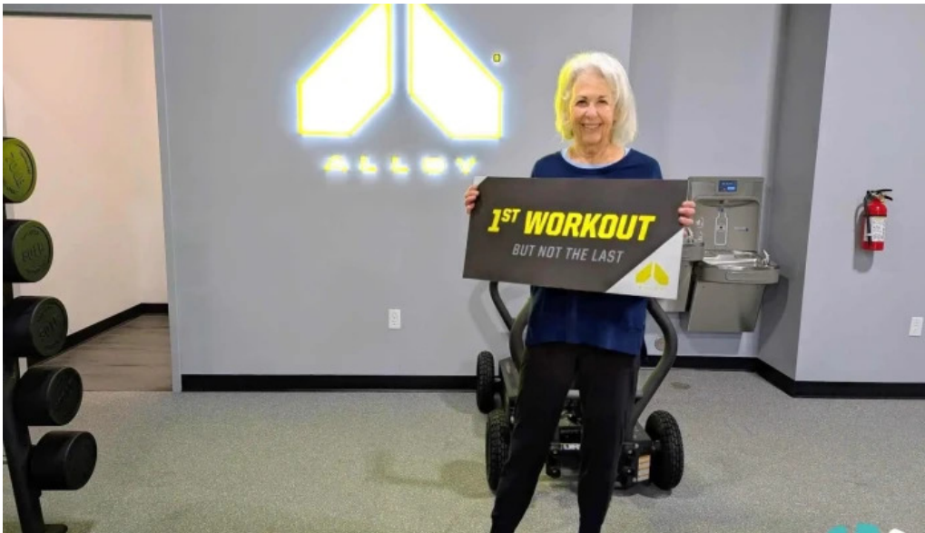
Alloy personal training rossmoor by owner