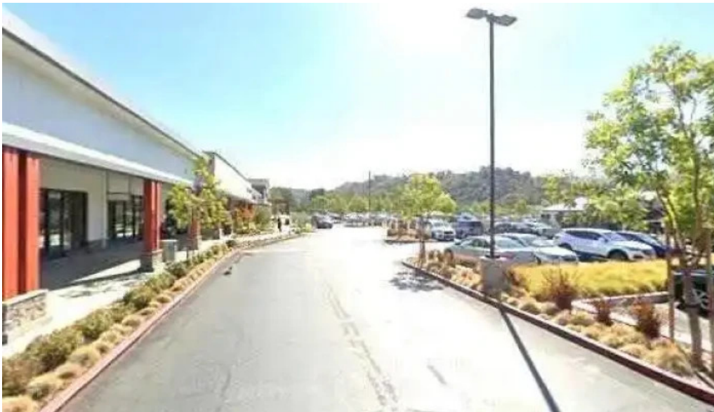
Alloy personal training rossmoor street view 360deg